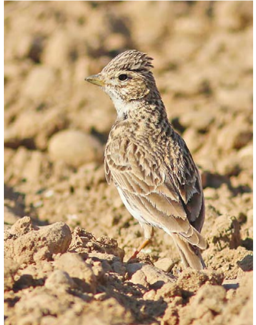
283 African Grey Woodpecker / Grijsgroene Specht Dendropicos goertae , female, north of Ouadâne, Adrar, Mauritania, 21 April 2017 284 Lesser Short-toed Lark / Kleine Kortteenleeuwerik Alaudala rufescens , Gillonay, Isère, France, 23 April 2017 285 Radde's Accentor / Steenheggenmus Prunella ocularis , Liyah reserve, Kuwait, 31 March 2017