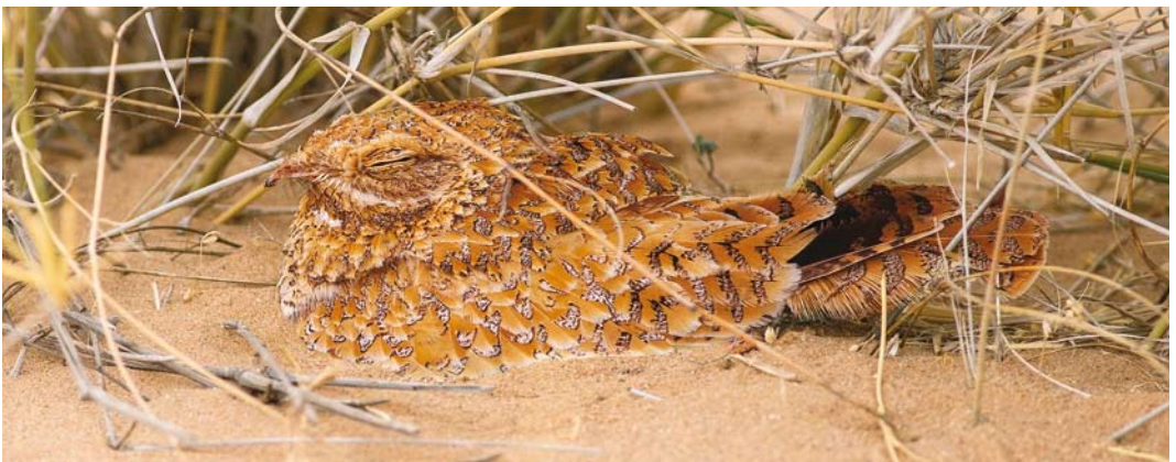
272 Blue-cheeked Bee-eater / Groene Bijeneter Merops persicus , Jandía, Fuerteventura, Canary Islands, 9 April 2017 ( Rubén Cerdeña ) 273 White-backed Vulture / Witruggier Gyps africanus , adult, Bir Shalatayn, Egypt, 25 March 2017 ( Heiko Krätzel ) 274 Pied-billed Grebe / Dikbekfuut Podilymbus podiceps , adult, Venda Nova, Codeçoso, Montalegre, Portugal, 16 March 2017 ( José Frade ) 275 Pectoral Sandpiper / Gestreepte Strandloper Calidris melanotos , Constantine, Algeria, 1 May 2017 ( Aissa Djamel Filali ) 276 Golden Nightjar / Goudgele Nachtzwaluw Caprimulgus eximius , Oued Jenna, Aousserd, Oued Ad-Deheb, Western Sahara, Morocco, 29 April 2017 ( Sander Bot )