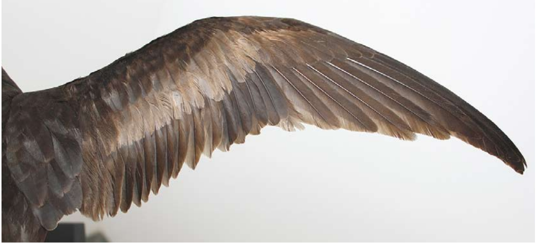
255 Bulwer's Petrel / Bulwers Stormvogel Bulweria bulwerii (picked up alive at Kressbachsee, Baden-Württemberg, Germany, on 20 July 2015), Staatliches Museum für Naturkunde, Stuttgart, Baden-Württemberg, Germany, 16 October 2016 (Andreas Hachenberg). Stretched upperwing.

ties committee of Morocco (table 2). The spatial distribution of the records (figure 1) shows that the German bird is the first for Central Europe and the first inland in the Western Palearctic.