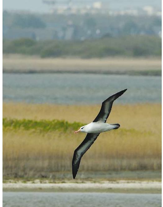
265 Three-banded Plover / Driebandplevier Charadrius tricollaris , adult, Aswan, Egypt, 4 May 2017 (Claes Wikström/ bigyearwp.com ) 266 Black-browed Albatross / Wenkbrauwalbatros Thalassarche melanophris , adult, Rantumbecken, Sylt, Schleswig-Holstein, Germany, 21 April 2017 (Martin Gottschling) 267 Black-browed Albatross / Wenkbrauwalbatros Thalassarche melanophris , adult, with Common Eiders / Eiders Somateria mollissima , Rantumbecken, Sylt, Schleswig-Holstein, Germany, 21 April 2017 (Martin Gottschling)