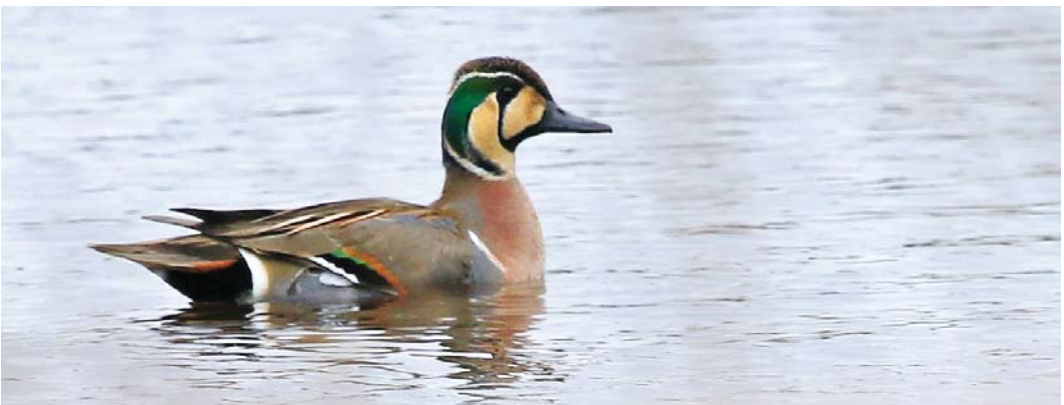
294 Grijsze Wouw / Black-winged Kite Elanus caeruleus , Robbenoordbos, Wieringermeer, Noord-Holland, 31 maart 2017 ( Fred Visscher ) 295 Vermoedelijke hybride Schreeuwarend x Bastaardarend / presumed hybrid Lesser Spotted x Greater Spotted Eagle Aquila clanga x pomarina , subadult, Losser, Overijssel, 30 maart 2017 ( Ben Hulsebos ) 296 Lammergier / Bearded Vulture Gypaetus barbatus , tweede-kalenderjaar, Delft, Zuid-Holland, 12 maart 2017 ( Wietze Janse ) 297 Provençaalse Grasmus / Dartford Warbler Sylvia undata , Berkheide, Zuid-Holland, 22 april 2017 ( Arjan van Egmond ) 298 Siberische Taling / Baikal Teal Anas formosa , mannetje, Noordwijkerhout, Zuid-Holland, 25 februari 2017 ( Jan Miske )