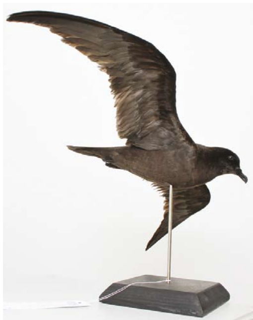
253 Bulwer's Petrel / Bulwers Stormvogel Bulweria bulwerii (picked up alive at Kressbachsee, Baden-Württemberg, Germany, on 20 July 2015), Staatliches Museum für Naturkunde, Stuttgart, Baden-Württemberg, Germany, 16 October 2016