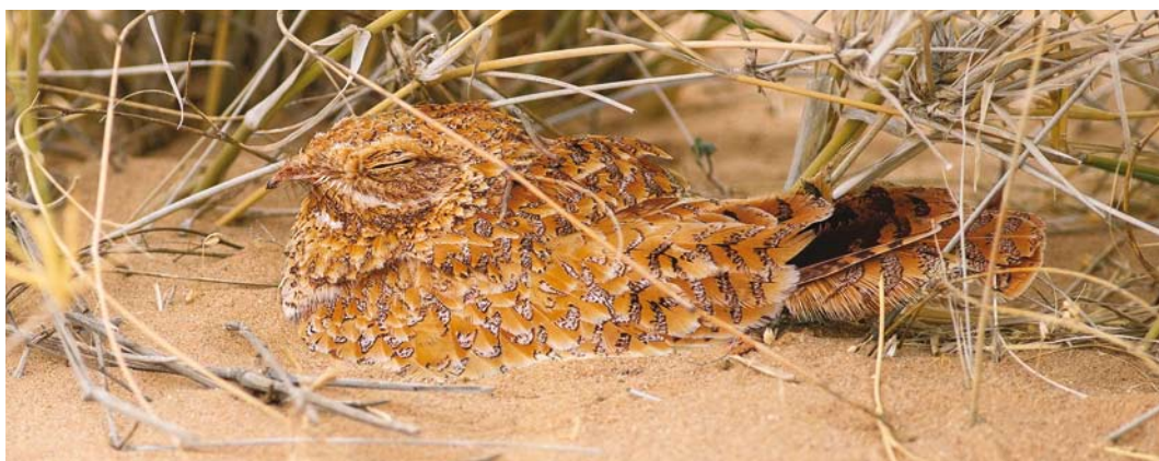
272 Blue-cheeked Bee-eater / Groene Bijeneter Merops persicus , Jandía, Fuerteventura, Canary Islands, 9 April 2017 273 White-backed Vulture / Witruggier Gyps africanus , adult, Bir Shalatayn, Egypt, 25 March 2017 274 Pied-billed Grebe / Dikbekfuut Podilymbus podiceps , adult, Venda Nova, Codeçoso, Montalegre, Portugal, 16 March 2017 275 Pectoral Sandpiper / Gestreepte Strandloper Calidris melanotos , Constantine, Algeria, 1 May 2017 276 Golden Nightjar / Goudgele Nachtzwaluw Caprimulgus eximius , Oued Jenna, Aousserd, Oued Ad-Deheb, Western Sahara, Morocco, 29 April 2017