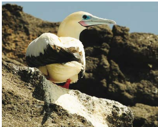
235 Red-footed Booby / Roodpootgent Sula sula , adult, Raso, Cape Verde Islands, 14 March 2013