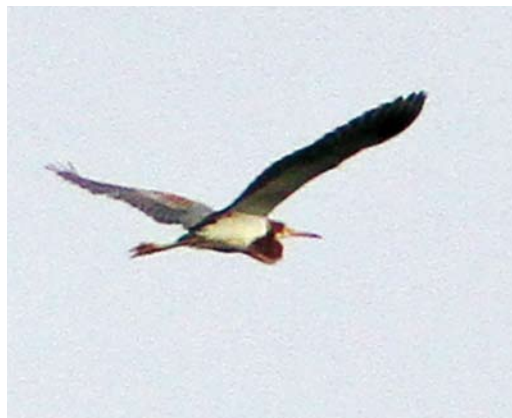
234 Tricolored Heron / Witbuikreiger Egretta tricolor , juvenile, Cabo da Praia, Terceira, Azores, 20 October 2012 (Dominic Mitchell)

Mitchell (2017) suggests that the record from the Canary Islands concerned the same individual as a bird in the Azores in October 2007.