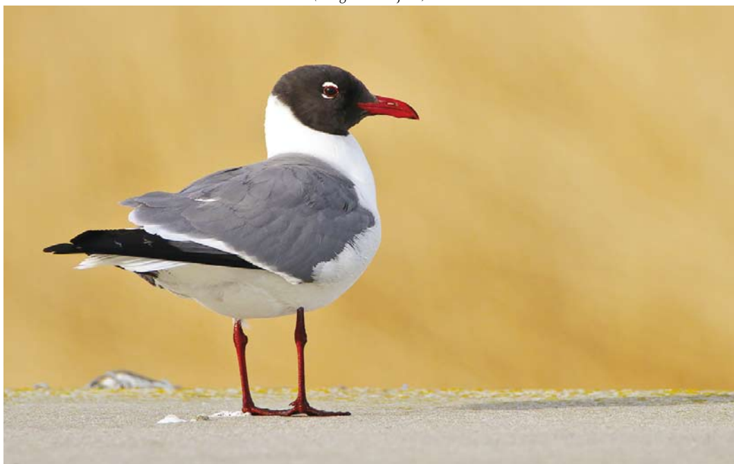
271 Laughing Gull / Lachmeeuw Larus atricilla , adult, Nowa Pasłęka, Warmińsko-Mazurskie, Poland, 26 April 2017 (Zbigniew Kajzer)