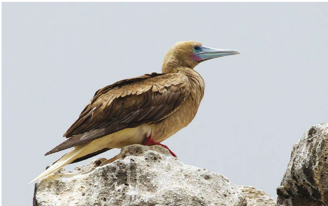
270 Red-footed Booby / Roodpootgent Sula sula , adult, Raso, Cape Verde Islands, 2 April 2017 (Kris De Rouck)