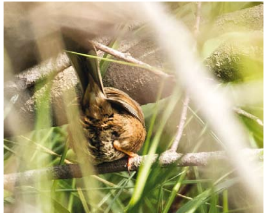
259-262 Tristram's Warbler / Atlasgrasmus Sylvia deserticola , male, Montpellier, Hérault, France, 7 May 2016 (Damien Gailly)