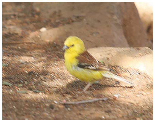
84 Pine Bunting / Witkopgors Emberiza leucocephalos , male, Widoioie, Limburg, Belgium, 31 December 2016 ( Vincent Legrand ) 85 Caspian Stonechat / Kaspische Roodborsttapuit Saxicola maurus hemprichii , Linosa, Italy, 25 November 2016 ( Ottavio Janni ) 86 Pine Bunting / Witkopgors Emberiza leucocephalos , male, Pikrolimni lake, Thessaloniki, Greece, 6 January 2017 ( Antonis Tsaknakis/birdinggreece.gr ) 87 Dark-eyed Junco / Grijsze Junco Junco hyemalis , adult male, West Mersea, Essex, England, 8 December 2016 ( Steve Grimwade ) 88 Basalt Wheatear / Basalttapuit Oenanthe lugens warriar , Ovda valley, Israel, 17 January 2017 ( Lior Kislev ) 89 Sudan Golden Sparrow / Bruinruggoudmus Passer luteus , male, Pajara, Fuerteventura, Canary Islands, 28 December 2016 ( Eckhard Möller )