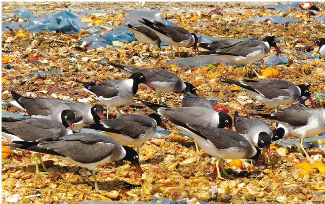
22 White-eyed Gulls / Witoogmeeuwen Larus leucophthalmus , adult summer, Hurghada, Egypt, 10 June 2014. Feeding at rubbish tip.