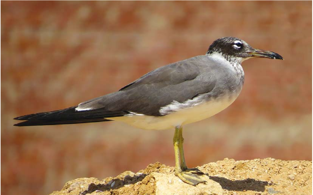
28 White-eyed Gull / Witoogmeeuw Larus leucophthalmus , second-summer type, Hurghada, Egypt, 10 June 2014 (Mohamed I Habib)