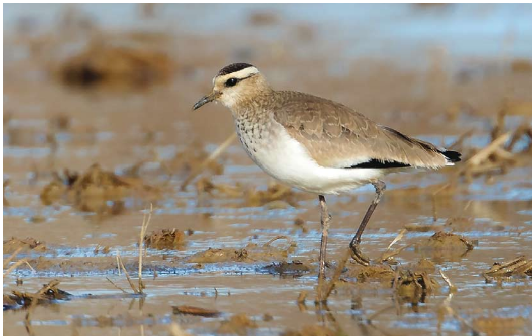
61 Sociable Lapwing / Steppiekievit Vanellus gregarius , first-winter, Ebro delta, Tarragona, Spain, 27 December 2016