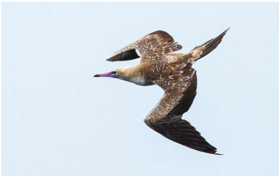
56 Red-footed Booby / Roodpootgent Sula sula , immature, Atlantic Ocean, off Cape Verde Islands, 10 January 2017