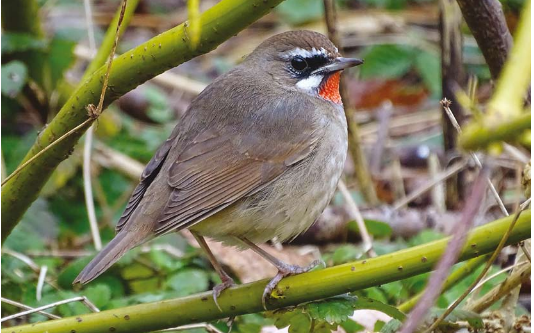
36 Roodkeelnachtegal / Siberian Rubythroat Calliope calliope , eerste-winter mannetje, Hoogwoud, Noord-Holland, 18 maart 2016 (Enno B Ebels)