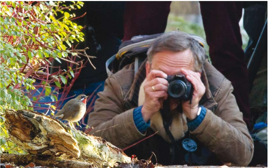
37 Roodkeelnachtegal / Siberian Rubythroat Calliope calliope , eerste-winter mannetje, Hoogwoud, Noord-Holland, 22 januari 2016