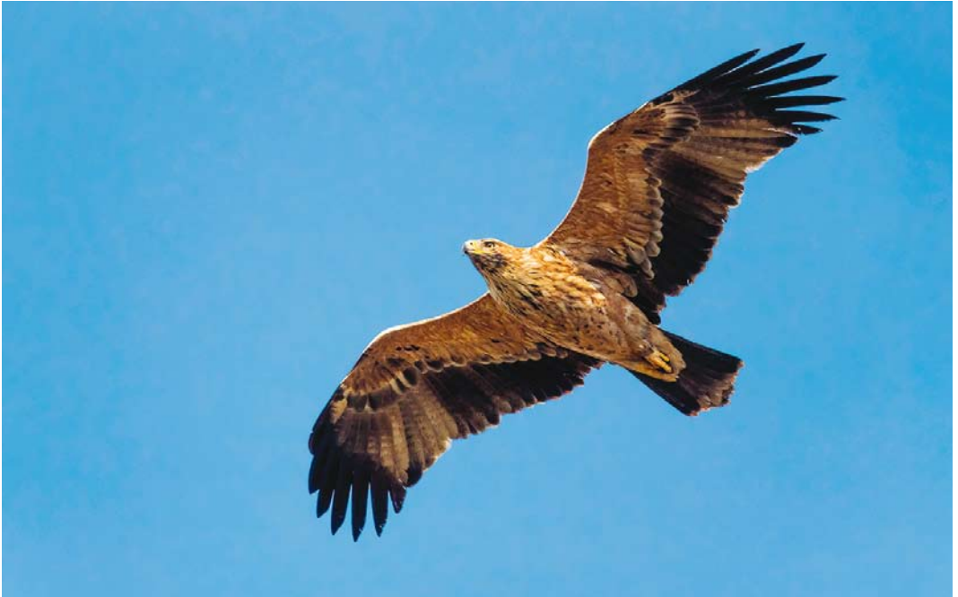
54 Spanish Imperial Eagle / Spaanse Keizerarend Aquila adalberti , immature, Lago di Massaciuccoli, Toscana, Italy, 9 January 2017 (Daniele Occhiato)