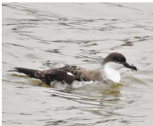
65 Harlequin Duck / Harlekijneend Histrionicus histrionicus , first-winter, Irtysk river, Öskemen, East Kazakhstan, Kazakhstan, 18 December 2016 66 Asian White-winged Scoter / Aziatische Grote Zee-eend Melanitta deglandi stejnegeri , adult male, Santa Pola, Alicante, Valencia, Spain, 9 December 2016 67 Yellow-billed Loon / Geelsnavelduiker Gavia adamsii , first-winter, Diemelsee, Hessen, Germany, 20 December 2016 68 Great Shearwater / Grote Pijlstormvogel Puffinus gravis , Hamburg-Altona, Hamburg, Germany, 18 December 2016

The fourth for Belgium was photographed at Mur de Lixhe, Liège, on 27-31 December and 4 January. If accepted, a first-winter flying past Asserbo Strand and Kikhavn, Sjælland, on 30 December will be the second for Denmark. Apparently, an Audouin's Gull L. audouinii at Bel Air on 28 October was the first for Guinea. A first-year at Brickfields, Trinidad, Trinidad & Tobago, on 10-12 December was the first for the New World. The number of breeding pairs on Vendicari, Sicily, increased from the first in 2010 to 130 in 2016 ( Avocetta 40: 71-76, 2016). Up to four first-winter Relict Gulls L. relictus on the ice at Gulpo on 26-27 November constituted the second record for North Korea (the first concerned five individuals in the same area in late March 2014). An adult Ring-billed Gull L. delawarensis photographed at the eastern Caspian coast of Aktau, Mangystau, on 7 January 2015 and again on 5 November 2015 and 3 and 29 December