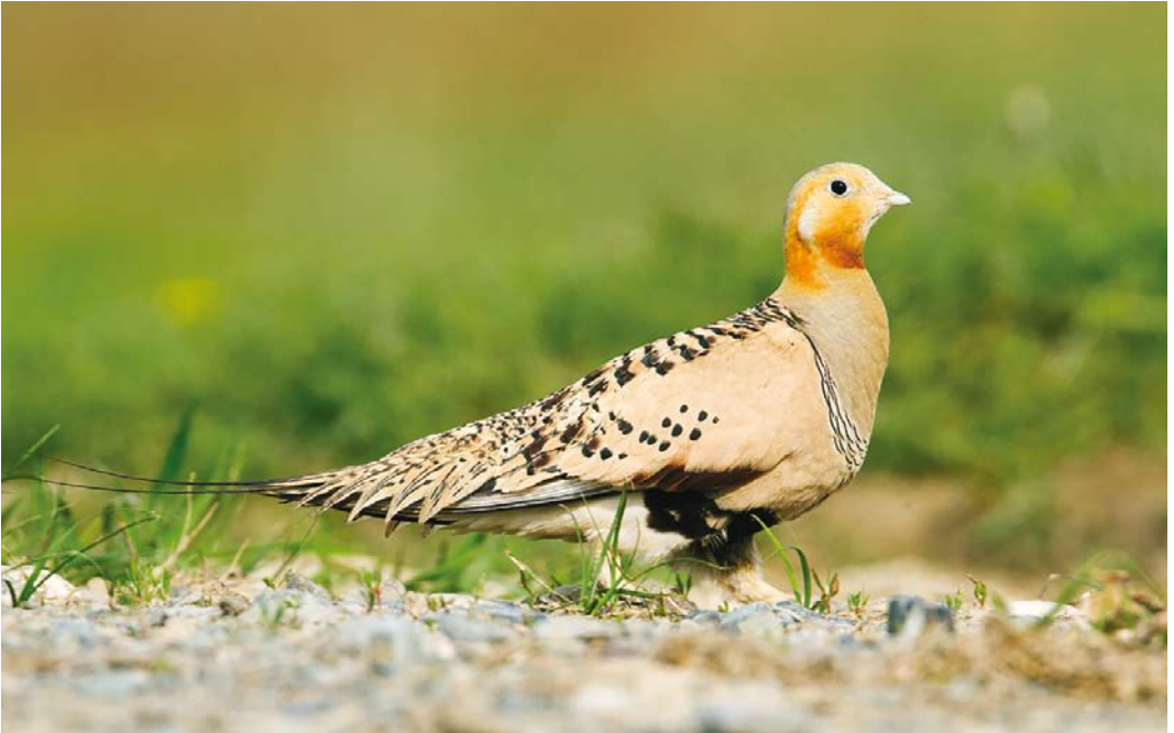
46 Pallas's Sandgrouse / Steppehoen Syrhaptes paradoxus , male, between Zaysan lake and Tarbagatai mountains, East Kazakhstan, Kazakhstan, 25 May 2014 ( Ralph Martin )