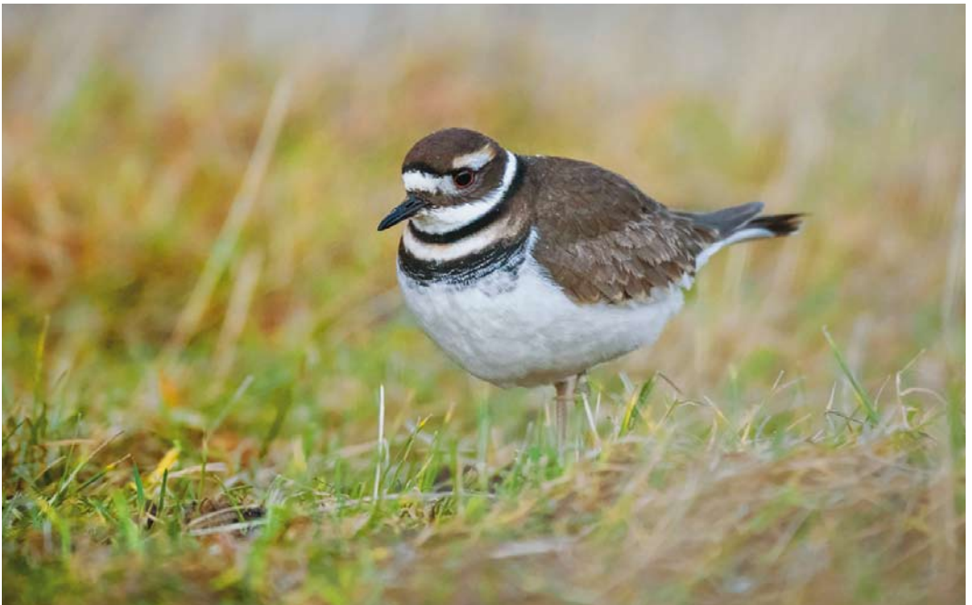
64 Killdeer / Killdeerplevier Charadrius vociferus , first-winter, Bjørøya, Nord-Trøndelag, Norway, 24 December 2016