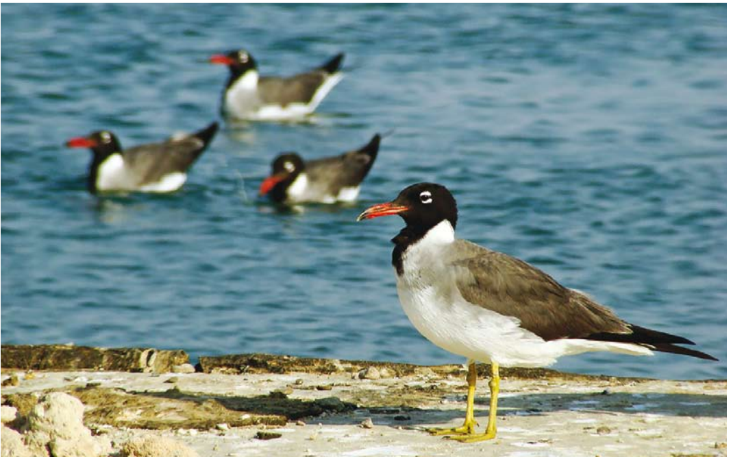
23 White-eyed Gulls / Witoogmeeuwen Larus leucophthalmus , adult summer, Hurghada, Egypt, 12 July 2008 (Mohamed I Habib)