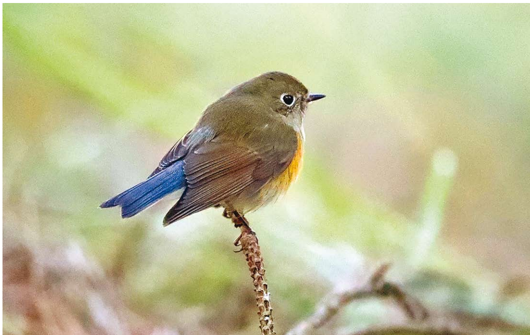
91 Blauwstaart / Red-flanked Bluetail Tarsiger cyanurus , eerstejaars, Berkheide, Zuid-Holland, 6 december 2016 ( René van Rossum )