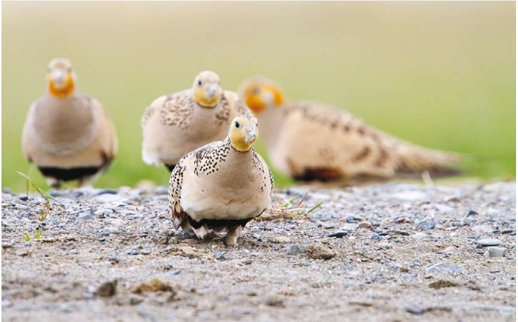
52 Pallas's Sandgrouse / Steppehoenders Syrrhaptes paradoxus , males (left and right) and females (centre), between Zaysan lake and Tarbagatai mountains, East Kazakhstan, Kazakhstan, 25 May 2014 (Ralph Martin)

June 1990; in Nord-Trøndelag, Norway, in July–November 1990; at Kuusamo, Finland, in June 1992; and at Askola, Lappeenranta, Finland, in July–August 2010 (Slack 2009; cf Dutch Birding 32: 336, 2010).