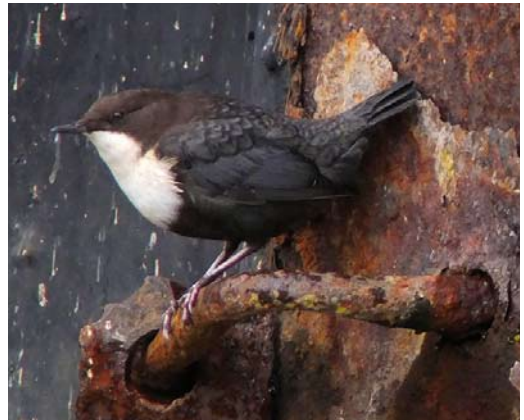
103 Witkopgors / Pine Bunting Emberiza leucocephalos , mannetje, Camping Loodmansduin, Texel, Noord-Holland, 19 december 2016 ( Eric Menkveld ) 104 Witkopgors / Pine Bunting Emberiza leucocephalos , vrouwtje, IJmuiden, Noord-Holland, 23 november 2016 ( Arnoud B van den Berg ) 105 Zwartbuikwaterspreeuw / Black-bellied Dipper Cinclus cinclus cinclus , Wildlands Adventure Zoo, Emmen, Drenthe, 22 december 2016 ( Frank van der Wielen ) 106 Zwartbuikwaterspreeuw / Black-bellied Dipper Cinclus cinclus cinclus , Wieringerwerf, Noord-Holland, 17 november 2016 ( Luuk Punt )

Holland. Tot 2016 waren er slechts vier gevallen. Een eerste-kalenderjaar mannetje Woestijntapuit Oenanthe deserti verbleef op 6 november op het strand op de noordpunt van Texel.