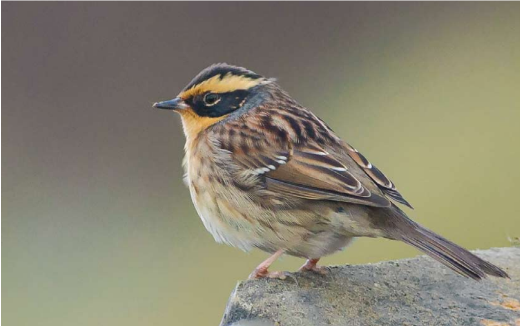
78 Siberian Accentor / Bergheggenmus Prunella montanella , Hirtshals havn, Nordjylland, Denmark, 7 January 2017