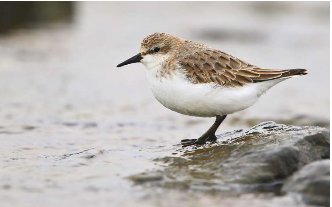
62 Red-necked Stint / Roodkeelstrandloper Calidris ruficollis , first-winter, Vejbystrand, Skåne, Sweden, 5 December 2016