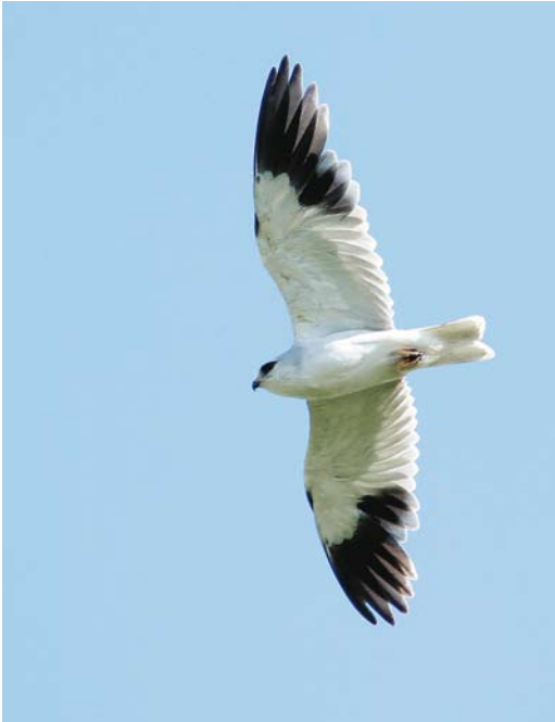
6 Black-winged Kite / Grijze Wouw Elanus caeruleus caeruleus , Zichow, Brandenburg, Germany, 29 June 2016 (Zbigniew Kajzer)