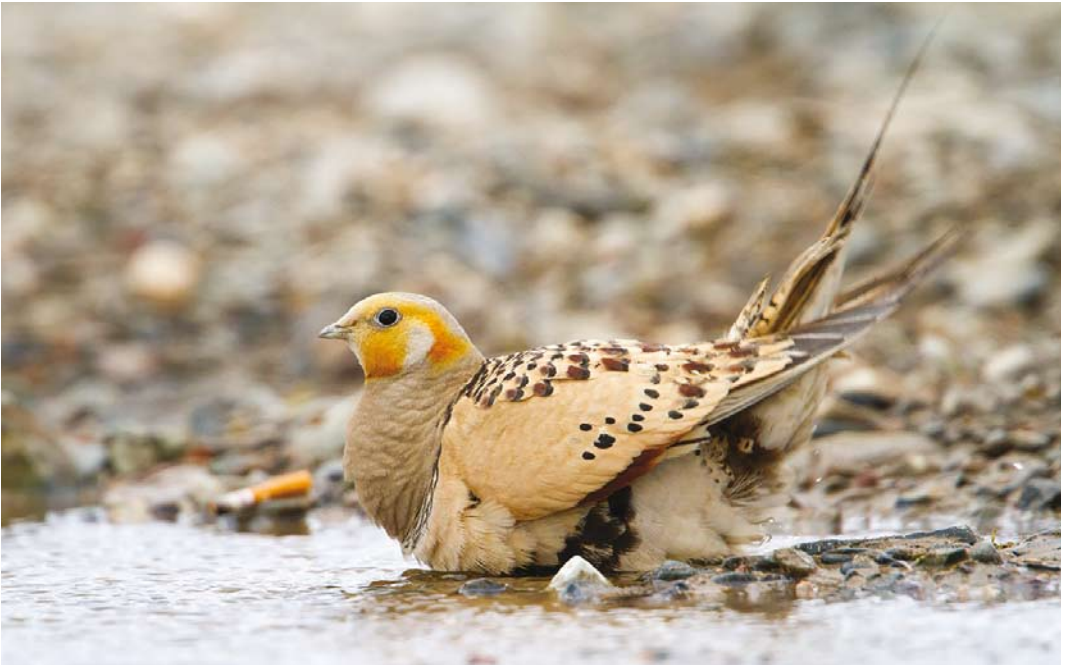
49 Pallas's Sandgrouse / Steppehoen Syrrhaptes paradoxus , male, between Zaysan lake and Tarbagatai mountains, East Kazakhstan, Kazakhstan, 25 May 2014 (Ralph Martin). Collecting water with belly-feathers.