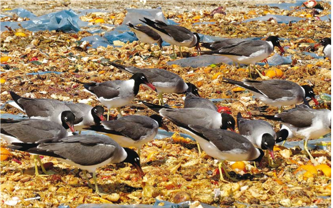
22 White-eyed Gulls / Witoogmeeuwen Larus leucophthalmus , adult summer, Hurghada, Egypt, 10 June 2014 (Mohamed I Habib). Feeding at rubbish tip.