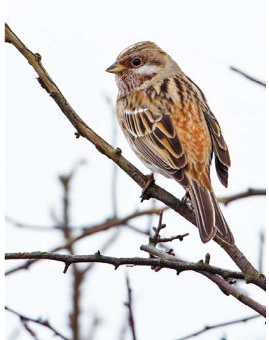
93 Blauwstaart / Red-flanked Bluetail Tarsiger cyanurus , eerstejaars, Berkheide, Zuid-Holland, 6 december 2016 94 Witkopgors / Pine Bunting Emberiza leucocephalos , mannetje, Camping Loodmansduin, Texel, Noord-Holland, 8 januari 2017 95 Woestijntapuit / Desert Wheatear Oenanthe deserti , eerste-winter mannetje, Paal 29, Texel, Noord-Holland, 6 november 2016