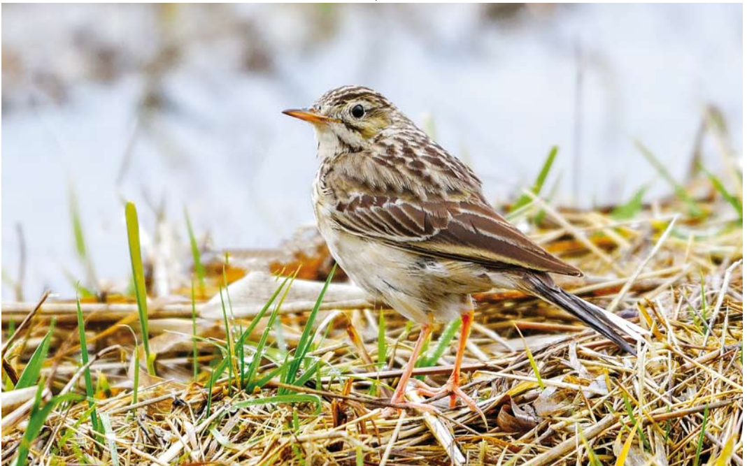
79 Blyth's Pipit / Mongoolse Pieper Anthus godlewskii , first-winter, Brabantse Biesbosch, Noord-Brabant, Netherlands, 15 January 2017