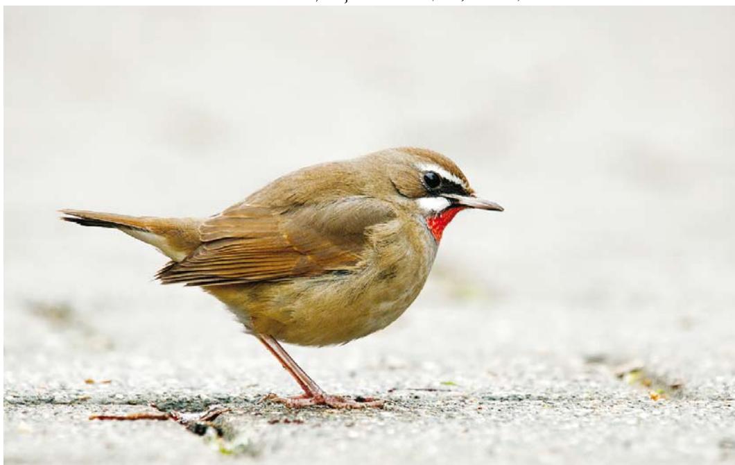
33 Roodkeelnachtegal / Siberian Rubythroat Calliope calliope , eerste-winter mannetje, Hoogwoud, Noord-Holland, 21 januari 2016 ( Leo J R Boon )