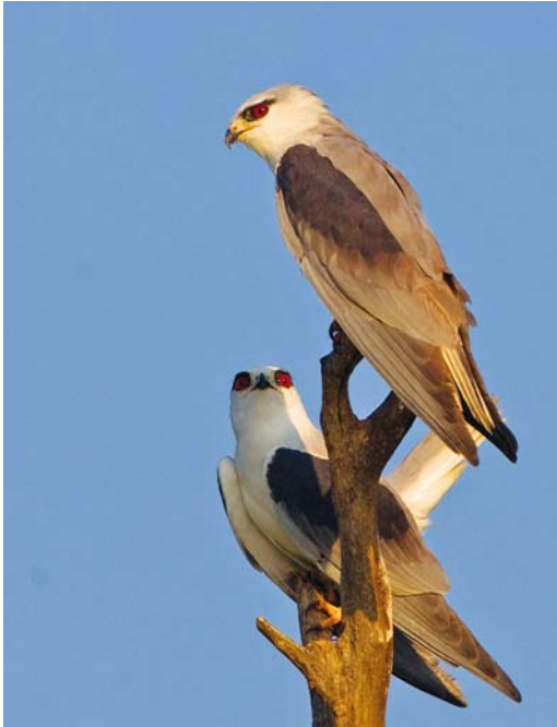
4 Black-winged Kites / Grijsze Wouwen Elanus caeruleus vociferus , pair, Hula valley, Israel, 27 November 2011