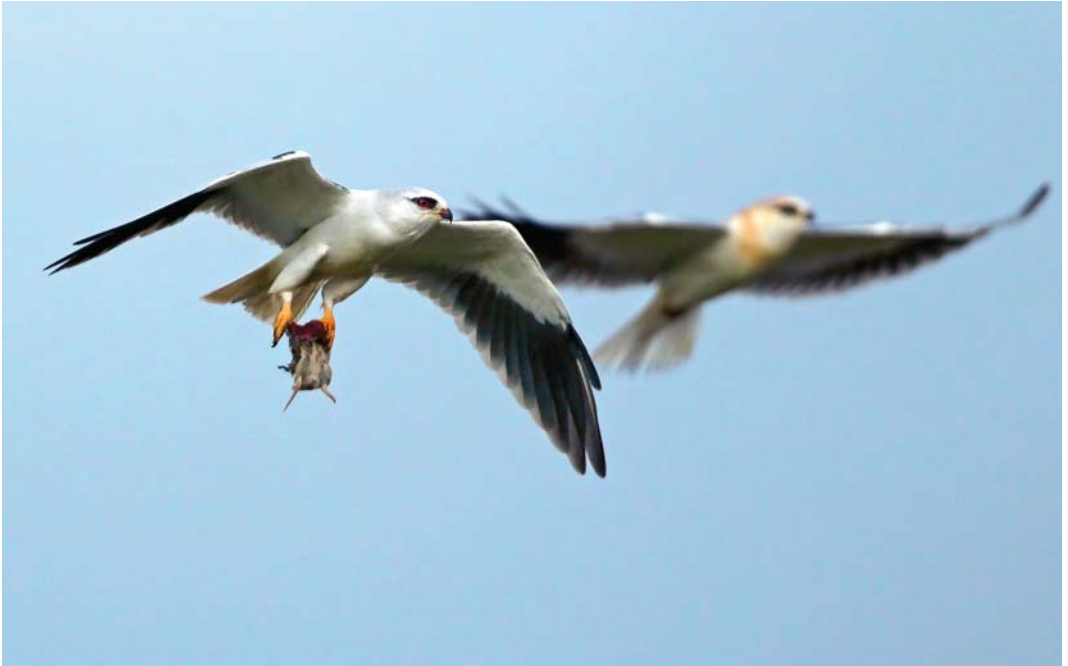
2 Black-winged Kites / Grijze Wouwen Elanus caeruleus vociferus , adult with juvenile, Hula valley, Israel, 19 November 2011