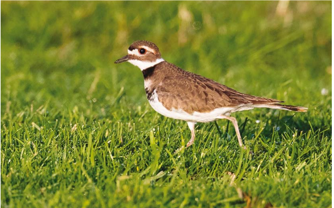
63 Killdeer / Killdeerplevier Charadrius vociferus , first-winter, Sandwick, Mainland, Shetland, Scotland, 13 December 2016