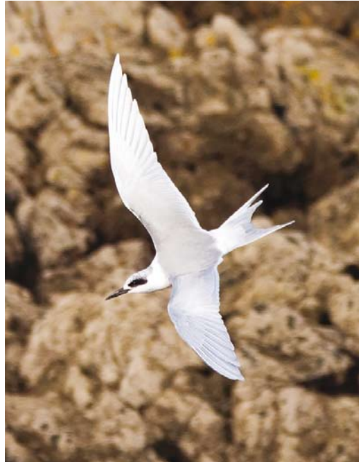
58 American Herring Gull / Amerikaanse Zilvermeeuw Larus smithsonianus , third-winter, Portimão, Algarve, Portugal, 4 December 2016 59 Forster's Tern / Forsters Stern Sterna forsteri , adult, Playa de Santa Cruz, Oleiros, A Coruña, Spain, 3 December 2016 60 Ring-billed Gull / Ringsnavelmeeuw Larus delawarensis , adult (front), with Mew Gull / Stormmeeuw L. canus , Aktau, Mangystau, Kazakhstan, 3 December 2016