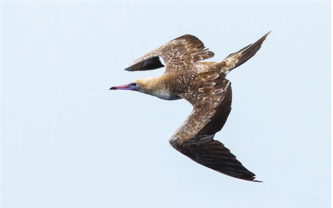
56 Red-footed Booby / Roodpootgent Sula sula , immature, Atlantic Ocean, off Cape Verde Islands, 10 January 2017 (René Pop)