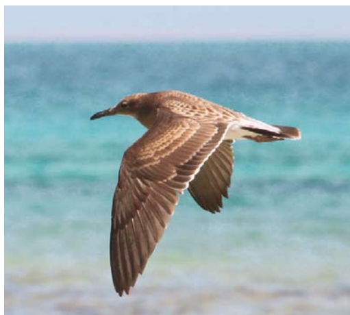
18 White-eyed Gulls / Witoogmeeuwen Larus leucophthalmus , off Hurghada, Egypt, 12 August 2014 (Mohamed I Habib). Adult guarding two fledglings. 19 White-eyed Gull / Witoogmeeuw Larus leucophthalmus , juvenile, Hurghada, Egypt, 25 September 2014 (Mohamed I Habib) 20 White-eyed Gull / Witoogmeeuw Larus leucophthalmus , first-summer, Hurghada, Egypt, 8 June 2014 (Mohamed I Habib) 21 White-eyed Gull / Witoogmeeuw Larus leucophthalmus , juvenile, Hurghada, Egypt, 12 October 2015 (Mohamed I Habib)

hotels and private villas and the main sewage ponds are used for drinking (see above). In 1998, the Red Sea Governor banned the burning of rubbish in open fires, enabling the gulls to take advantage of the garbage dump. The species increased rapidly and its main breeding colony moved from the northern islands to Umm Gawish in front of Hurghada city. This island is relatively undisturbed because it is not important to the diving business. It mainly offers protection from wind and landing space for the daily boats and safari boats. Where habitats are not disturbed, most bird numbers remain relatively stable over long periods. Breeding numbers may fluctuate from year to year but within narrow limits. The low number of nests (1450) on Umm Gawish in 2015 may have been due to the unusually high temperatures reaching 52°C on one day in late May.