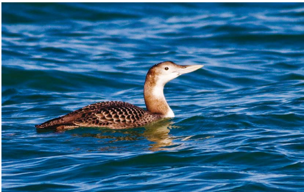
55 Yellow-billed Loon / Geelsnavelduiker Gavia adamsii , first-winter, Balatonföldvár, Balaton lake, Hungary, 3 December 2016