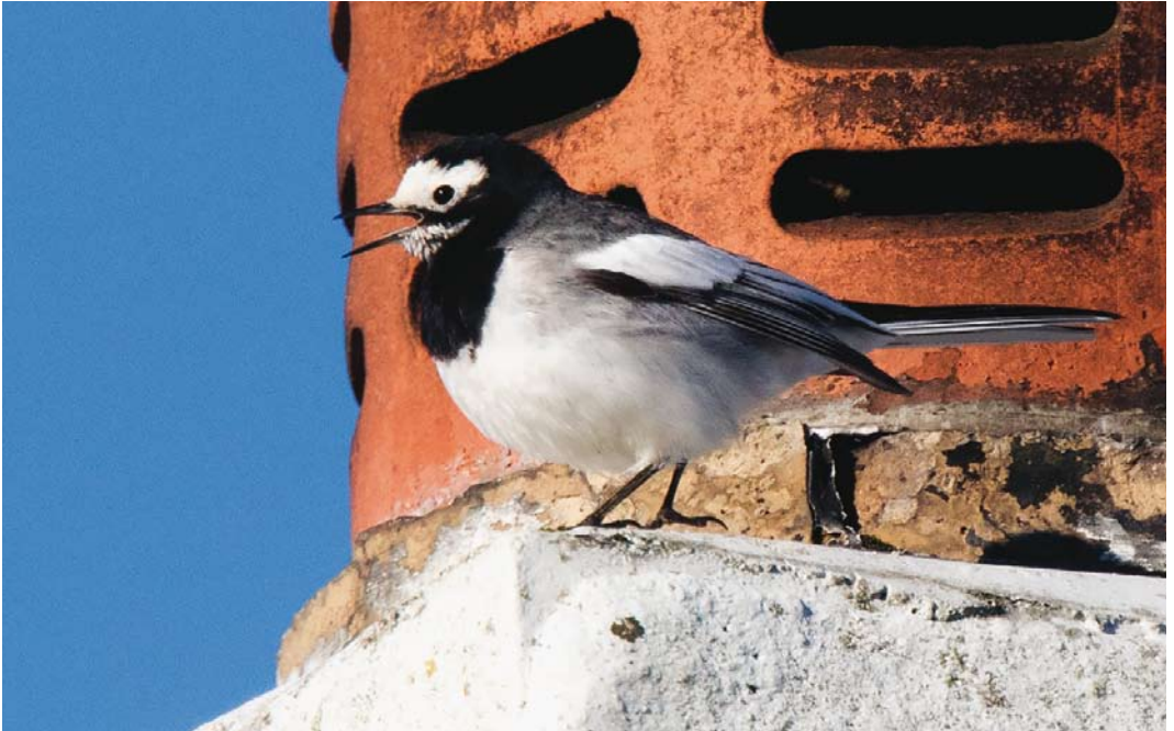
82 Masked Wagtail / Maskerkwikstaart Motacilla personata , first-winter male, Camrose, Pembrokeshire, Wales, 30 November 2016 (Steve Gantlett)