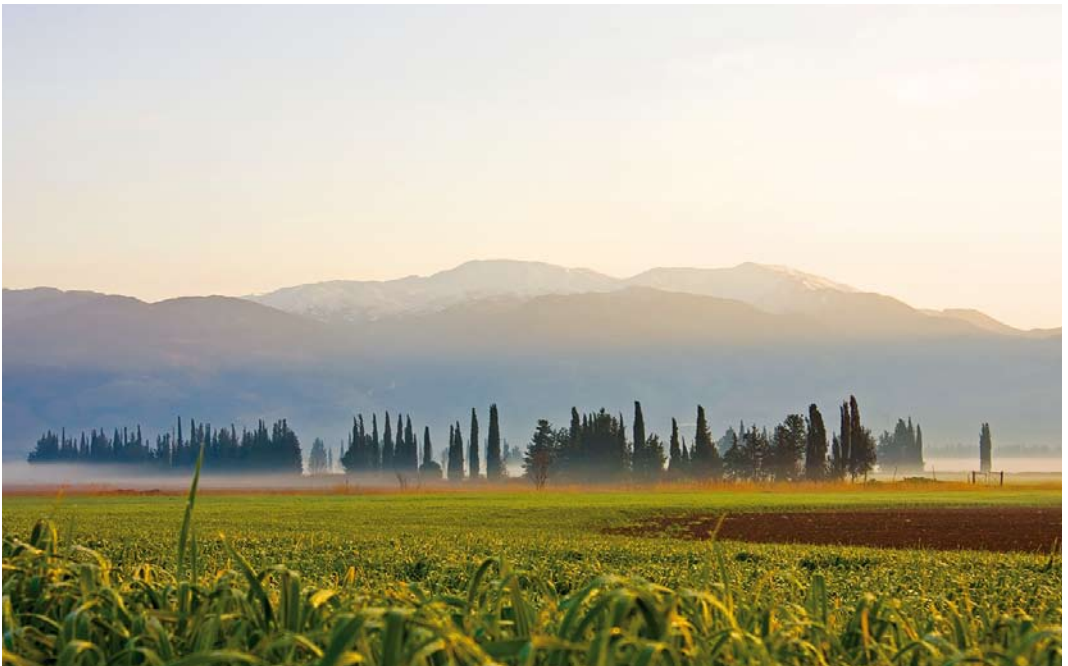
3 Breeding habitat of Black-winged Kite Elanus caeruleus , Hula valley, Israel, 17 February 2008 (Thomas Krumenacker)