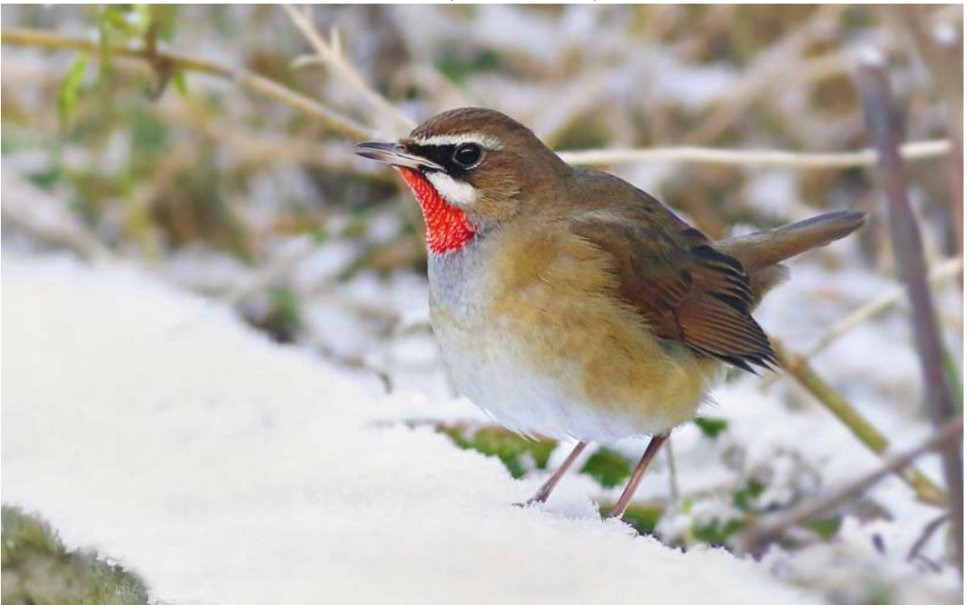
31 Roodkeelnachtegal / Siberian Rubythroat Calliope calliope , eerste-winter mannetje, Hoogwoud, Noord-Holland, 17 januari 2016