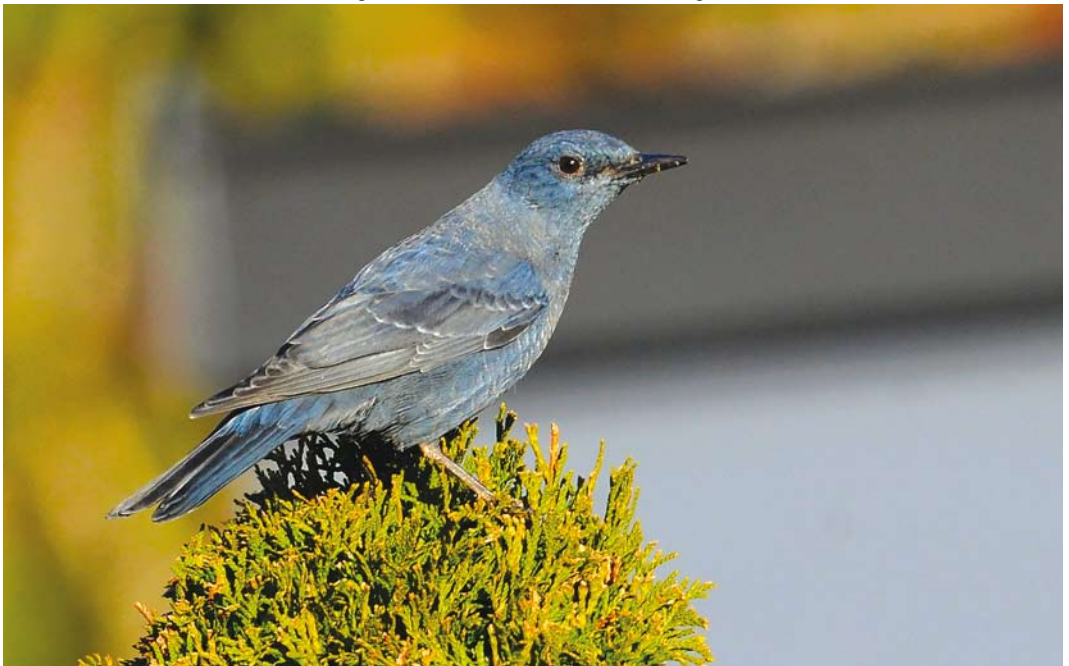
81 Blue Rock Thrush / Blauwe Rotslijster Monticola solitarius , adult male, Stow-on-the-Wold, Gloucestershire, England, 28 December 2016 ( John Pringle )