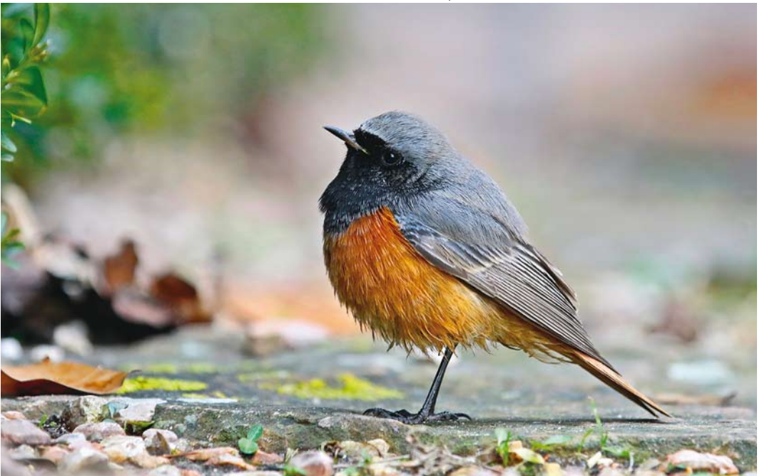
77 Eastern Black Redstart / Oosterse Zwarte Roodstaart Phoenicurus ochruros phoenicuroides , first-winter male, Barendrecht, Zuid-Holland, Netherlands, 14 January 2017