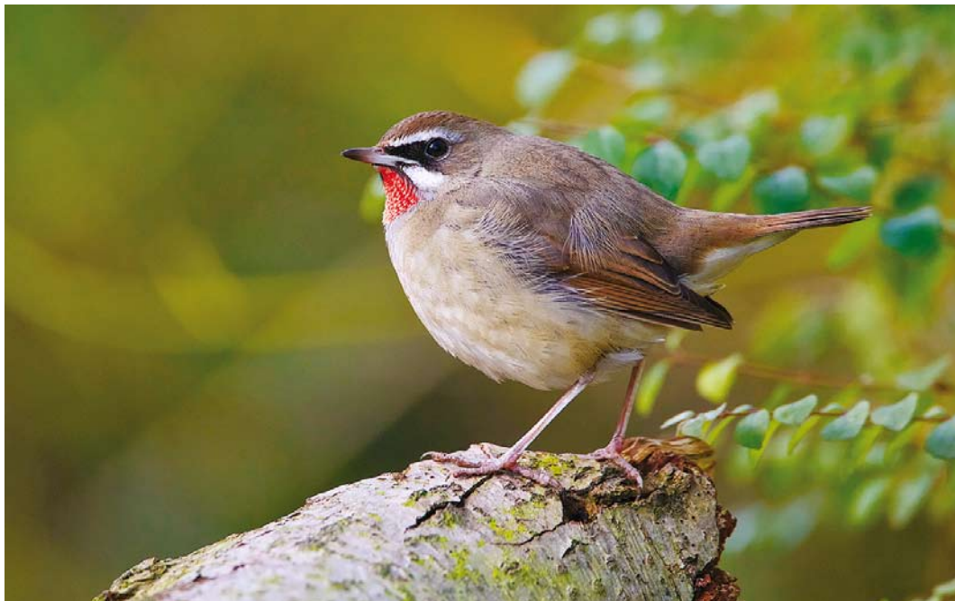
32 Roodkeelnachtegal / Siberian Rubythroat Calliope calliope , eerste-winter mannetje, Hoogwoud, Noord-Holland, 22 januari 2016 ( Martin van der Schalk )