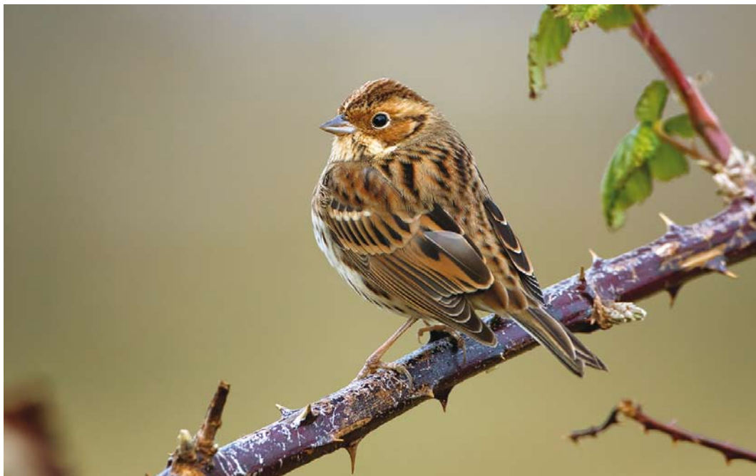
99 Dwerggorz / Little Bunting Emberiza pusilla , Noordwijk, Zuid-Holland, 7 december 2016