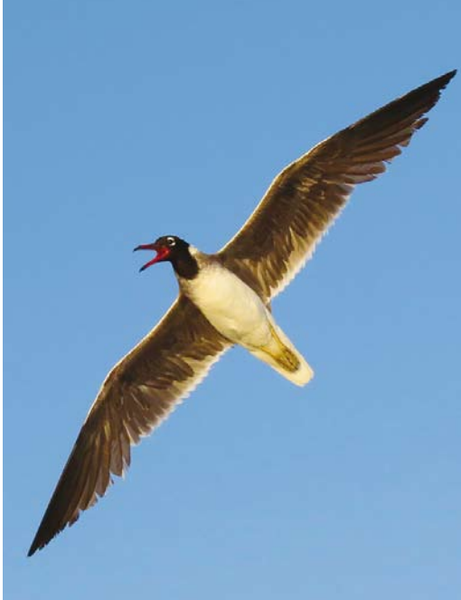
12 White-eyed Gull / Witoogmeeuw Larus leucophthalmus , adult summer, off Hurghada, Egypt, 12 August 2014 (Mohamed I Habib). Protecting breeding area.

(Cramp & Simmons 1977) and 1500-2000 pairs on islands off Hurghada and at the mouth of the Gulf of Suez, as estimated in 1983 and 1984 (Jennings et al 1985). Quantitative information is lacking on the number of individuals breeding on islands further south (Goodman & Meininger 1989). Jennings et al (1985) estimated that 30% of the world's population breeds on islands at the mouth of the Gulf of Suez. Baha El Din (1999) estimated the population in the Egyptian Red Sea at 10 000 indi-