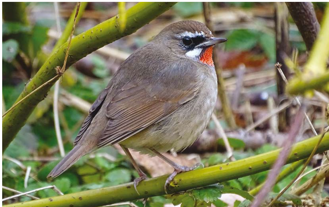
36 Roodkeelnachtegal / Siberian Rubythroat Calliope calliope , eerste-winter mannetje, Hoogwoud, Noord-Holland, 18 maart 2016