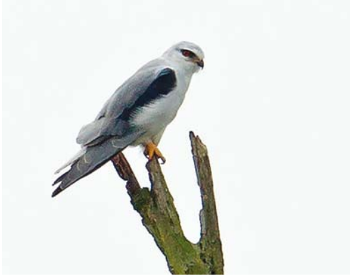
8 Black-winged Kite / Grijsze Wouw Elanus caeruleus caeruleus , Geel-Mosselgoren, Antwerpen, Belgium, 7 June 2016 ( Kris De Rouck )