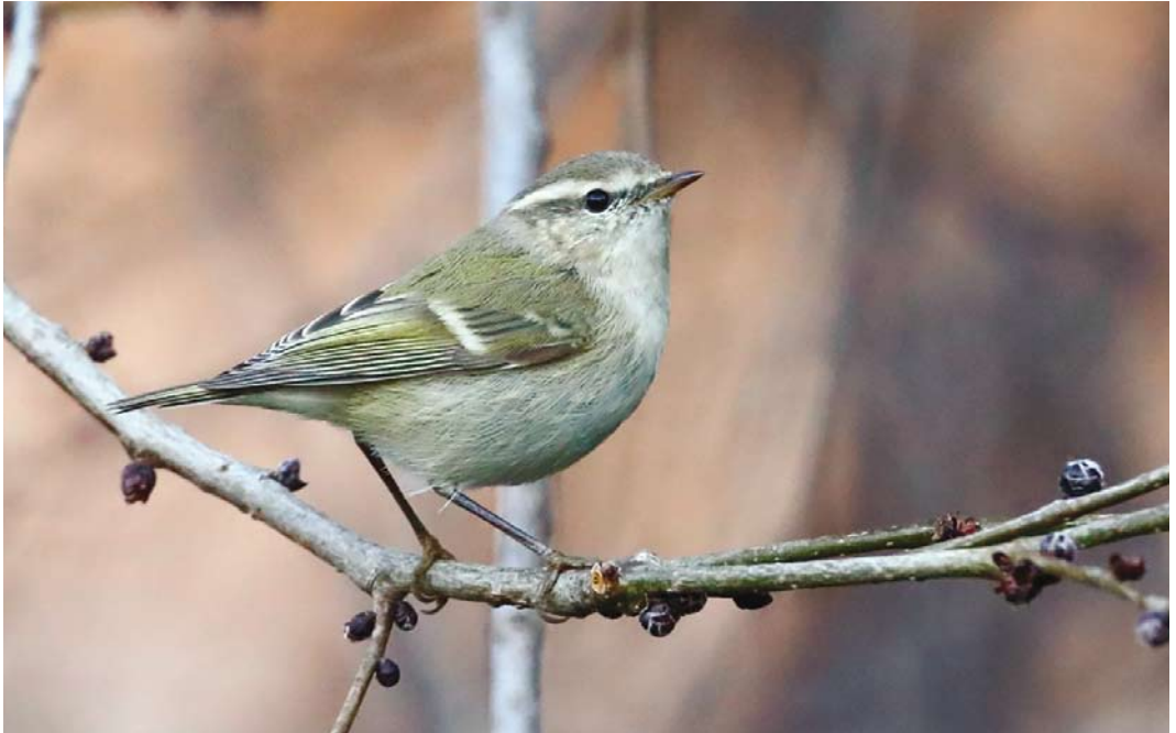
80 Hume's Leaf Warbler / Humes Bladkoning Phylloscopus humei , Montjuïc, Barcelona, Catalunya, Spain, 24 December 2016 ( Rafael Armada )