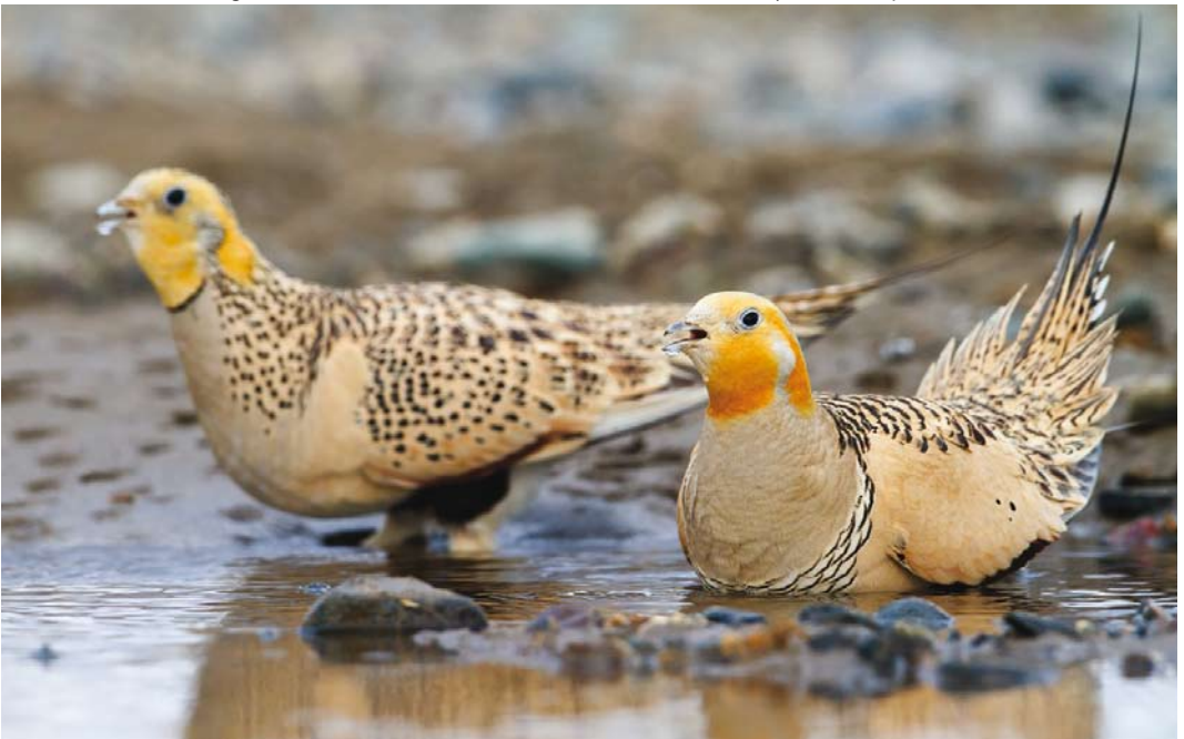
47 Pallas's Sandgrouse / Steppehoenders Syrhaptes paradoxus , male (right) and female, between Zaysan lake and Tarbagatai mountains, East Kazakhstan, Kazakhstan, 25 May 2014