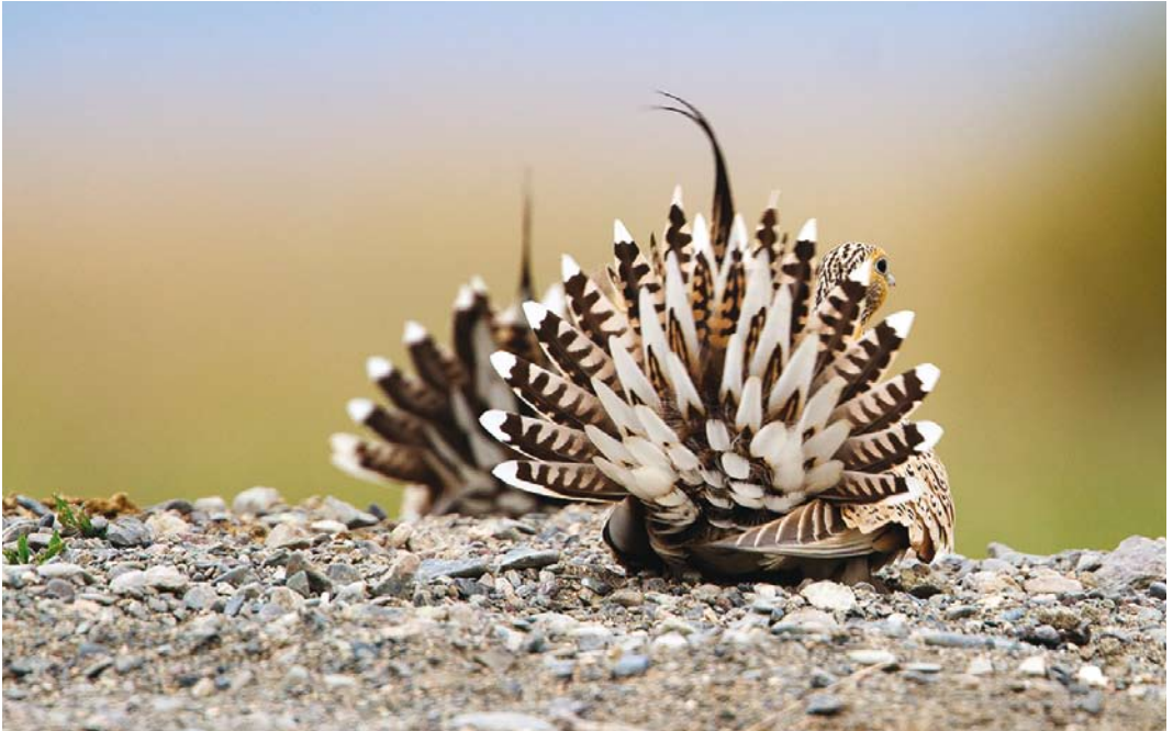
50 Pallas's Sandgrouse / Steppehoenders Syrrhaptes paradoxus , females, between Zaysan lake and Tarbagatai mountains, East Kazakhstan, Kazakhstan, 25 May 2014 (Ralph Martin). Displaying vent and tail-feathers.