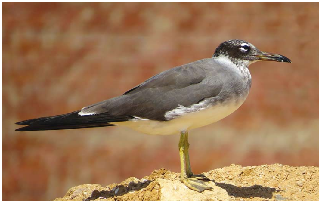
28 White-eyed Gull / Witoogmeeuw Larus leucophthalmus , second-summer type, Hurghada, Egypt, 10 June 2014