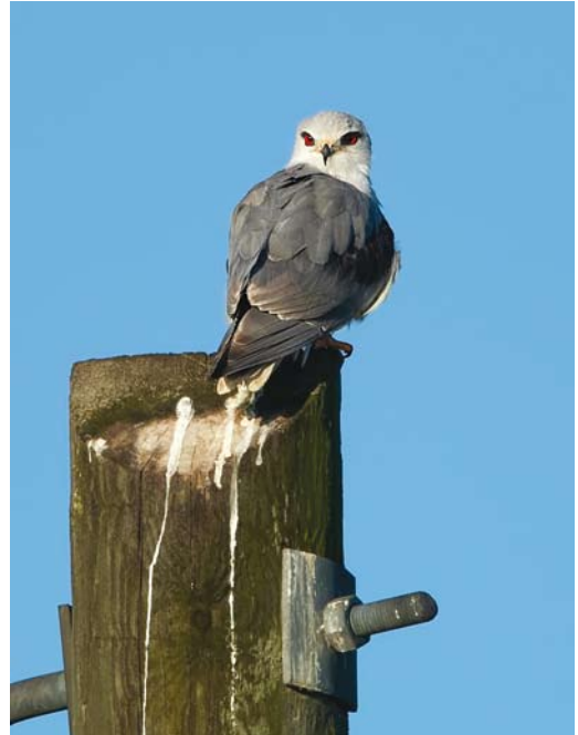
7 Black-winged Kite / Grijze Wouw Elanus caeruleus caeruleus , Zichow, Brandenburg, Germany, 3 July 2016 (Steffen Fahl)

August and November (Neil Morris in litt). From the photographs available it is clear that, as expected, they were all vociferus .