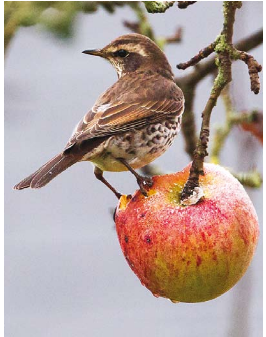
73 Presumed Asian House Martin / vermoedelijke Aziatische Huiszwaluw Delichon dasypus , Ma'agan Michael, Israel, 16 December 2016 74 Dusky Thrush / Bruine Lijster Turdus eunomus , first-winter female, Beeley, Derbyshire, England, 6 December 2016 75 Vinous-throated Parrotbill / Bruinkopdiksnavelmees Sinosuthora webbiana , Swartbroek, Limburg, Netherlands, 30 December 2016. Bird of small feral population in this area.