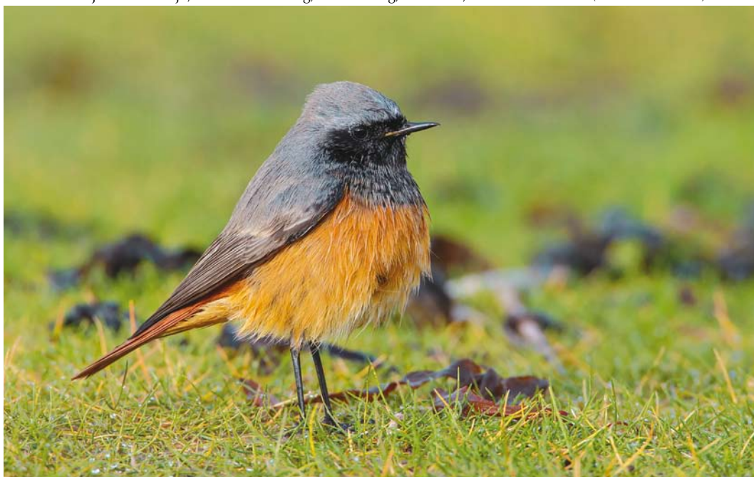
92 Oosterse Zwarte Roodstaart / Eastern Black Redstart Phoenicurus ochruros phoenicuroides , eerstejaars mannetje, West-Terschelling, Terschelling, Friesland, 5 november 2016 ( Arie Ouwerkerk )