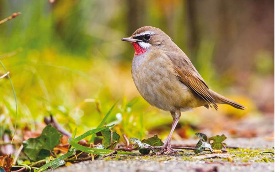
30 Roodkeelnachtegal / Siberian Rubythroat Calliope calliope , eerste-winter mannetje, Hoogwoud, Noord-Holland, 20 januari 2016 ( Alex Bos )