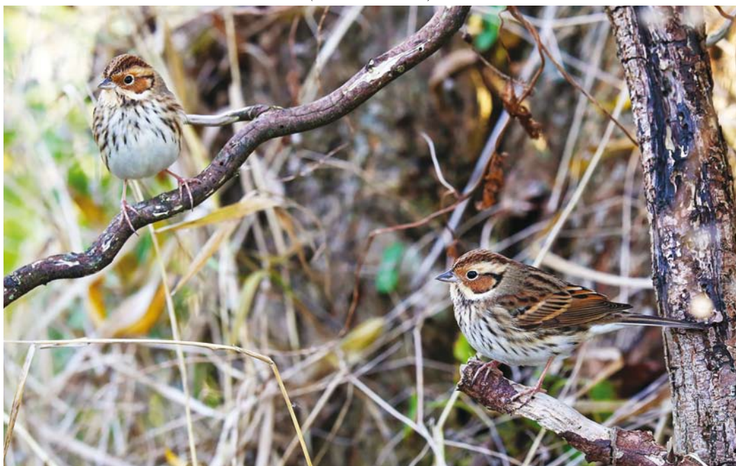
100 Dwerggorzen / Little Buntings Emberiza pusilla , Noordwijk, Zuid-Holland, 30 november 2016 (René van Rossum)