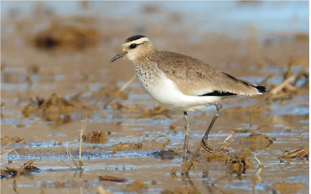
61 Sociable Lapwing / Steppiekievit Vanellus gregarius , first-winter, Ebro delta, Tarragona, Spain, 27 December 2016 (Rafael Armada)