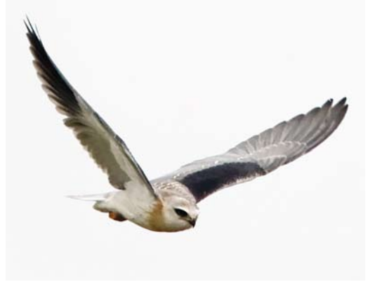
9 Black-winged Kite / Grijsze Wouw Elanus caeruleus caeruleus , juvenile, Maashorst, Noord-Brabant, Netherlands, 4 August 2015 ( Michel Veldt )

Africa is caeruleus , although records of vociferus in Egypt cannot be ruled out.