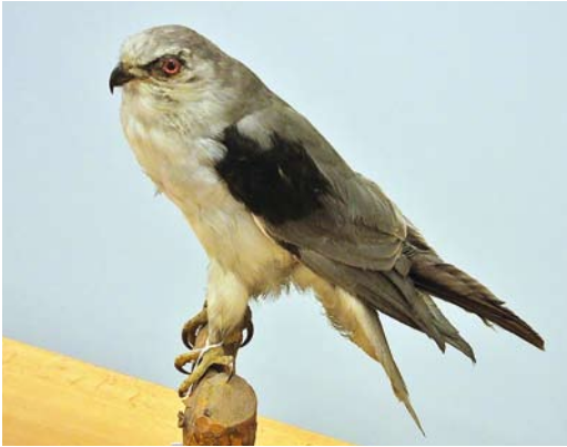
10 Black-winged Kite / Grijze Wouw Elanus caeruleus caeruleus , adult female (collected at Olbramovice, Jihomoravský, Czechia, on 31 March 1938), National Museum, Prague, Czechia, July 2015 (Jiri Sirek)

areas (Negro et al 2006). The main reasons for range extension and population increase in the WP are land-use change and the associated higher density of rodents (Mañosa et al 2005, Ballbontín et al 2008, Karakaş 2012). Black-winged Kite is thought to specialise in rodents, which usually make up more than 95% of its diet (Mendelsohn & Jaksić 1989). Its population densities and breeding performance are largely dependent on rodent abundance and availability. Ballbontín et al (2008) suggested that the species may have taken advantage of the gradual increase of cultivated parklands in Spain (known as dehesas ) in the second half of the 20th century to expand its range there. This particular type of dehesas (eg, characterised by a low density of trees) is structurally similar to African savannahs and may offer a higher density of rodents than other traditional habitats.