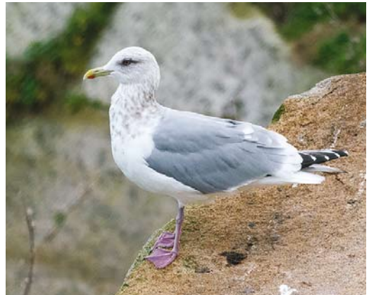
69 Steppe Grey Shrike / Steppeklapekster Lanius lahtora pallidirostris , first-year, Andarax river mouth, Almería, Andalucía, Spain, 30 November 2016 ( Jesús Nieto Latorre ) 70 Steppe Grey Shrike / Steppeklapekster Lanius lahtora pallidirostris , first-year, Saline Joniche, Reggio Calabria, Italy, 22 December 2016 ( Giuseppe Martino ) 71 Franklin's Gull / Franklins Meeuw Larus pipixcan , adult, with Black-headed Gull / Kokmeeuw Chroicocephalus ridibundus , Mur de Lixhe, Liège, Belgium, 27 December 2016 ( Robin Gailly ) 72 Thayer's Gull / Thayers Meeuw Larus thayeri , adult, Lago, Xove, Lugo, Spain, 13 January 2017 ( David Calleja Marcos )

first for Belarus. If accepted, a fourth-year Vega Gull L. vegae at Charny, Seine-et-Marne, on 17 November will be the first for France and the second for the WP (the first was in Ireland in January 2016; cf Dutch Birding 38: 104, 2016). A third-winter American Herring Gull L. smithsonianus was photographed at Portimão, Algarve, Portugal, on 4 December, while an adult returned to Sesimbra, Setúbal, where it was first observed in February 2014. In Spain, two returning adults were seen at Lires, Muxia, A Coruña, from 7 December, and at Ondarroa harbour, Bizkaia, from 23 December. A first-winter was reported at Couso, Ribeira, A Coruña, on 1 January. Also in Spain, the Thayer's Gull L. thayeri returned for its 10th winter to Lago, Xove, Lugo, on 13 January. An Iceland Gull L. glaucooides at Tallinn on 13 January was the second for Estonia. If accepted, a putative second-winter Slaty-backed Gull L. schistisagus at Gdańsk, Pomerania, on 2-3