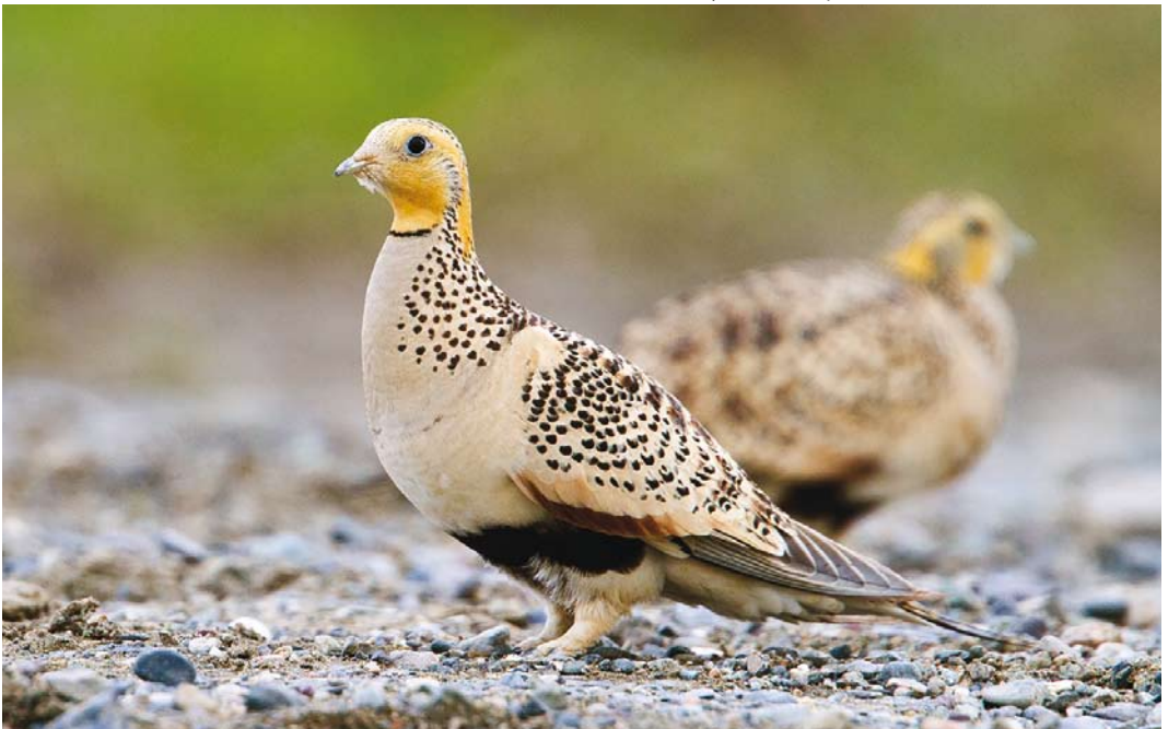
51 Pallas's Sandgrouse / Steppehoen Syrrhaptes paradoxus , females, between Zaysan lake and Tarbagatai mountains, East Kazakhstan, Kazakhstan, 25 May 2014 (Ralph Martin)