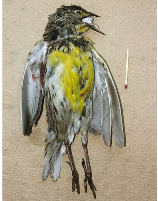
44-45 Western Meadowlark / Geelkaakweidespreeuw Sturnella neglecta , Provideniya, Chukotka, Russia, 2 July 2004

swapped it for a nice red Spoon-billed Sandpiper on that trip.