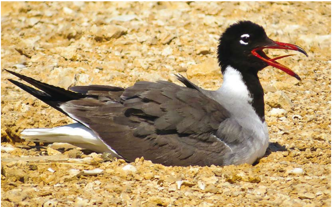
13 White-eyed Gull / Witoogmeeuw Larus leucophthalmus , adult summer, off Hurghada, Egypt, 8 June 2014. Fluffing feathers during hot day.

White-eyed Gulls choose remote islands for nesting in colonies with other marine birds. The islands are usually on sandy or fossilized coral substrate, undisturbed and free from land predators. Birds arrive at the breeding site from the second week of April and disperse widely from the end of October, when the breeding season has ended. Once they arrive on the islands, they start browsing the area to establish a territory and pair up. They then perform a special display and start building the nest, which takes three to four weeks. Nests are built in small depressions in sandy substrate and consist of old bones of dead chicks from previous seasons, dead shells and small fossil corals. Old twigs are only rarely used, except when the breeding site is close to shrubs.