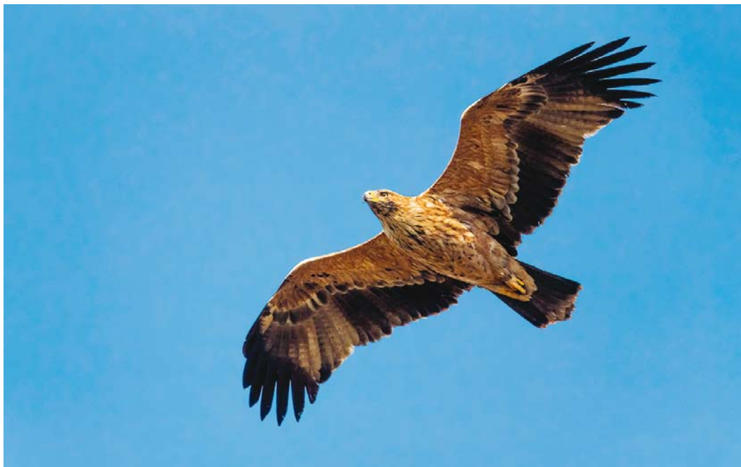
54 Spanish Imperial Eagle / Spaanse Keizerarend Aquila adalberti , immature, Lago di Massaciuccoli, Toscana, Italy, 9 January 2017