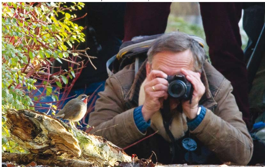
37 Roodkeelnachtegal / Siberian Rubythroat Calliope calliope , eerste-winter mannetje, Hoogwoud, Noord-Holland, 22 januari 2016