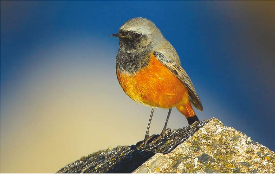
76 Eastern Black Redstart / Oosterse Zwarte Roodstaart Phoenicurus ochruros phoenicuroides , first-winter male, Torness, East Lothian, Scotland, 4 December 2016