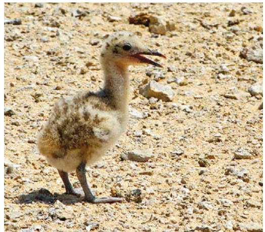
14 Eggs and pullus of White-eyed Gull / Witoogmeeuw Larus leucophthalmus , off Hurghada, Egypt, 18 June 2013 (Mohamed I Habib). Typical nest with three eggs; note asynchronous hatching. 15 Clutch of White-eyed Gull / Witoogmeeuw Larus leucophthalmus , off Hurghada, Egypt, 8 June 2014 (Mohamed I Habib). Nest containing high number of five eggs, presumably laid by two females in same nest. 16 White-eyed Gulls / Witoogmeeuwen Larus leucophthalmus , off Hurghada, Egypt, 21 June 2012 (Mohamed I Habib). Chicks at sea shore during hot day. 17 White-eyed Gull / Witoogmeeuw Larus leucophthalmus , off Hurghada, Egypt, 26 August 2015 (Mohamed I Habib). Two-week old chick.

At Umm Gawish, the distance between individual nests was 0.5-5 m, while at Gysom individual nests were much further, 50-100 m, apart. On all eight islands, White-eyed Gulls defended the eggs or young by aggressively attacking any intruders and flying around nervously (plate 12). This behaviour was also noticed during Arabian surveys of breeding seabirds (Jennings 2010). Both male and female built the nest, while the female occupied the nest before laying eggs. Clutch size was one to three eggs on most islands; most commonly, the clutch consisted of three eggs (plate 14). A nest containing five eggs on Umm Gawish was exceptional and may have been the result of two females laying in the same nest (plate 15). Eggs were detected from the second week of May. Nests were