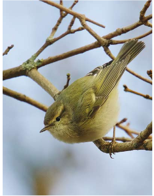
96 Vermoedelijke Siberische Braamsluiper / presumed Siberian Lesser Whitethroat Sylvia althaea blythi , Katwijk aan Zee, Zuid-Holland, 1 december 2016 ( René van Rossum ) 97 Humes Bladkoning / Hume's Leaf Warbler Phylloscopus humei , Noordwijkerhout, Zuid-Holland, 6 januari 2017 ( Martin van der Schalk ) 98 Veldrietzanger / Paddyfield Warbler Acrocephalus agricola , eerste-winter, Zwanenwater, Noord-Holland, 5 november 2016 ( Arnoud B van den Berg )