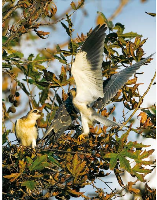
5 Black-winged Kites / Grijsze Wouwen Elanus caeruleus vociferus , adult with juveniles on nest, Hula valley, Israel, 24 November 2011

have been documented in Baghdad and Diyala provinces in central and eastern Iraq (Ararat et al 2011) and it is apparently expanding its range. The subspecific identity of the Iraqi records is unclear but all are assumed to have been vociferus .