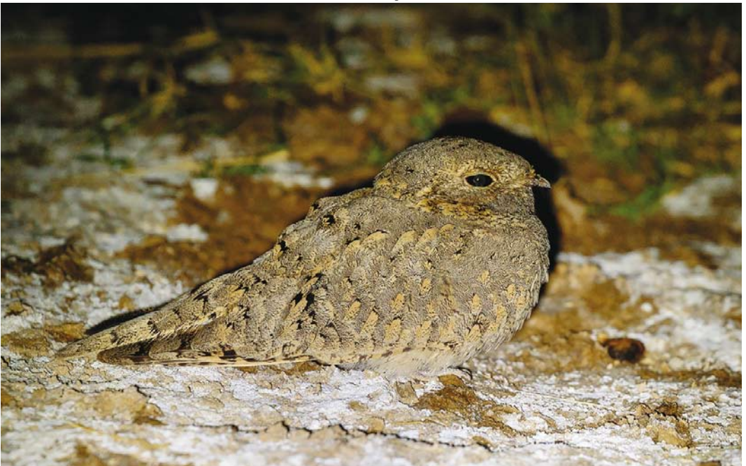
57 Sykes's Nightjar / Sykes' Nachtzwaluw Caprimulgus mahrattensis , Muntasar oasis, Oman, 12 December 2016 (Albert Burgas)