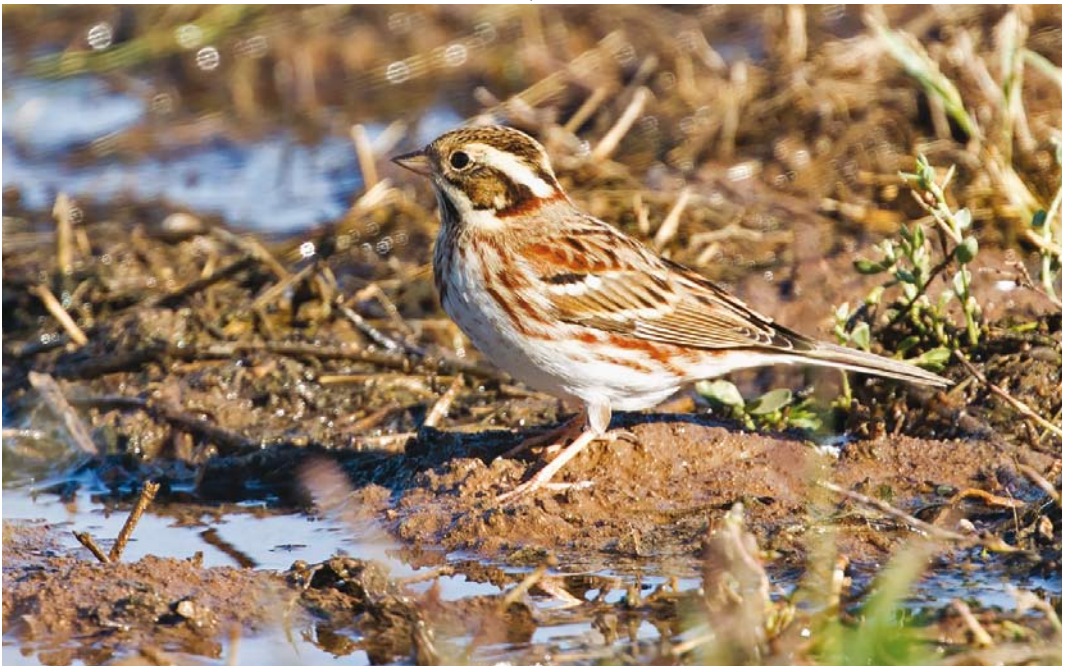
83 Rustic Bunting / Bosgors Emberiza rustica , first-winter, Paphos, Cyprus, 24 November 2016 (Jane Stylianou)