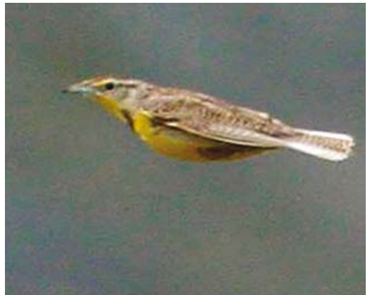
38-43 Western Meadowlark / Geelkaakweidespreeuw Sturnella neglecta , Provideniya, Chukotka, Russia, 2 July 2004 (Phil Palmer)