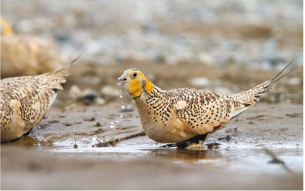
48 Pallas's Sandgrouse / Steppehoen Syrrhaptes paradoxus , female, between Zaysan lake and Tarbagatai mountains, East Kazakhstan, Kazakhstan, 25 May 2014