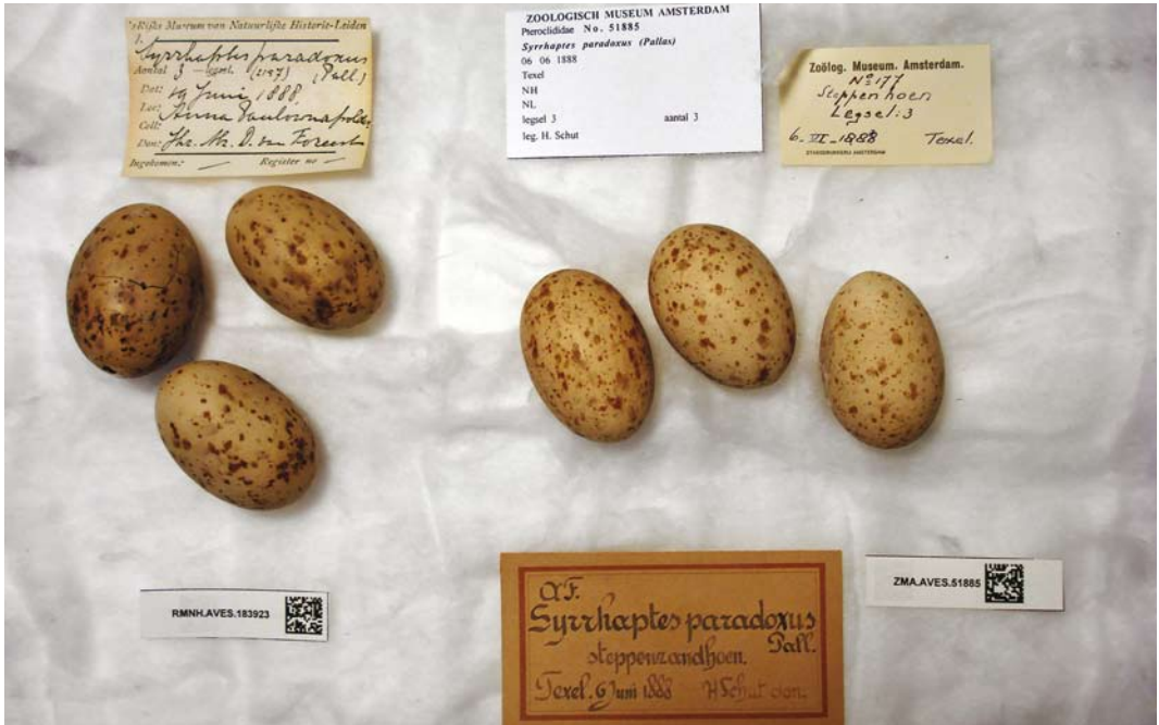
107 Legsels van Steppehoer / Pallas's Sandgrouse Syrhaptus paradoxus (verzameld op Texel, Noord-Holland, op 6 juni 1888 (rechts) en te Anna-Paulownapolder, Noord-Holland, op 19 juni 1888), Naturalis Biodiversity Center, Leiden, Zuid-Holland, 13 november 2013