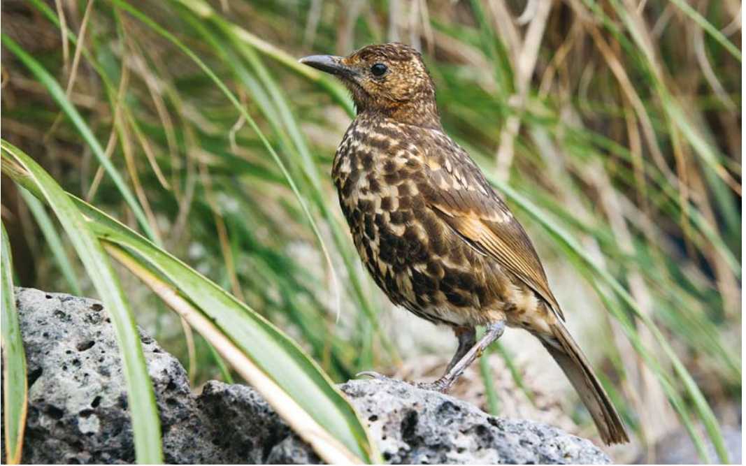
170 Tristan Thrush / Tristanlijster Turdus eremita gordoni , Inaccessible Island, South Atlantic Ocean, 13 April 2011 (Garry Bakker)