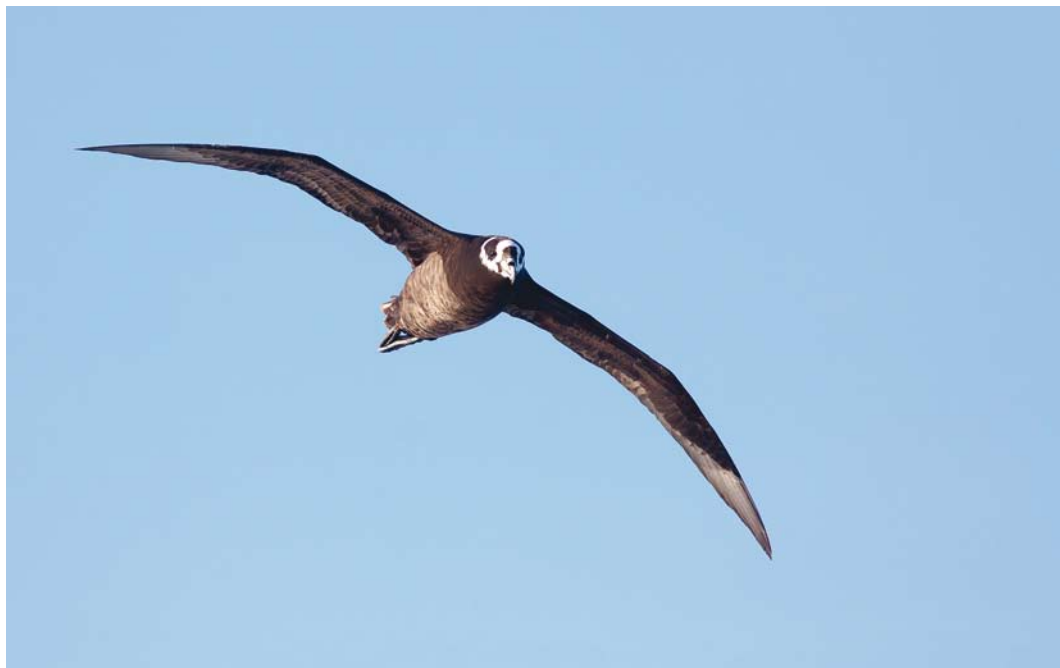
169 Spectacled Petrel / Brilstormvogel Procellaria conspicillata , off Tristan da Cunha, South Atlantic Ocean, 12 April 2011

and tail are poorly developed, preventing it to migrate. The legs and bill are dark grey, the eyes are red in adult birds and placed a bit to the front of the head adding to an 'evil' facial expression. Juveniles show a brown iris combined with a brown crown and brown upperparts. Sexes are alike, although males tend to be slightly larger, heavier, longer winged and longer billed than females (Ryan et al 1989, Fraser et al 1992) and there are minor differences in colour of the cheek and ear-coverts as well (Fraser et al 1992).