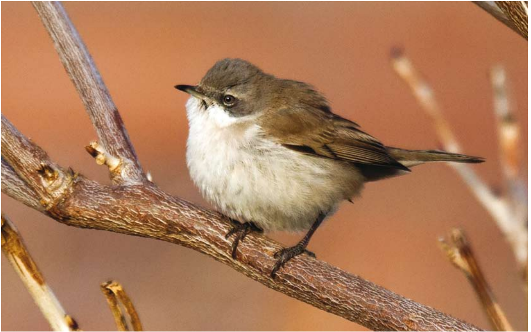
215 Vermoedelijke Siberische Braamsluiper / presumed Siberian Lesser Whitethroat Sylvia althaea blythi , Breda, Noord-Brabant, 20 januari 2017 (Arnaud B van den Berg)