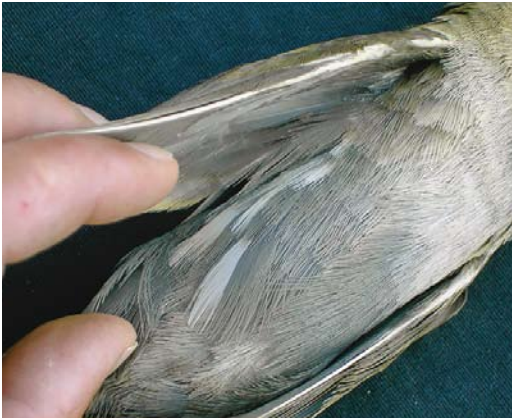
135-138 Lesser Moorhen / Afrikaans Waterhoen Paragallinula angulata , first-year (collected off Laxe, A Coruña, Spain, on 5 February 2000), Wildlife Recovery Center, Oleiros, A Coruña, 19 November 2006 (Pablo Pita Criado)

& Strand 2000) was first accepted but later rejected after review (considered Common Moorhen; Haas 2012). In the 'greater WP' (including Iran and the Arabian Peninsula), there are two records in Oman: two immatures at Hilf on 7-9 November 1991 and one at Salalah nature reserve on 1 October 2008 (Eriksen & Victor 2013). The vagrancy potential of the species is illustrated by a bird caught from a ship while swimming at sea near the archipelago of São Pedro and São Paulo, Brazil, on 10 January 2005 (Bencke et al 2005). This archipelago is a small and isolated group of rocky islets lying in the equatorial Atlantic Ocean c 960 km north-east of the coast of Rio Grande do Norte, Brazil, and 1824 km south-west of Guinea-Bissau, Africa.