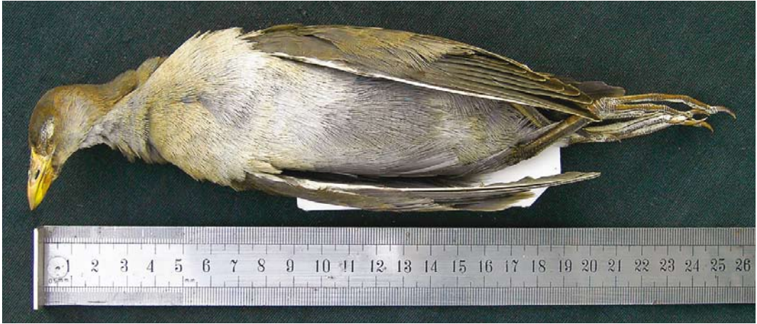
134 Lesser Moorhen / Afrikaans Waterhoen Paragallinula angulata , first-year (collected off Laxe, A Coruña, Spain, on 5 February 2000), Wildlife Recovery Center, Oleiros, A Coruña, 19 November 2006 (Pablo Pita Criado)

Before making the record public, I tried to get more information about the circumstances under which the bird had been collected. The specimen had no further information on the original label than 'collected. Laxe, February 5, 2000'. I requested more information from the center and received the answer that the bird had been captured by a fisherman three nautical miles offshore from the port of Laxe, A Coruña, and had been given to the staff of the Red Cross in the harbour, who subsequently contacted the recovery centre of Oleiros.