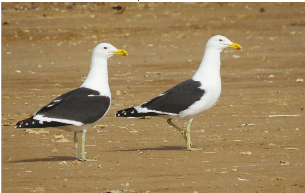
175 Cape Gulls / Afrikaanse Kelpmeeuwen Larus dominicanus vetula , adult, Akhfennir, Western Sahara, Morocco, 25 February 2017 (Robert Swann)