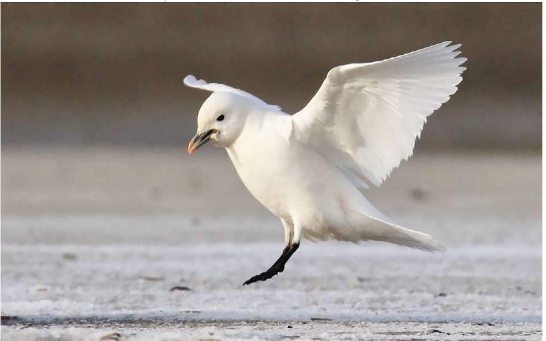
173 Ivory Gull / Ivoormeeuw Pagophila eburnea , adult, Sankt Peter-Ording, Schleswig-Holstein, Germany, 17 January 2017 ( Reinder Genuït ) cf Dutch Birding 39: 50, 2017