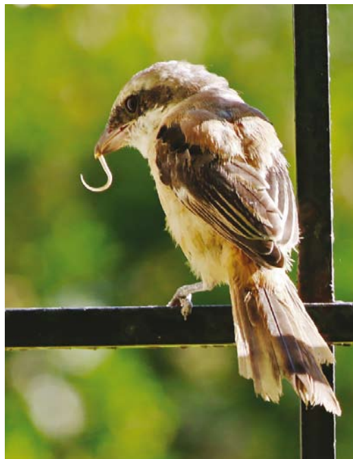
148 Long-tailed Shrike / Langstaartklauwier Lanius schach erythronotus , juvenile, Victory Park, Atyrau, Kazakhstan, 14 August 2016 (Fedor Sarayev)

forming little speculum almost hidden by the wing-covert; 10 dark brown secondaries with buff edges; and 11 tail with blackish-brown central feathers, paler two inner feathers and pale brown outermost feather, tinged buff (all tail-feathers except the inner with pale edges). The juveniles had the crown, nape and mantle brownish-grey with a brown, scaly pattern. The rump and uppertail-coverts were rusty with a brown pattern and the flight-feathers dark brown with rufous edges. The underparts were greyish with a brown, scaly pattern. The mask was pale brown.