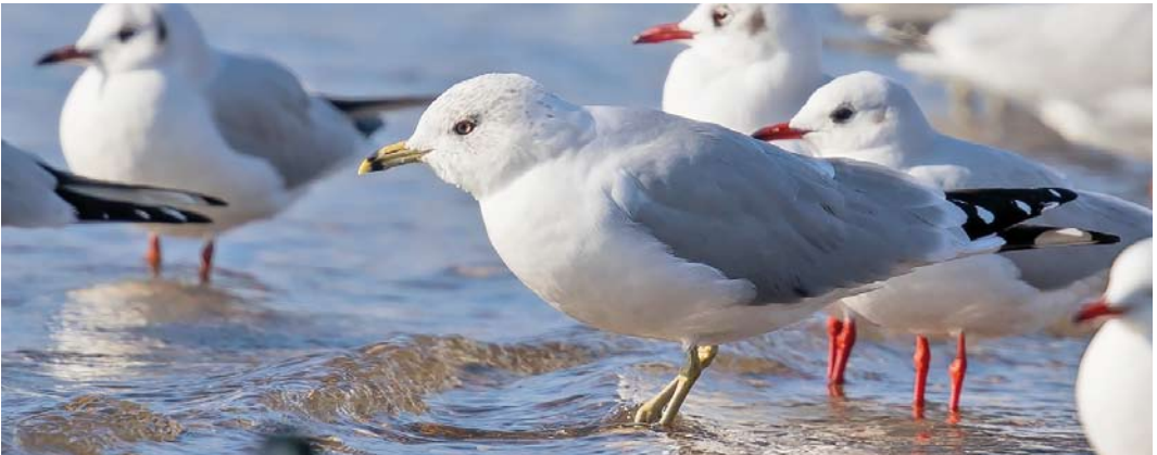
178 Black Heron / Zwarte Reiger Egretta ardesiaca , Tarrafal, São Nicolau, Cape Verde Islands, 10 March 2017 ( Daniel López-Velasco ) 179 Snow Goose / Sneeuwvangans Anser caerulescens , Sete Cidades, São Miguel, Azores, 20 December 2016 ( Gerbrand Michielsen ) cf Dutch Birding 39: 43, 2017 180 Ring-billed Gull / Ringsnavelmeeuw Larus delawarensis , adult, with Black-headed Gulls / Kokmeeuwen Chroicocephalus ridibundus , Hitdorf, Nordrhein-Westfalen, Germany, 13 February 2017 ( Norbert Uhlhaas )

(the species' typical weight is 55-70 g); it concerned the first record of this genus in the Southern Hemisphere outside South America (Bull Br Ornithol Club 136: 214-215, 2016).