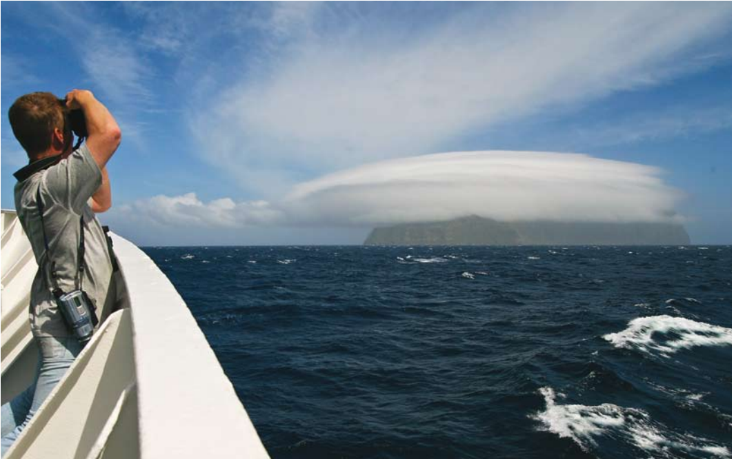
163 Inaccessible Island, South Atlantic Ocean, 27 March 2006