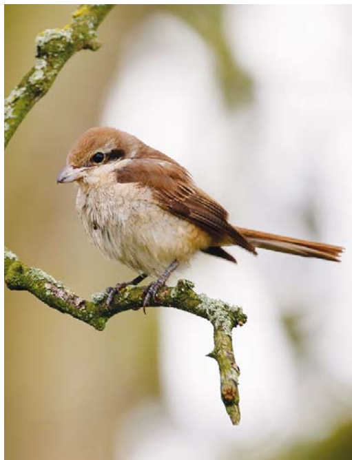
124 Bruine Klauwier / Brown Shrike Lanius cristatus , eerste-winter, Den Helder, Noord-Holland, 4 maart 2017