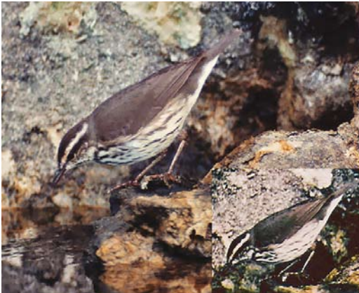
FIGURE 1 Northern Waterthrush / Noordse Waterlijster Parkesia noveboracensis , Tazacorte, La Palma, Santa Cruz de Tenerife, Canary Islands, November 1991 ( Martin Semisch ). Note how new scan (main image) reveals finer eyebrow, better-defined streaking on underparts and dirtier legs compared with old scan (inset). FIGURE 2 Northern Waterthrush / Noordse Waterlijster Parkesia noveboracensis , Tazacorte, La Palma, Santa Cruz de Tenerife, Canary Islands, November 1991 ( Martin Semisch ). Compared with completely clean throat in old scan (right), streaks are more obvious in new scan (left), as well as on breast and underparts. 143 Northern Waterthrush / Noordse Waterlijster Parkesia noveboracensis , Tazacorte, La Palma, Santa Cruz de Tenerife, Canary Islands, November 1991 ( Martin Semisch ). Note rounded head and short thin bill, diagnostic of Northern Waterthrush. 144 Northern Waterthrush / Noordse Waterlijster Parkesia noveboracensis , Tazacorte, La Palma, Santa Cruz de Tenerife, Canary Islands, November 1991 ( Martin Semisch ). This new scan shows how sharp streaking on underparts is, extending towards throat as well.

This is without doubt one of the most misleading features in the old scans, where the supercilium looked more like that of motacilla : very long, broadening from behind the eye towards a square-shaped abrupt end at the nape. The recent examination of the new scans revealed a finer super-