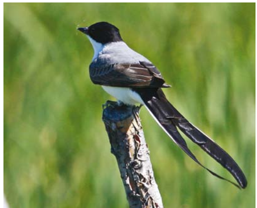
139 Fork-tailed Flycatcher /Vorkstaartkoningstiran Tyrannus savana , Chubut province, Argentina, 18 November 2008 (César Sánchez). Although contrast between mantle and wing in this individual does not appear to be as strong as that in plate 140, note that mantle is clearly ashy-grey, not 'black or very dark grey' as described and drawn by observer (cf figure 1). 140 Fork-tailed Flycatcher /Vorkstaartkoningstiran Tyrannus savana , Misiones province, Argentina, 18 November 2008 (Miguel Rouco). Note contrast between grey mantle and black wing. 141 Fork-tailed Flycatcher /Vorkstaartkoningstiran Tyrannus savana , Chubut province, Argentina, 13 November 2008 (Miguel Rouco). Note contrast between grey mantle and black wing, with grey mantle directly bordering black cap.

these conditions, the observer did not perceive some of the typical plumage features of the species. In fact, the described features could even be considered as incompatible with it. One of these features was the colour of the wing and back, described as 'black', later specified as 'black or very dark grey' (cf figure 1). Although Fork-tailed Flycatcher could be described as having dark grey upperparts under very poor light conditions or at great distance, the ash-grey colour of the mantle and scapulars, contrasting with the dull black or dark brown wing-feathers and wing-coverts, should have been clearly perceptible in the prevailing conditions. Even in the nominate subspecies T s savana , being the darkest