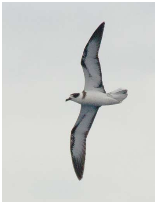
153-154 Vanuatu Petrel / Vanuatustormvogel Pterodroma occulta , at sea between Vanua Lava and Ureparapara, Banks Islands, Vanuatu, 26 April 2014 (Pierre M A van der Wielen)