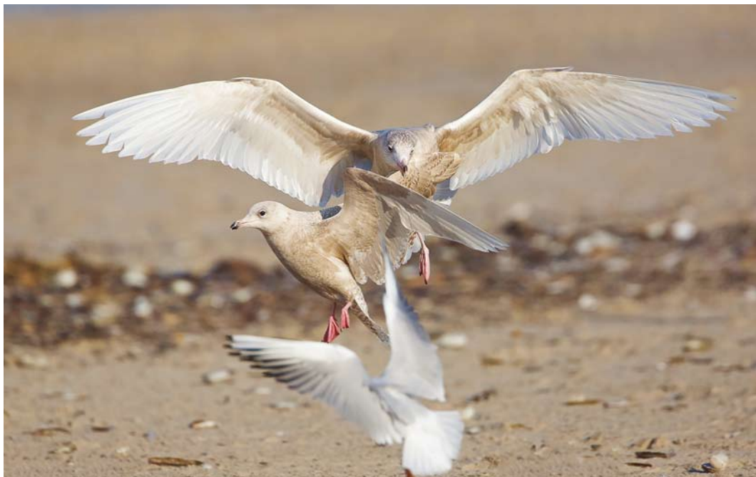
206 Grote Burgemeester / Glaucous Gull Larus hyperboreus , eerste-winter (boven), en Kleine Burgemeester / Iceland Gull L. glaucooides , eerste-winter (midden), met Kokmeeuw / Black-headed Gull Chroicocephalus ridibundus , Kijkduin, Den Haag, Zuid-Holland, 22 januari 2017 207 Grote Burgemeester / Glaucous Gull Larus hyperboreus , adult, met Buizerd / Common Buzzard Buteo buteo , Paezemerlannen, Lauwersmeer, Friesland, 17 januari 2017