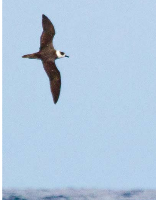
155-156 Vanuatu Petrel / Vanuatustormvogel Pterodroma occulta , at sea between Vanua Lava and Ureparapara, Banks Islands, Vanuatu, 26 April 2014 ( Pierre M A van der Wielen ) 157 Vanuatu Petrels / Vanuatustormvogels Pterodroma occulta , at sea between Vanua Lava and Ureparapara, Banks Islands, Vanuatu, 26 April 2014 ( Pierre M A van der Wielen )