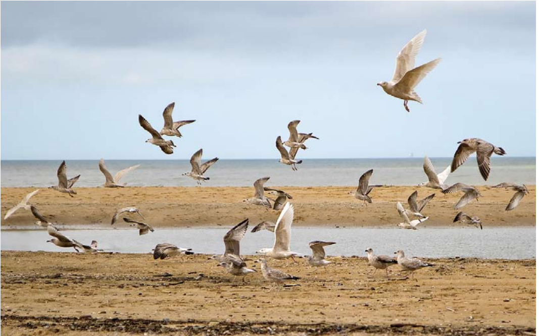
208 Grote Burgemeesters / Glaucous Gulls Larus hyperboreus , eerste-winter, en Kleine Burgemeesters / Iceland Gulls L. glaucoides , eerste-winter, met Zilvermeeuwen / European Herring Gulls L. argentatus , Meijendel, Wassenaar, Zuid-Holland, 3 februari 2017 209 Grote Burgemeesters / Glaucous Gulls Larus hyperboreus , eerste-winter, en Kleine Burgemeesters / Iceland Gulls L. glaucoides , eerste-winter, met Zilvermeeuwen / European Herring Gulls L. argentatus , Noorderstrand, Scheveningen, Zuid-Holland, 3 februari 2017