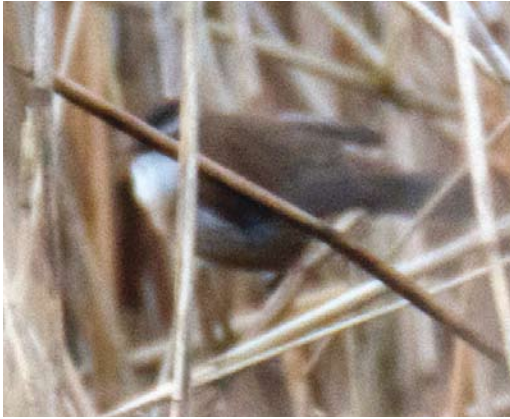
222 Zwartkoprietzanger / Moustached Warbler Acrocephalus melanopogon , Brabantse Biesbosch, Noord-Brabant, 21 maart 2017