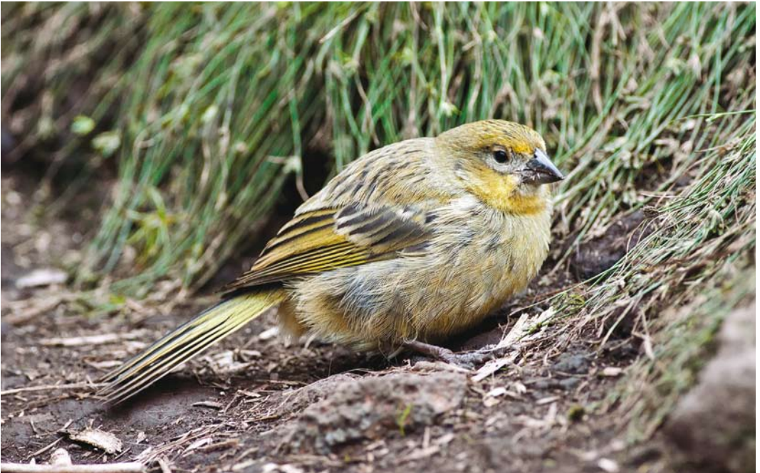
171 Inaccessible Island Finch / Inaccessiblegors Nesospiza acunhae dunnei , Inaccessible Island, South Atlantic Ocean, 13 April 2011