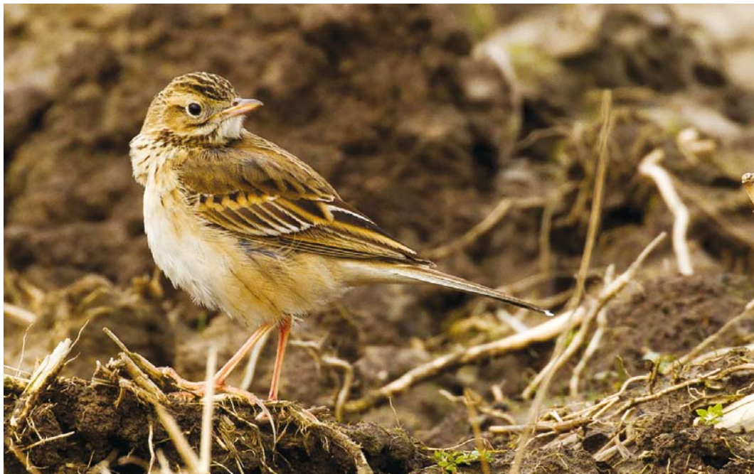
213 Grote Pieper / Richard's Pipt Anthus richardi , eerste-winter, Grijskerke, Zeeland, 31 januari 2017 (Marcel Klootwijk)