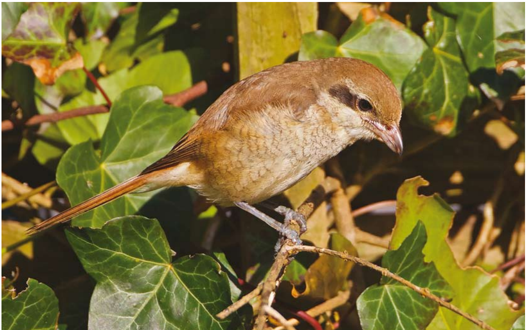
123 Bruine Klauwier / Brown Shrike Lanius cristatus , eerste-winter, Den Helder, Noord-Holland, 24 februari 2017

Centraal- en Oost-Siberië en Mongolië, en overwintert van India tot in Zuidoost-Azië. De broedgebieden worden vanaf juli (tot in september) verlaten en in maart-mei vangen vogels de terugreis aan naar de broedgebieden waar ze in mei-juni aankomen (del Hoyo et al 2008). Er zijn in Europa tot en met 2016 38 gevallen in acht landen (zie Gerritsen et al 2015 voor gevallen tot begin 2015). Daarna waren er tot eind 2016 zeven gevallen, in Brittannië (vijf: 20 oktober 2015, Porthgwarra, Cornwall, Engeland; 27-30 september 2016, Out Skerries, Shetland, Schotland; 30 september 2016, Mainland, Shetland, Schotland; 6 oktober 2016, Sanday, Orkney, Schotland; en 31 oktober 2016, Spurn, East Yorkshire, Engeland), Frankrijk (20-24 oktober 2015, Ouessant, Finistère) en Noorwegen (11-16 oktober 2015, Ervika, Sogn og Fjordane) ( www.tarsiger.com , http://tinyurl.com/hruaea3 , http://tinyurl.com/goeuvxs ; Dutch Birding 37: 408, plate 634, 2015). De meeste vogels zijn ontdekt in september (12), oktober (15) en november (zeven), met daarnaast ontdekkingen in december (één), januari (één) en februari (één) en een geval uit mei. Twee najaarsvogels bleven tot voorbij de jaarwisseling en twee keer eerder werd een vogel in de winterperiode ontdekt, in Nederland in ja-