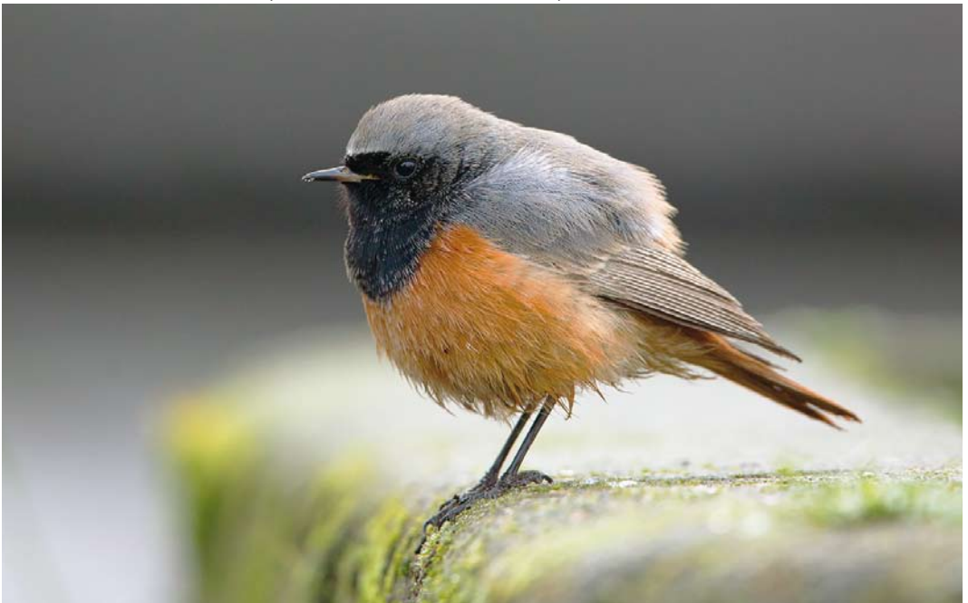
216 Oosterse Zwarte Roodstaart / Eastern Black Redstart Phoenicurus ochruros phoenicuroides , eerste-winter mannetje, Barendrecht, Zuid-Holland, 15 januari 2017