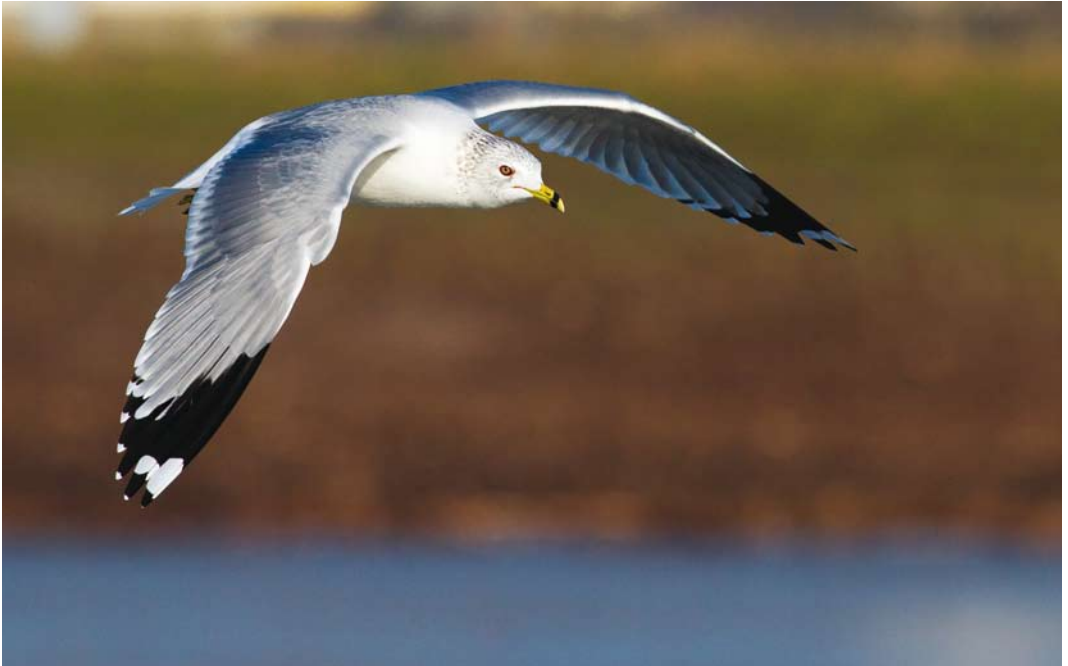
210 Vermoedelijke Ringsnavelmeeuw / presumed Ring-billed Gull Larus delawarensis , adult, Wijchen, Gelderland, 26 januari 2017 211 Bruine Klauwier / Brown Shrike Lanius cristatus , eerste-winter, Den Helder, Noord-Holland, 24 februari 2017 212 Taigaboomkruiper / Eurasian Treecreeper Certhia familiaris , Noordwijk, Zuid-Holland, 12 februari 2017