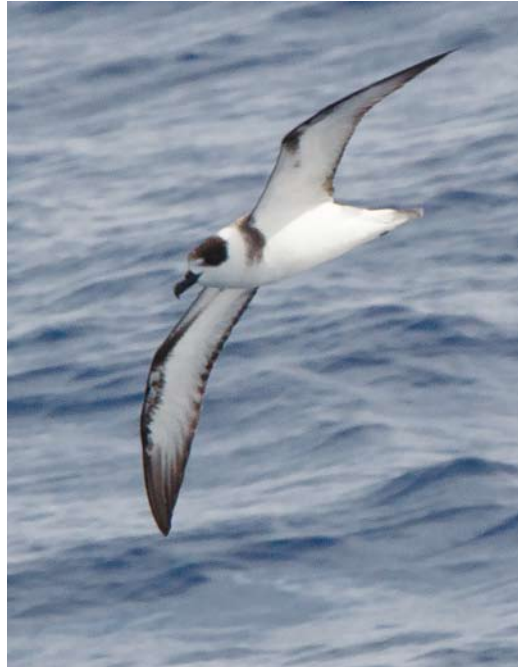
158 White-necked Petrel / Kermadecwitnekstormvogel Pterodroma cervicalis , off Tonga, Pacific Ocean, 7 April 2014 (Pierre M A van der Wielen) 159-161 White-necked Petrel / Kermadecwitnekstormvogel Pterodroma cervicalis , off Macauley, Kermadec Islands, New Zealand, 4 April 2014 (Pierre M A van der Wielen)