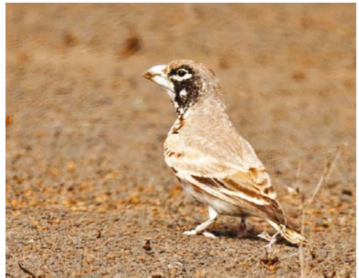
195 Black Scrub Robin / Zwarte Waaierstaart Cercotrichas podobe , first-winter, Hai Bar, Yotvata, Israel, 22 February 2017 196 Dusky Thrush / Bruine Lijster Turdus eunomus , first-winter, Zenson di Piave, Treviso, Italy, 5 February 2017 197 Marmora's Warbler / Sardijnse Grasmus Sylvia sarda , Dwejra, Gozo, Malta, 5 February 2017 198 Thick-billed Lark / Diksnavelleeuwerik Ramphocoris clotbey , Terra Boa, Sal, Cape Verde Islands, 2 March 2017

on 9 January and then at Khnifiss on 23 January and the long-stayer at M'hamid, Zagora, from November 2015 to at least 21 March; the species' first record for Morocco was in December 2009 and the first breeding occurred in spring 2010 in Western Sahara, with several additional records since (cf Dutch Birding 32: 329-332, 2010, 37: 271, 414, 2015, 38: 190, 462, 2016, 39: 53, 2017). A Brown-necked Raven C. ruficollis at Teguisse, Lanzarote, on 5 February may be the first for the Canary Islands. The first for Italy was photographed on Pantelleria, Sicily, on 3 March; previous European records were at Vila-Seca, Tarragona, Spain, on 11 April 2013 (presumed to be ship-assisted and placed in 'category D') and on Cape Greco, Cyprus, on 25 March 2016. Eight Thick-billed Larks Ramphocoris clotbey at Terra Boa, Sal, on 2 March were the first for the Cape Verde Islands. If accepted, a Wire-tailed Swallow Hirundo smithii photographed at Raisi dam, Sistan, Baluchestan, on 26 January will be the second for Iran (the first was on 27 December 2015).