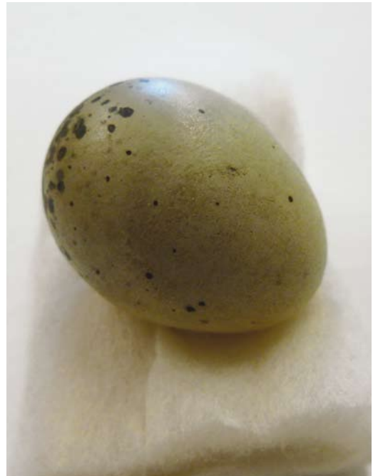
110 Legsel van Witwangstern / Whiskered Tern Chlidonias hybrida (verzameld te Nederweert, Limburg, in juni 1938), Naturalis Biodiversity Center, Leiden, Zuid-Holland, 6 november 2009