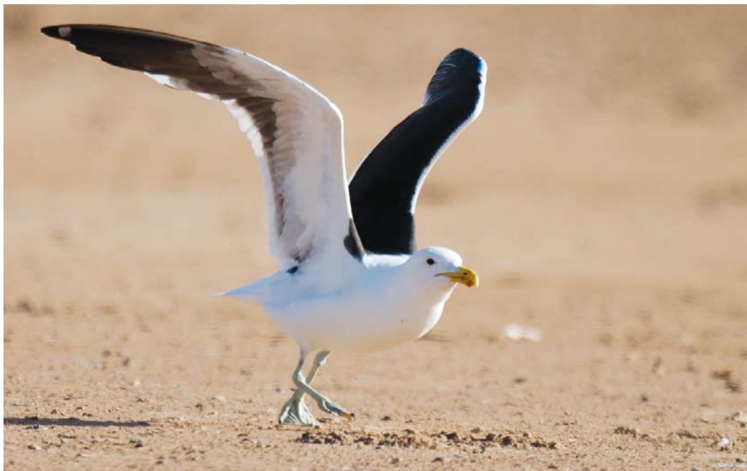
174 Cape Gull / Afrikaanse Kelpmeeuw Larus dominicanus vetula , adult, Akhfennir, Western Sahara, Morocco, 17 March 2017