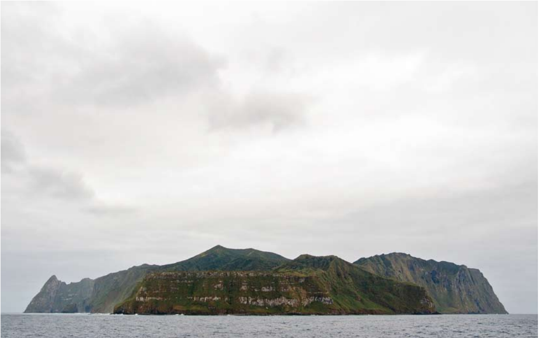
165 Inaccessible Island, South Atlantic Ocean, 13 April 2011 ( Garry Bakker )