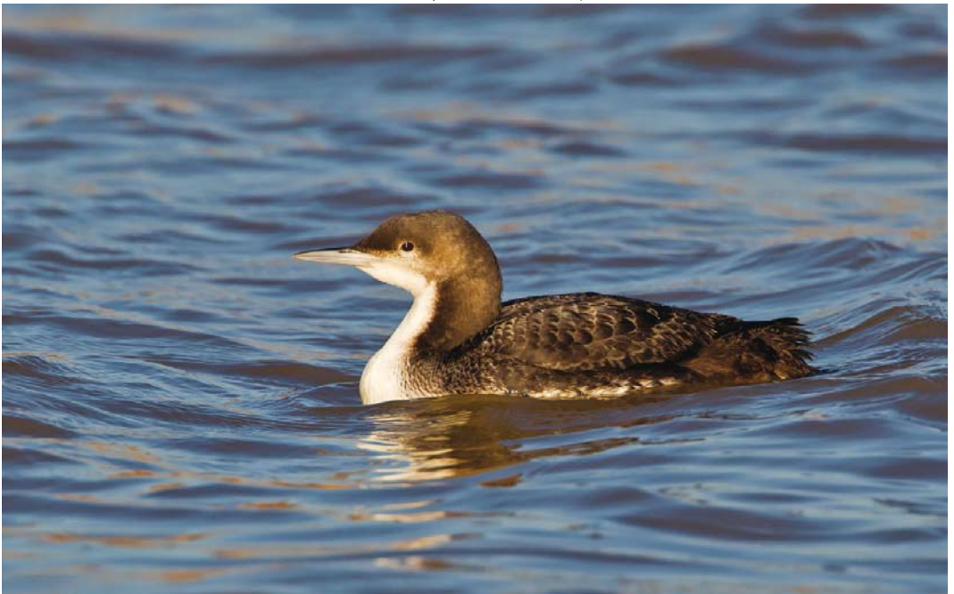
177 Pacific Loon / Pacifische Parelduiker Gavia pacifica , first-winter, Druridge Bay, Northumberland, England, 23 January 2017 ( Alan Curry )