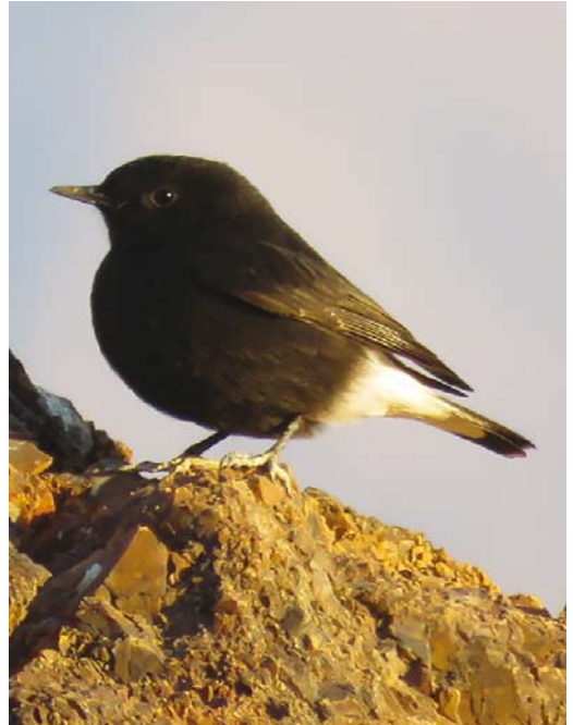
199 Olive-backed Pipit / Siberische Boompieper Anthus hodgsoni , Ta' Qali, Malta, 31 January 2017 200 Basalt Wheatear / Basalttapuit Oenanthe lugens warriae , Beer-Ora, Israel, 17 January 2017 201 Pale-legged Leaf Warbler / Oessoerifitis Phylloscopus tenellipes , St Agnes, Scilly, England, 21 October 2016