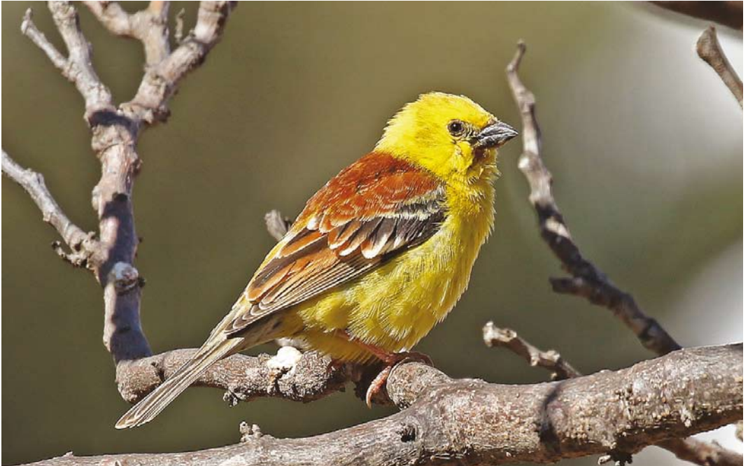
202 Sudan Golden Sparrow / Bruinruggoudmus Passer luteus , male, Pajara, Fuerteventura, Canary Islands, 4 February 2017