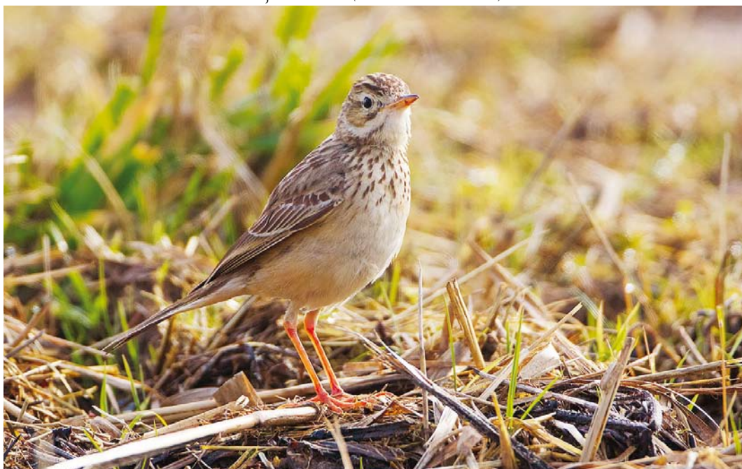
214 Mongoolse Pieper / Blyth's Pipt Anthus godlewskii , eerste-winter, Brabantse Biesbosch, Noord-Brabant, 20 januari 2017