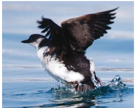
129-130 Pigeon Guillemot / Duifzeekoet Cepphus columba , off Hokkaido, Japan, 19 February 2016 ( Beatrice Henricot ). Presumably subspecies Kuril Guillemot (Snow's Guillemot) C c snowi . 131 Pigeon Guillemots / Duifzeekoeten Cepphus columba , off Hokkaido, Japan, 19 February 2016 ( Beatrice Henricot ). Right bird presumably Kuril Guillemot (Snow's Guillemot) C c snowi . 132-133 Pigeon Guillemot / Duifzeekoet Cepphus columba , adult, moulting into breeding plumage, Ochiishi, Hokkaido, Japan, 27 February 2016 ( Yann Muzika ). Presumably subspecies Kuril Guillemot (Snow's Guillemot) C c snowi .