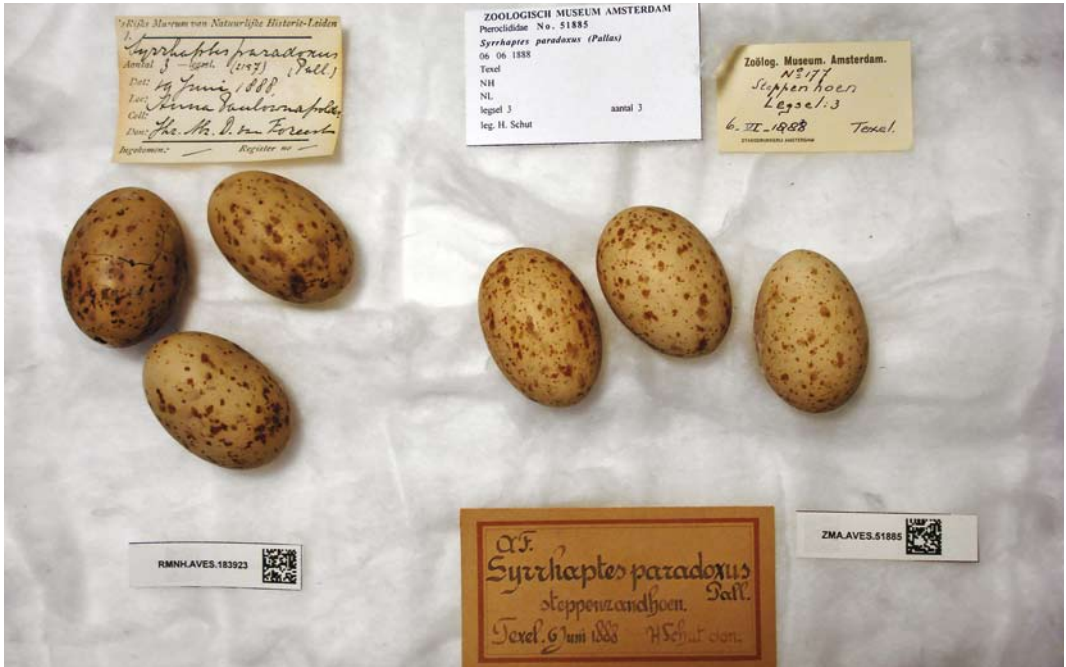
107 Legsels van Steppehoer / Pallas's Sandgrouse Syrnhaptes paradoxus (verzameld op Texel, Noord-Holland, op 6 juni 1888 (rechts) en te Anna-Paulownapolder, Noord-Holland, op 19 juni 1888), Naturalis Biodiversity Center, Leiden, Zuid-Holland, 13 november 2013