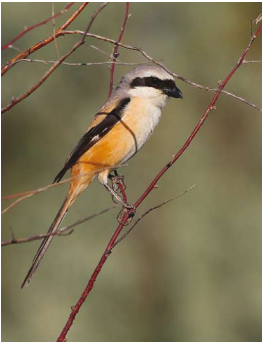
145 Long-tailed Shrike / Langstaartklauwier Lanius schach erythronotus , adult, Victory Park, Atyrau, Kazakhstan, 17 June 2016 (Askar Isabekov)

niles were trying to hunt for small lizards (plate 148). The observations of the adult birds and the family in the same place during two months in conjunction with their obvious territoriality and behaviour are strong evidence that the birds nested there.