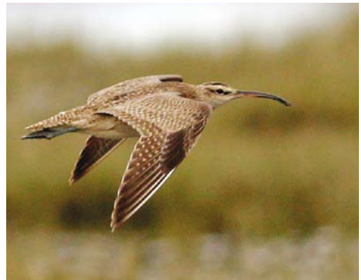
191 Allen's Gallinule / Afrikaans Purperhoen Porphyrio alleni , Barragem de Poilão, Santiago, Cape Verde Islands, 13 February 2017 ( Mads Elley ) 192 Sooty Tern / Bonte Stern Onychoprion fuscatus , adult, off Raso, Cape Verde Islands, 8 March 2017 ( Ernst Albegger ) 193 Stilt Sandpiper / Steltstrandloper Calidris himantopus , Riu Tuareg lagoon, Boavista, Cape Verde Islands, 4 March 2017 ( Ernst Albegger ) 194 Hudsonian Whimbrel / Amerikaanse Regenwulp Numenius hudsonicus , Santoña, Cantabria, Spain, 29 January 2017 ( Haritz Sarasa )

from 29 January to 8 March. The one on Papa Westray and Eday, Orkney, Scotland, stayed until at least 11 February.