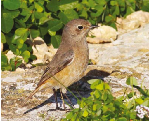
204 Moussier's Redstart / Diadeemroodstaart Phoenicurus moussieri , female, Sanap, Gozo, Malta, 2 January 2017

the Blyth's Pipit Anthus godlewskii at Brabantse Biesbosch, Noord-Brabant, from 8 January remained into late March. At Cape Kormakitis, the third for Cyprus was seen on 20 January. Others stayed at Cuxhaven, Niedersachsen, Germany, from 28 January to 18 February, and at Caneten-Roussillon, Pyrénées-Orientales, France, on 13-16 February. An Olive-backed Pipit A hodgsoni wintered at Ta' Qali, Malta, from 13 December 2016 into February. In the Azores, an American Buff-bellied Pipit A rubescens rubescens was seen on Terceira on 27 February.