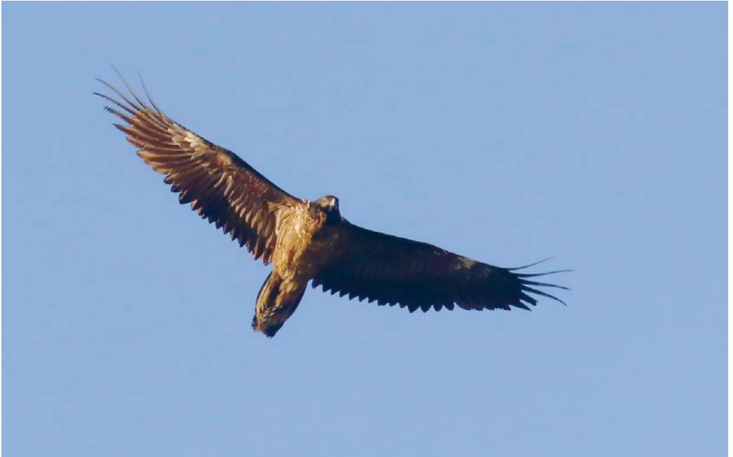
176 Bearded Vulture / Lammergeier Gypaetus barbatus , second calendar-year, Delft, Zuid-Holland, Netherlands, 12 March 2017