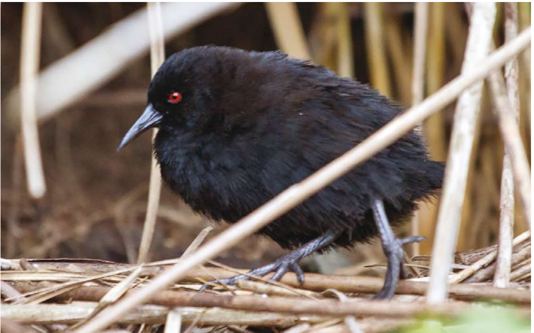
166 Inaccessible Island Rail / Inaccessibleral Atlantisia rogersi , Inaccessible Island, South Atlantic Ocean, 13 April 2011 ( Menno van Duijn )