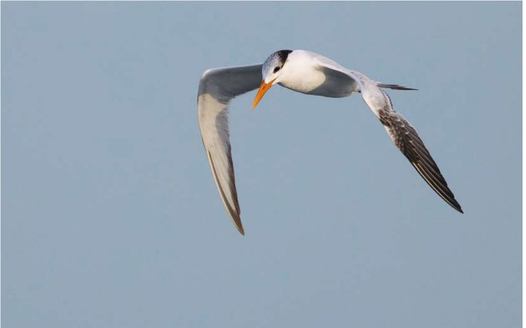
172 American Royal Tern / Amerikaanse Koningsstern Sterna maxima maxima , first-winter, Miellette, Guernsey, Channel Islands, 5 February 2017