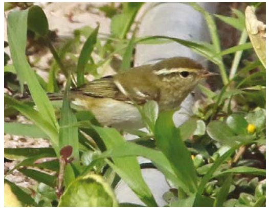
149 Olive-backed Pipits / Siberische Boompiepers Anthus hodgsoni , Zraïib El Jadida, Nouadhibou, Mauritania, 13 November 2016 (Rob S A van Bemmelen) 150 Yellow-browed Warbler / Bladkoning Phylloscopus inornatus , Zraïib El Jadida, Nouadhibou, Mauritania, 13 November 2016 (Rob S A van Bemmelen) 151 Yellow-browed Warbler / Bladkoning Phylloscopus inornatus , Cansado, Mauritania, 13 November 2016 (Rob S A van Bemmelen)

in Morocco, nine of which since 2005 (Fareh et al 2016). At least four records come from Algeria, all in years (1985 and 2016) with numerous records in Europe (Isenmann & Moali 2000, Ławicki & van den Berg 2016). There is also one record in Libya and several in Egypt (Goodman & Meininger 1989, Isenmann et al 2016). South of Mauritania, we could trace only two published records of Yellow-browed Warbler: singles in The Gambia (Barlow 2007) and Senegal (Cruse 2004) but none of Olive-backed Pipit. In recent years, both species have also been recorded in the Canary Islands, and Yellow-browed Warbler is likely a regular winterer there – in small but increasing numbers (de Juana 2008, García-del-Rey & García Vargas 2013). Taking as references Isenmann et al (2010), online bird sighting databases (www.observado.org and www.e-bird.org), as well as the species