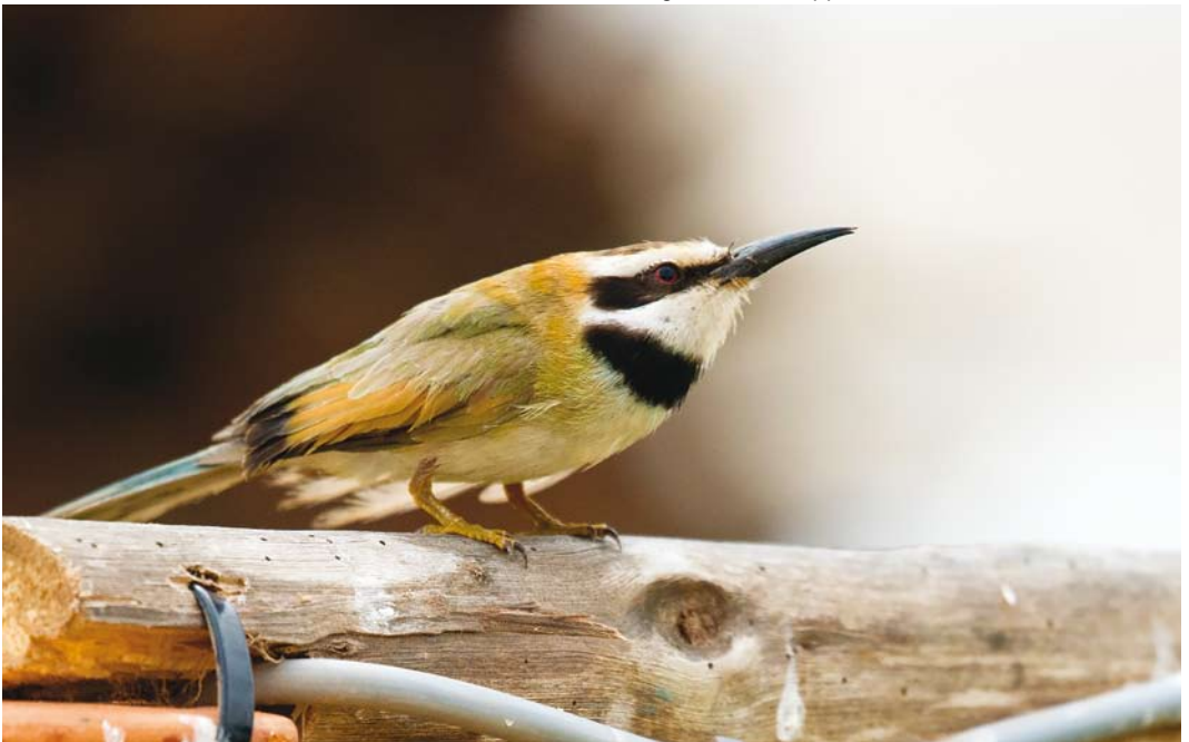
203 White-throated Bee-eater / Witkeelbijeneter Merops albicollis , Dakhla bay, Western Sahara, Morocco, 2 March 2017