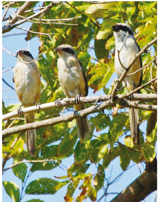
146 Long-tailed Shrikes / Langstaartklauwieren Lanius schach erythronotus , adult with juveniles, Victory Park, Atyrau, Kazakhstan, 6 August 2016 (Fedor Sarayev)

The adults were easily distinguished from other shrike species by the bright, contrasting colours and the very long tail (cf Lefranc & Worfolk 1997, del Hoyo et al 2008). The photographs show all plumage characters typical for this species: 1 grey crown and nape; 2 grey buff-tinged mantle; 3 bright buff back, rump and uppertail-coverts; 4 black forehead, lore and ear-coverts forming black mask; 5 faint off-white supercilium; 6 off-white throat, breast and belly with buff tinge (most prominent on flank and undertail-coverts); 7 brownish-black wing; 8 almost black wing-coverts; 9 dark brown primaries with white base,