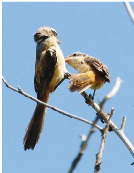
147 Long-tailed Shrikes / Langstaartklauwieren Lanius schach erythronotus , adult with juvenile, Victory Park, Atyrau, Kazakhstan, 6 August 2016