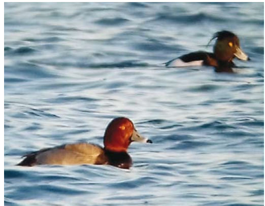
187 Blue-winged Teal / Blauwvleugeltaling Anas discors , male, with Gadwalls / Krakeenden A strepera and Eurasian Coot / Meerkoet Fulica atra , Boisdorfer See, Kerpen, Nordrhein-Westfalen, Germany, 14 February 2017 188 Baikal Teal / Siberische Taling Anas formosa , male (right), with Eurasian Wigeon / Smient A penelope , Noordwijk, Zuid-Holland, Netherlands, 14 februari 2017 189 Pale-bellied Brent Goose / Witbuikrotgans Branta hrota , adult, Tenerife, Canary Islands, 3 March 2017 190 Redhead / Amerikaanse Tafeleend Aythya americana , male, with Tufted Duck A fuligula , male, Plobsheim, Bas-Rhin, France, 26 February 2017

ties are poorly correlated in these taxa ( http://tinyurl.com/hg8rxet ).