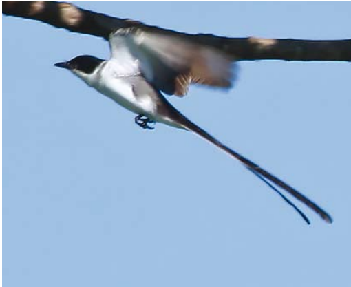
142 Fork-tailed Flycatcher / Vorkstaartkoningstiran Tyrannus savana , Misiones province, Argentina, 18 November 2008 (Miguel Rouco). Note position in flight, with tail in same plane as body, not permanently dropped down as described by observer.