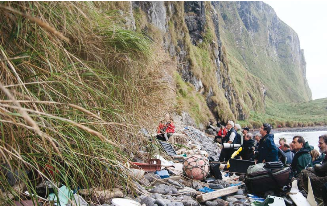
164 Waiting for Inaccessible Island Rail Atlantisia rogersi , Inaccessible Island, South Atlantic Ocean, 13 April 2011