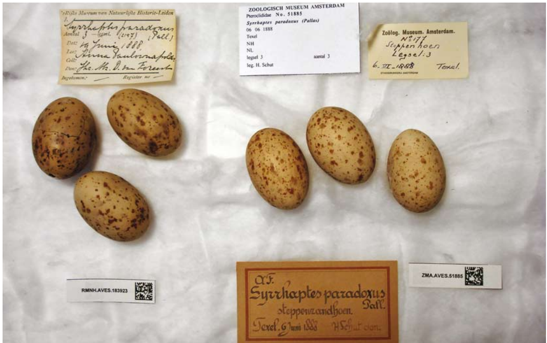
107 Legsels van Steppenhoen / Pallas's Sandgrouse Syrhaptus paradoxus (verzameld op Texel, Noord-Holland, op 6 juni 1888 (rechts) en te Anna-Paulownapolder, Noord-Holland, op 19 juni 1888), Naturalis Biodiversity Center, Leiden, Zuid-Holland, 13 november 2013