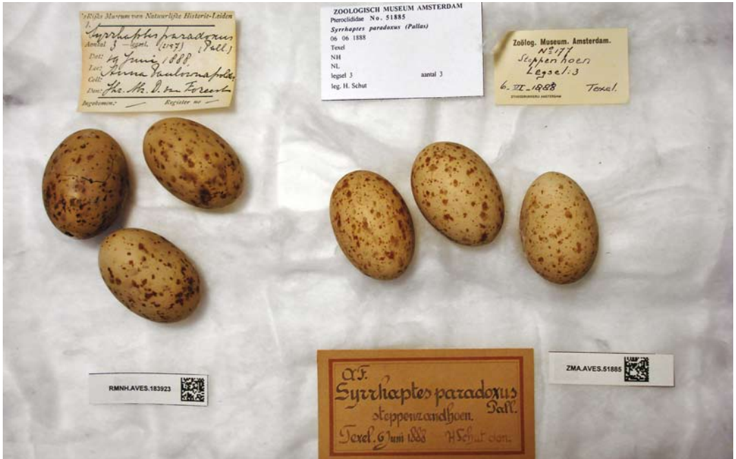
107 Legsels van Steppehoer / Pallas's Sandgrouse Syrnhaptes paradoxus (verzameld op Texel, Noord-Holland, op 6 juni 1888 (rechts) en te Anna-Paulownapolder, Noord-Holland, op 19 juni 1888), Naturalis Biodiversity Center, Leiden, Zuid-Holland, 13 november 2013