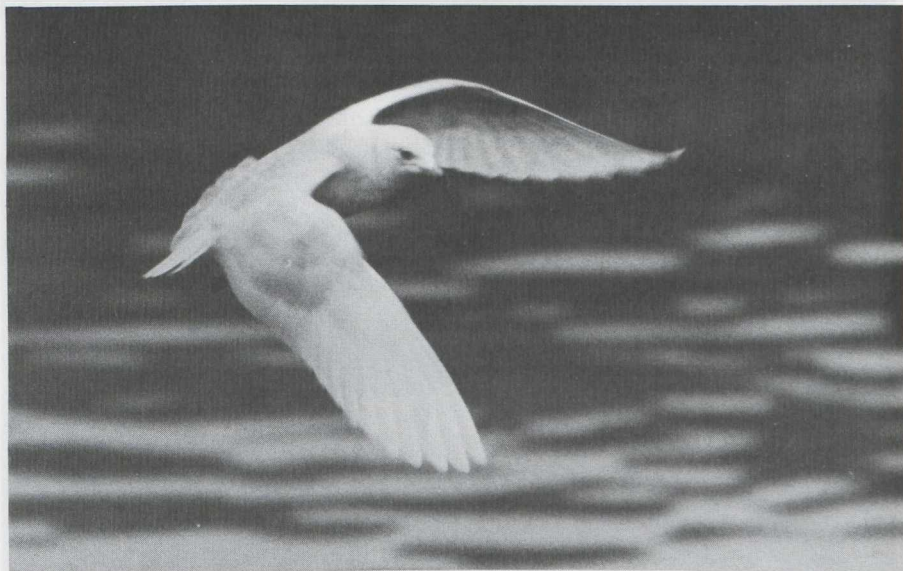
4. Iceland Gull/Kleine Burgemeester Larus glaucooides , second-winter bird, IJmuiden (Noord-Holland), February 1981 (Edward van IJsendoorn)

Size and build. Size about that of Herring Gull L. argentatus . Head not smaller than that of Herring Gull and with distinctly circular outline; forehead more steep than in Common Gull L. canus ; highest point of crown behind eye. Neck comparatively short and, especially lowerneck, relatively thick (both in flight and at rest). Wing, especially innerwing, comparatively broad and with rounded tip (p9 and p10 differed only slightly in length); projection of 'hanging' wings beyond tail (not further than in Herring Gull) when standing; secondaries little 'raised' (as in Herring Gull) when swimming and primaries almost horizontally and not crossed; angle between undertail and water more acute than in Herring Gull. Tail length corresponded almost to width of innerwing; innertail normally depressed when flying (giving spread tail wedge-shaped and sometimes even diamond-shaped appearance). Eye position approximately as in Herring Gull. Bill slender and length (measured along lower ridge of lower mandible) about two-fifth of that of head; proximal half of culmen straight and distal half evenly downcurved; gonys weakly developed; tip not pointed (as in Common Gull) and not hooked (as in Glaucous Gull L. hyperboreus ). Leg, both tibia (proximally feathered) and tarsus, comparatively short and thin.