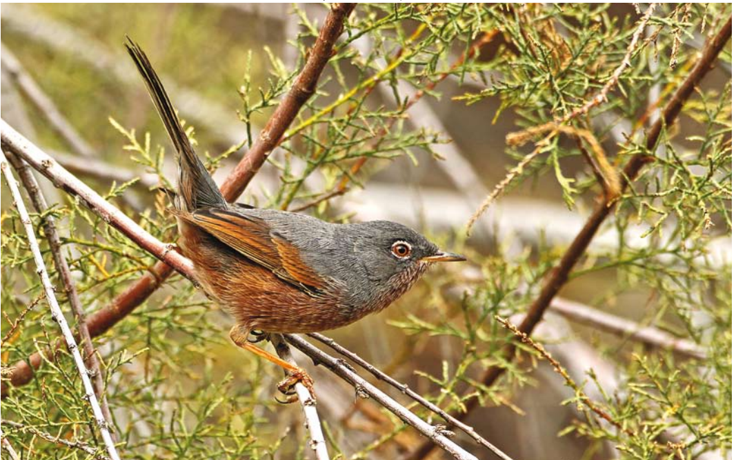
165 Tristram's Warbler / Atlasgrasmus Sylvia deserticola , male, Barranco de la Torre, Fuerteventura, Canary Islands, 4 February 2018