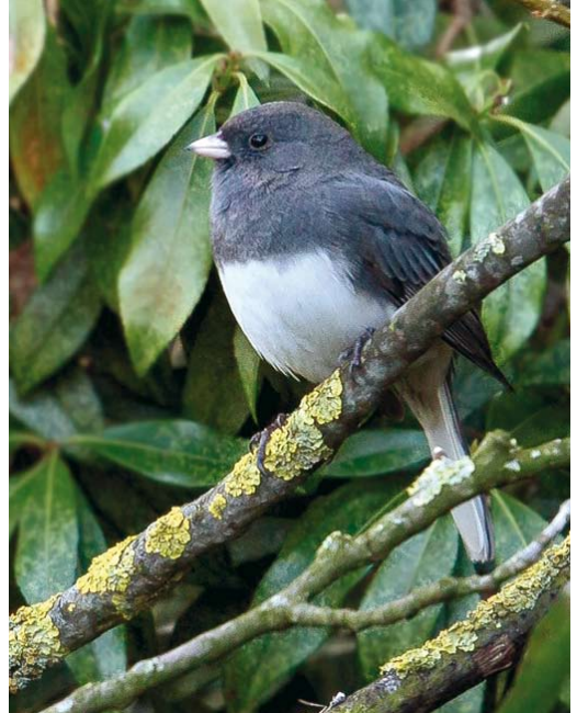
160 Greater Spotted Eagle / Bastaardarend Aquila clanga 'fulvescens' , immature, Kerkini lake, Greece, 5 February 2018 161 Dark-eyed Junco / Grijze Junco Junco hyemalis , Doornzele, Oost-Vlaanderen, Belgium, 20 March 2018 162 Siberian Crane / Siberische Witte Kraanvogel Grus leucogeranus , adult male ('Omid'), Fereydunkenar, Mazandaran, Iran, 1 February 2018 163 Taiga Merlin / Amerikaans Smelleken Falco columbarius columbarius , female or first-winter, Thurso, Highland, Scotland, 3 February 2018