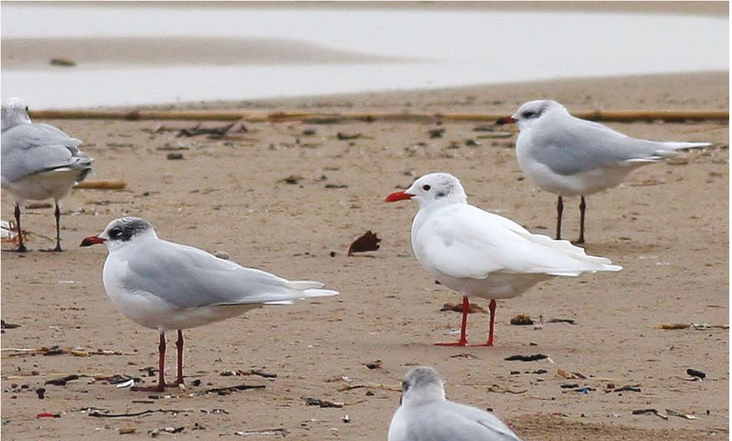
120 Mediterranean Gulls / Zwartkopmeeuwen Larus melanocephalus , Cambrils, Tarragona, Spain, 28 November 2014 (Joan Ferrer-Obiol). Possibly leucistic (or 'progressive grey') individual with normally coloured adults.

Several mixed pairs or cases of hybridization have been described for Mediterranean Gull, most often with Black-headed Gull Chroicocephalus ridibundus (Poprach et al 2006, Borghesi & Costa 2008). On the internet, photographs can be found of different hybrid individuals, in most cases adults, but also of a first-summer (second calendar-year) ( http://tinyurl.com/y7gr4sun ). The latter individual exhibited intermediate traits such as the shape of the hood and the wing pattern, with other traits more characteristic of either of the two species. For instance, the jet black head and contrasting white eye-crescents recalled Mediterranean but the fine bill resembled that of Black-headed more.