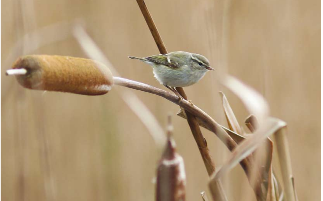
497 Hume's Leaf Warbler / Humes Bladkoning Phylloscopus humei , Heiloo, Noord-Holland, 19 December 2017 (Ruud E Brouwer)