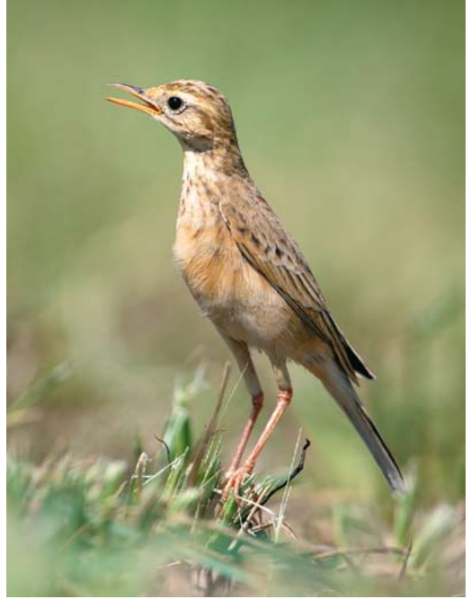
553 Tricolored Heron / Witbuikreiger Egretta tricolor , immature, Ribeira Quente, São Miguel, Azores, 29 October 2018 (David Monticelli) 554 Paddyfield Pipit / Oriëntaalse Pieper Anthus rufulus , Wamm Farms, Fujairah, United Arab Emirates, 12 October 2018 (Huw Roberts) 555 Sora / Soraral Porzana carolina , adult, Ribeira da Ponte, Corvo, Azores, 26 October 2018 (David Monticelli)