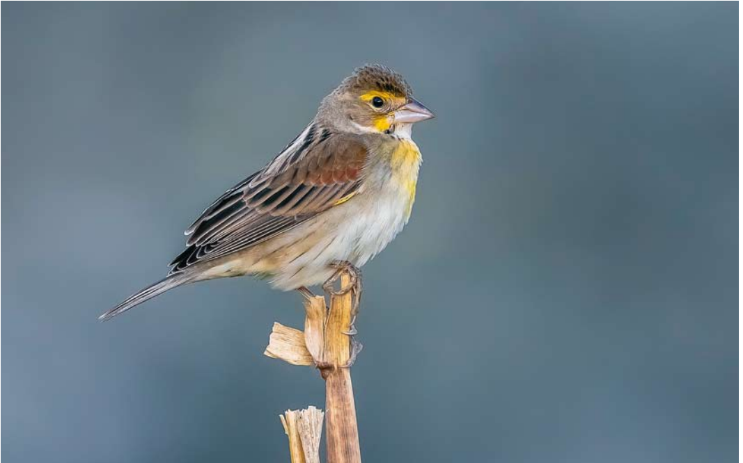
567 Dickcissel / Dickcissel Spiza americana , first-winter, Corvo, Azores, 22 October 2018 (Vincent Legrand) 568 Wood Thrush / Amerikaanse Boslijster Hylocichla mustelina , first-winter, Corvo, Azores, 17 October 2018 (Vincent Legrand) 569 Lincoln's Sparrow / Lincolns Gors Melospiza lincolni , first-winter, Corvo, Azores, 18 October 2018 (Vincent Legrand)