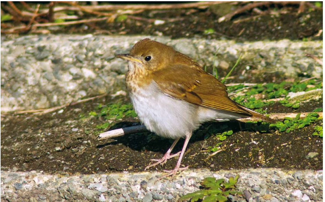
559 Veery / Veery Catharus fuscescens , first-winter, Cape Clear, Cork, Ireland, 18 October 2018 (Harry Hussey)