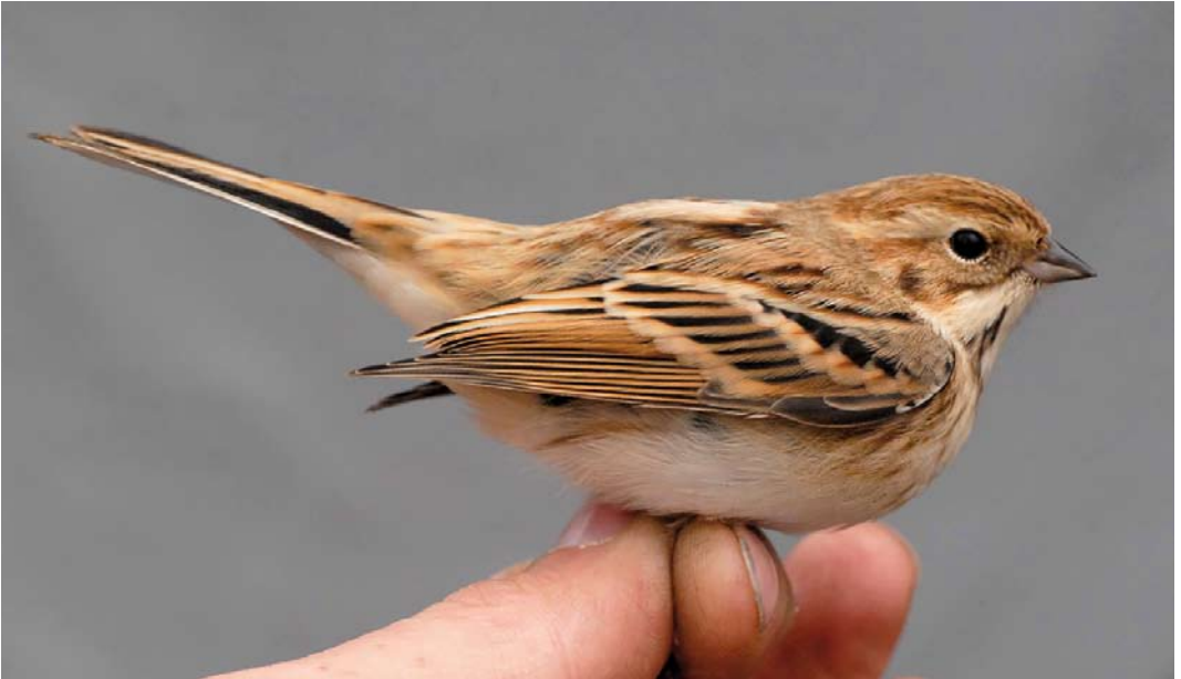
523 Pallas's Reed Bunting / Pallas' Rietgors Emberiza pallasi , first-winter female, Beidaihe, Hebei, China, 26 October 2012 ( Gabriel Norevik ). Perfect first-winter, with plain, pale face and head, lacking dark borders to crown side and ear-coverts. Under certain light conditions, lower mandible may not appear pinkish in some individuals but is always paler than in Common Reed Bunting E schoeniclus . Note that mantle now shows typical obvious pale 'braces'. 524 Pallas's Reed Bunting / Pallas' Rietgors Emberiza pallasi , first-winter female, Beidaihe, Hebei, China, 26 October 2012 ( Gabriel Norevik ). Same bird as in plate 523. Lesser coverts are still not bluish grey (or blue-grey as in adult male), yet they are duller and drab compared with chestnut or rusty-brown lesser coverts of Common Reed Bunting E schoeniclus .