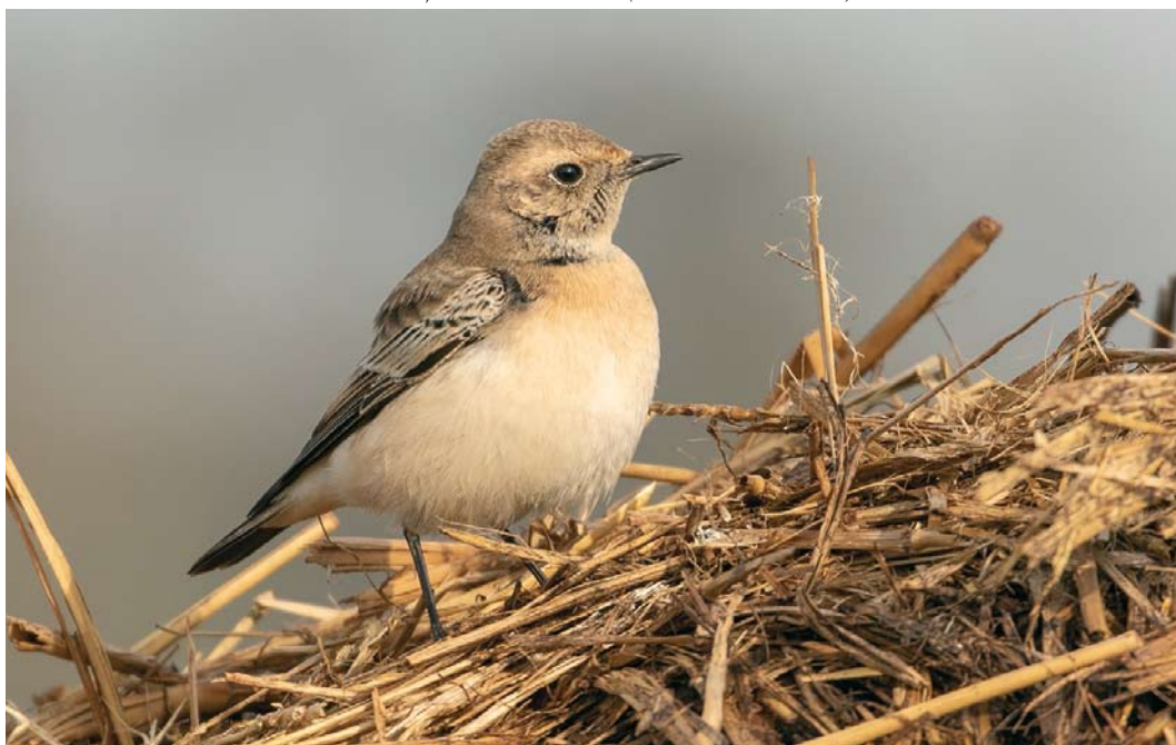
588 Bonte Tapuit / Pied Wheatear Oenanthe pleschanka , eerste-winter mannetje, Banckspolder, Schiermonnikoog, Friesland, 4 november 2018