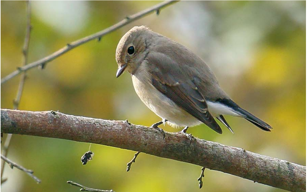
558 Taiga Flycatcher / Taigavliegenvanger Ficedula albicilla , first-winter, Galley Head, Cork, Ireland, 25 October 2018 (Tom Shevlin)