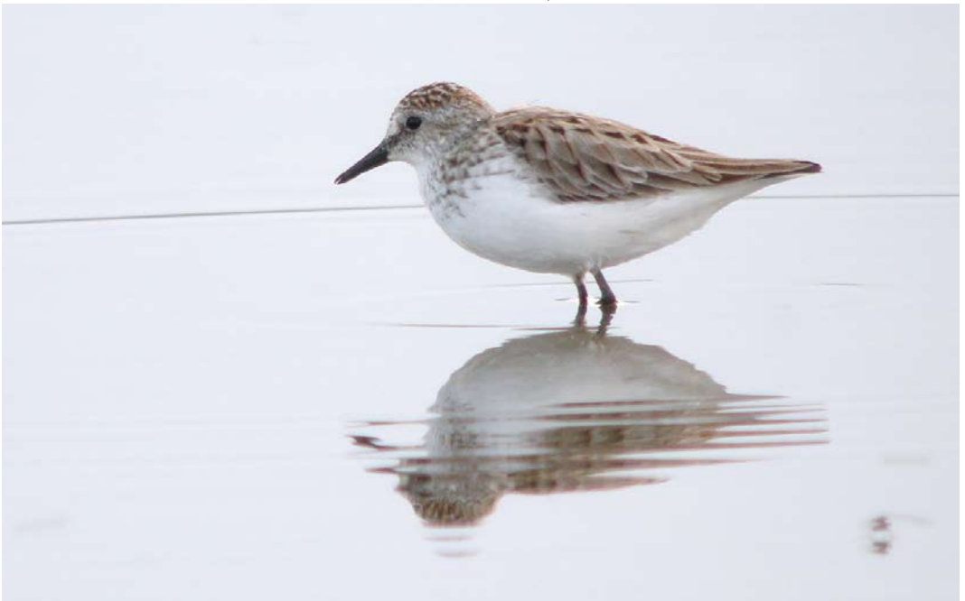
491 Semipalmated Sandpiper / Grijze Strandloper Calidris pusilla , adult, Lomm, Limburg, 15 May 2017 (Huub Crommentuyn)