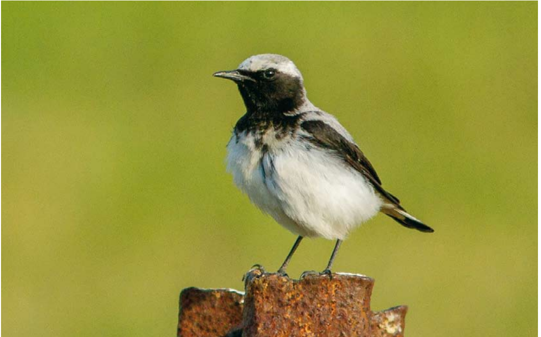
508 Seebom's Wheatear / Seebohms Tapuit Oenanthe seebohmi , first-summer male, Solleveld, Zuid-Holland, 22 May 2017