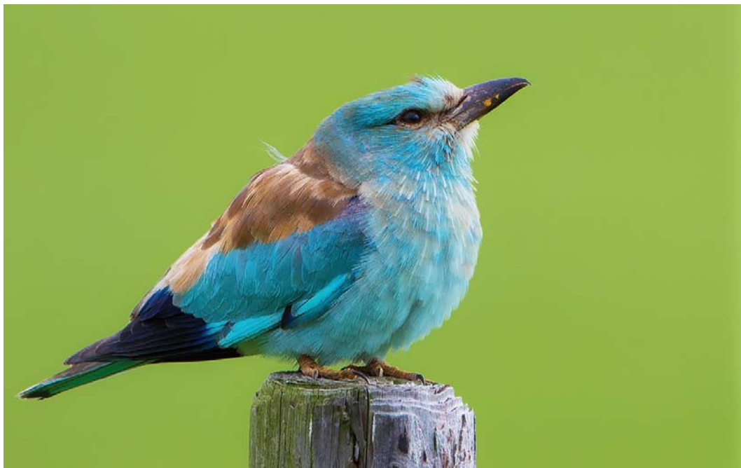
587 Scharrelaar / European Roller Coracias garrulus , adult, Akiab, Texel, Noord-Holland, 25 september 2018