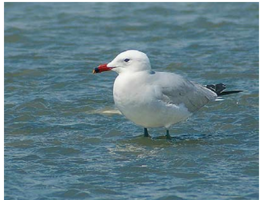
544 Red-flanked Bluetail / Blauwstaart Tarsiger cyanurus , first-winter, Kulu lake, Konya, Turkey, 28 October 2018 ( Hüseyin Bugday ) 545 Siberian Rubythroat / Roodkeelnachtegaal Calliope calliope , first-winter male, Skohalls, Hammarö, Värmland, Sweden, 26 October 2018 ( Stefan Göransson ) 546 White-crowned Sparrow / Witkruingors Zonotrichia leucophrys , first-winter, Foula, Shetland, Scotland, 3 October 2018 ( Dennis Morrison ) 547 Blyth's Pipit / Mongoolse Pieper Anthus godlewskii , first-winter, Jastarnia, Pomerania, Poland, 30 September 2018 ( Michał Radziszewski ) 548 Buff-breasted Sandpiper / Blonde Ruiter Calidris subruficollis , juvenile, Gaash, Israel, 24 October 2018 ( Gal Sherbelis ) 549 Audouin's Gull / Audouins Meeuw Larus audouinii , adult, Mzymta river mouth, Sochi, Krasnodar, Russia, 16 April 2018 ( Alexander Naumov ) cf Dutch Birding 40: 333, 2018