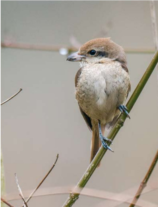
501 Brown Shrike / Bruine Klauwier Lanius cristatus , first-winter, Den Helder, Noord-Holland, 20 February 2017