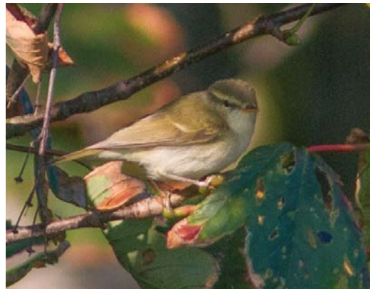
583 Kleine Zwartkop / Sardinian Warbler Sylvia melanocephala , adult mannetje, Burgumer Mar, Friesland, 28 augustus 2018 ( Germ de Vries ) 584 Kleine Zwartkop / Sardinian Warbler Sylvia melanocephala , adult mannetje, Burgumer Mar, Friesland, 10 oktober 2018 ( Herman Bouman ) 585 Raddes Boszanger / Radde's Warbler Phylloscopus schwarzi , Castricum, Noord-Holland, 8 oktober 2018 ( Rob van Bemmelen ) 586 Grauwe Fitis / Greenish Warbler Phylloscopus trochiloides , Schiermonnikoog, Friesland, 2 september 2018 ( Julian Bosch )

ven op 31 augustus en 1 september op het Westerstrand van Schiermonnikoog; van 6 tot 9 september op de Marker Wadden, Flevoland; van 21 september tot 1 oktober in de Sophiapolder bij Oostburg, Zeeland; en van 11 tot 16 oktober bij Oost op Texel. Gestreepte Strandlopers C melanotos werden op acht plekken gevonden. Het ging steeds om solitaire vogels, behalve in de Ezumakeeg, waar op 13 september twee exemplaren foerageerden. Grauwe Franjepoten Phalaropus lobatus draaiden hun rondjes in c 20 uurhokken, met een duidelijke voorkeur voor het noordwesten van het land. Hier werden ook de grootste groepjes gezien; telkens vier in de Oostvaardersplassen, Flevoland, Dijkgaatsweide in de Wieringermeer, Noord-Holland, en Polder Koegras onder Den Helder, Noord-Holland. In totaal 15 Rosse Franjepoten P fulicarius werden opgemerkt op trekelposten en op c 20 locaties langs de kust werden pleisterende waargenomen. Bijzonder was een exemplaar ver in het binnenland bij Nederweert, Limburg, op 30 sep-