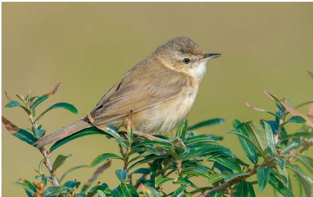
556 Paddyfield Warbler / Veldrietzanger Acrocephalus agricola , first-winter, Zeebrugge, Belgium, 20 October 2018