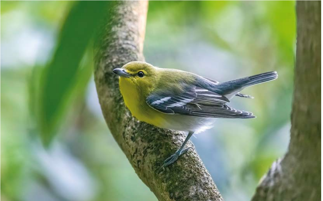
570 Yellow-throated Vireo / Geelborstvireo Vireo flavifrons , first-winter, Corvo, Azores, 16 October 2018