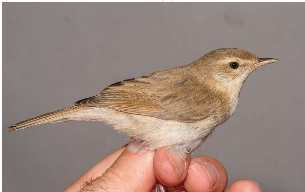
592 Kleine Spotvogel / Booted Warbler Iduna caligata , eerste-winter, Castricum, Noord-Holland, 5 september 2018 (Arnold Wijker)