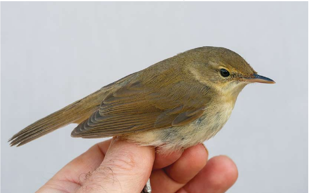
594 Struikrietzanger / Blyth's Reed Warbler Acrocephalus dumetorum , eerste-winter, Castricum, Noord-Holland, 7 oktober 2018 (Arnold Wijker)