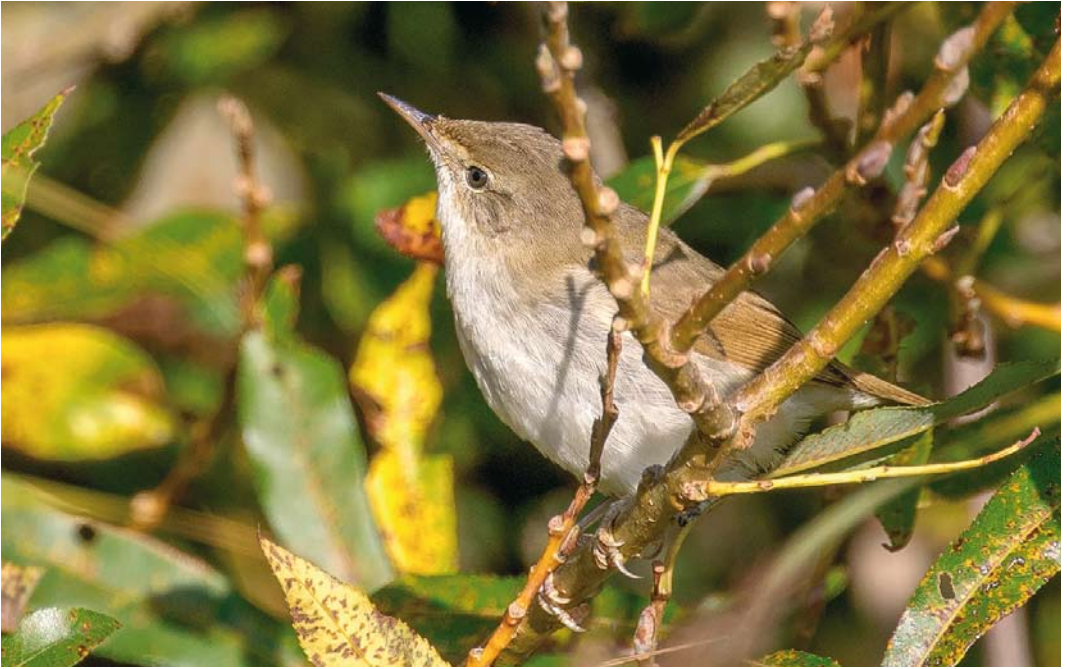
593 Struikrietzanger / Blyth's Reed Warbler Acrocephalus dumetorum , eerste-winter, Robbenjager, Texel, Noord-Holland, 5 oktober 2018