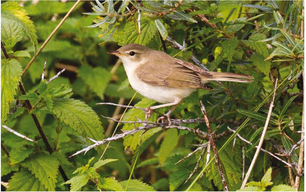
499 Booted Warbler / Kleine Spotvogel Iduna caligata , first-winter, Neeltje Jans, Zeeland, 19 September 2017 500 Blyth's Reed Warbler / Struikrietzanger Acrocephalus dumetorum , first-winter (left), and Eurasian Reed Warbler / Kleine Karekiet A. scirpaceus , first-winter, Kennemerduinen, Noord-Holland, 28 August 2017