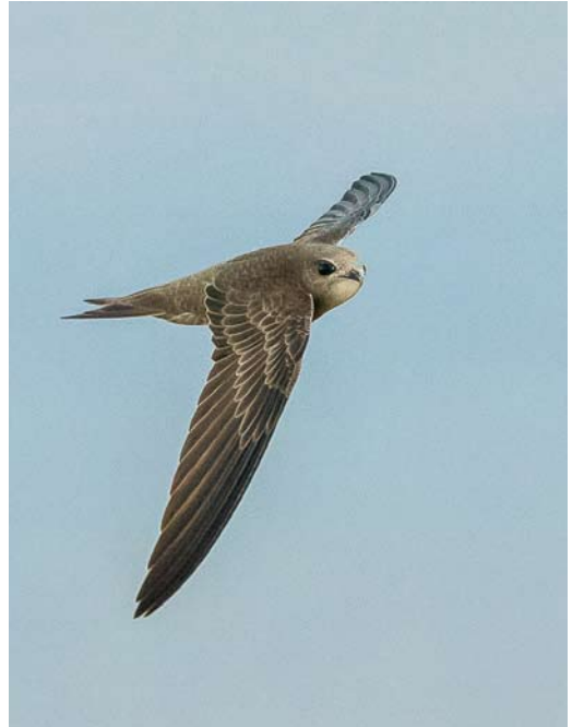
550 Rüppell's Vulture / Rüppells Gier Gyps rueppelli , immature, Tanoumah, Asir mountains, Saudi Arabia, 12 October 2018 551 Pallid Swift / Vale Gierzwaluw Apus pallidus , juvenile, De Cocksdorp, Texel, Noord-Holland, Netherlands, 11 November 2018 552 Red-tailed Wheatear / Roodstaarttapuit Oenanthe chrysopygia , Mount Amsa, Negev, Israel, 9 November 2018