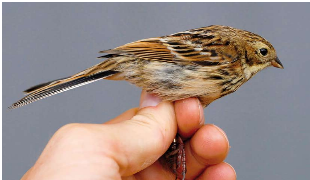
521 Pallas's Reed Bunting / Pallas' Rietgors Emberiza pallasi , juvenile, Beidaihe, Hebei, China, 10 September 2013 ( Gabriel Norevik ). Perfect example of juvenile plumage. Note poorly marked face and head, with no dark side to crown, and pinkish lower mandible. Ear-coverts are often (or always) more completely bordered dark in juvenile and first-winter Common Reed Bunting E schoeniclus . 522 Pallas's Reed Bunting / Pallas' Rietgors Emberiza pallasi , juvenile, Beidaihe, Hebei, China, 10 September 2013 ( Gabriel Norevik ). Same bird as in plate 521. Note drab brownish (almost sandy coloured) lesser coverts, quite unlike rustier, warmer lesser coverts of Common Reed Bunting E schoeniclus .