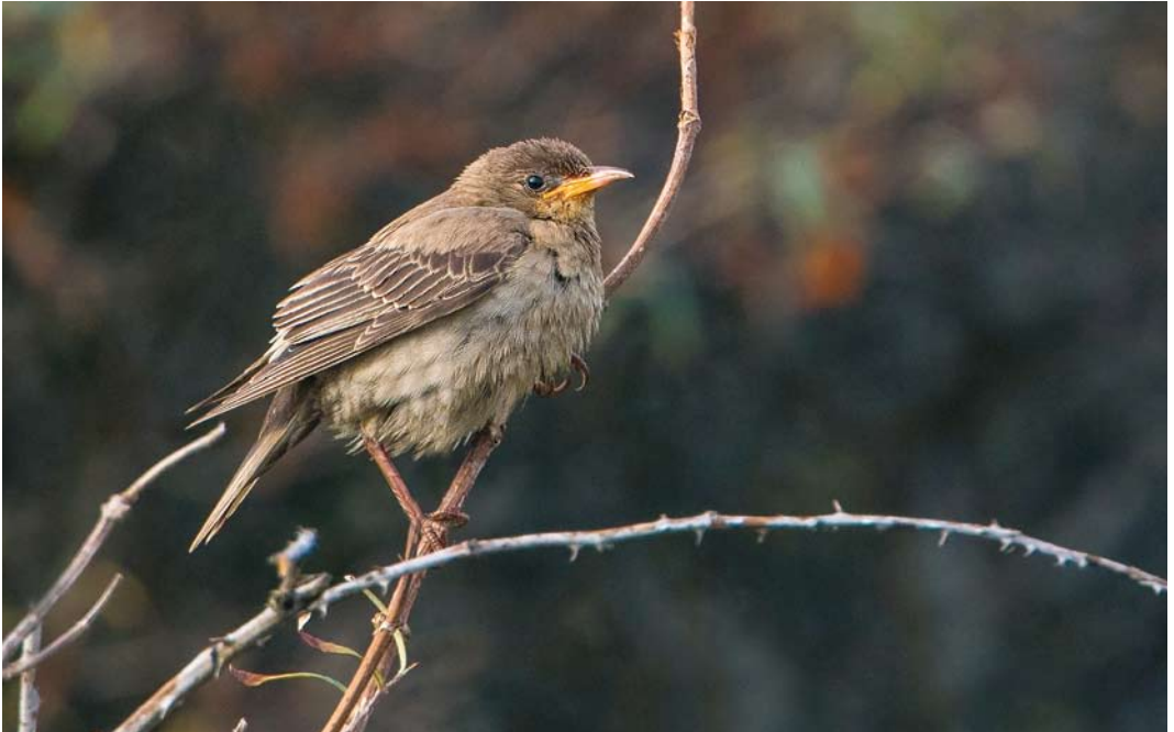
589 Roze Spreeuw / Rosy Starling Pastor roseus , juveniel, Ameland, Friesland, 20 oktober 2018