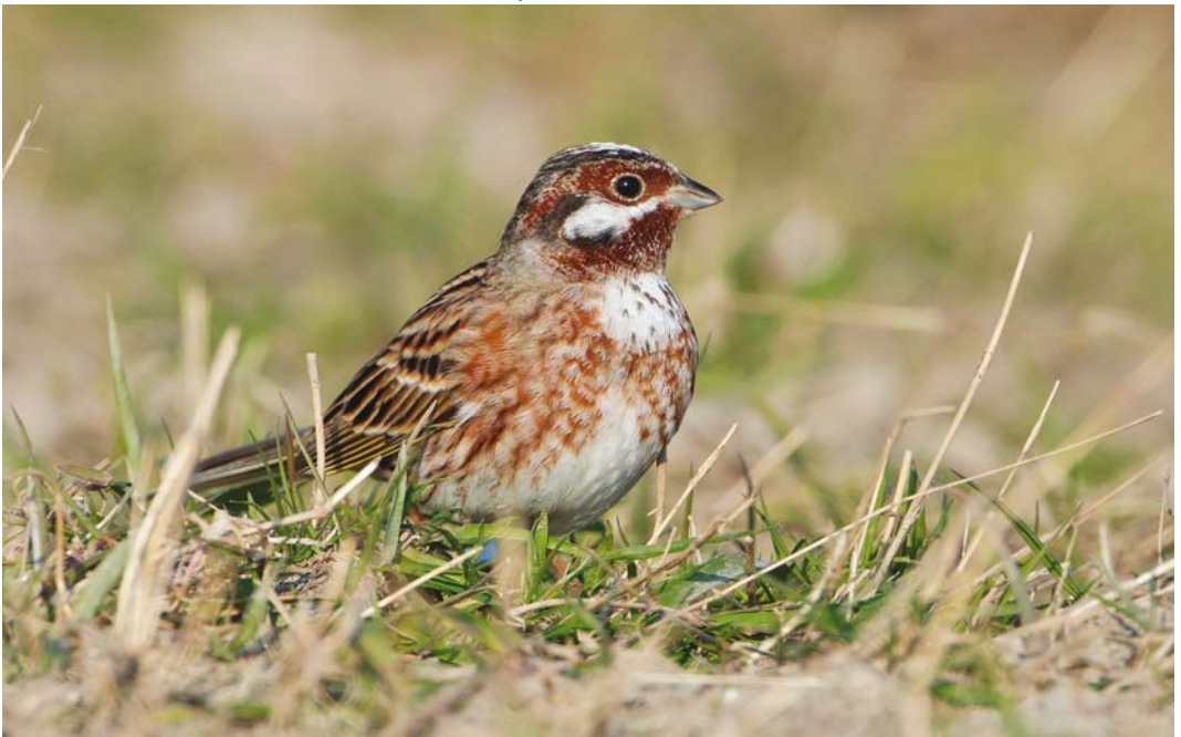
511 Yellowhammer x Pine Bunting / Geelgors x Witkopgors Emberiza citrinella x leucocephalos , male, Terschelling, Friesland, 3 April 2017