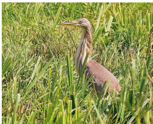
485 Brown Booby / Bruine Gent Sula leucogaster , adult, De Horde, Lopik, Utrecht, 20 August 2017 (Arjan Boele) 486 Yellow-billed Loon / Geelsnavelduiker Gavia adamsii , Westkapelle, Zeeland, 3 October 2017 (Lennart Verheувel) 487 Pacific Swift / Siberische Gierzwaluw Apus pacificus , Westkapelle, Zeeland, 12 June 2017 (Thomas Luiten) 488 Elegant Tern / Sierlijke Stern Sterna elegans , summer plumage, Wassenaarse Slag, Zuid-Holland, 9 June 2002 (Pieter Thomas) 489 Squacco Heron / Ralreiger Ardeola ralloides , first-winter, Eempolder, Utrecht, 12 September 2017 (Roy Slaterus)