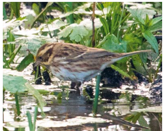
577 Mongoolse Pieper / Blyth's Pipit Anthus godlewskii , Vlieland, Friesland, 20 oktober 2018 578 Vale Gierzwaluw / Pallid Swift Apus pallidus , Waddenzee bij Rottumeroog, Groningen, 15 oktober 2018 579 Aziatische Roodborsttapuit / Siberian Stonechat Saxicola maurus , eerste-winter mannetje, Vlieland, Friesland, 6 oktober 2018 580 Siberische Boompieper / Olive-backed Pipit Anthus hodgsoni , Puinhoop, Katwijk, Zuid-Holland, 12 oktober 2018 581 Velddrietzanger / Paddyfield Warbler Acrocephalus agricola , eerste-winter, Castricum, Noord-Holland, 15 oktober 2018 582 Bosgors / Rustic Bunting Emberiza rustica , Westerplas, Schiermonnikoog, Friesland, 20 oktober 2018