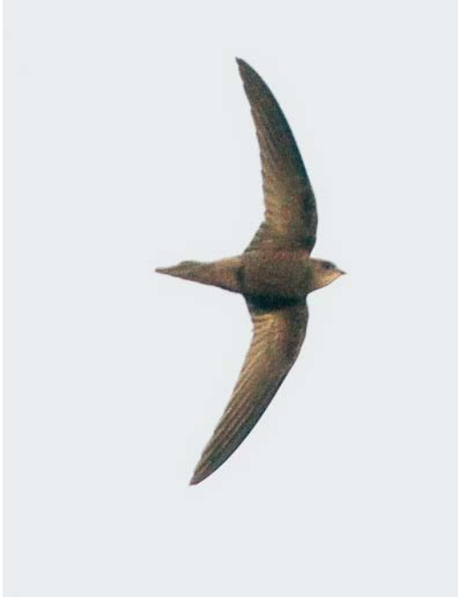
484 Pallid Swift / Vale Gierzwaluw Apus pallidus , juvenile, Ruige Plak, Vlieland, Friesland, 20 October 2017 (Lars Buckx)