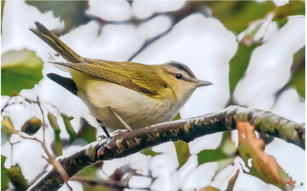
595 Roodoogvireo / Red-eyed Vireo Vireo olivaceus , eerste-winter, Krimbos, Texel, Noord-Holland, 27 oktober 2018 (Jos van den Berg/birdingtexel.com)