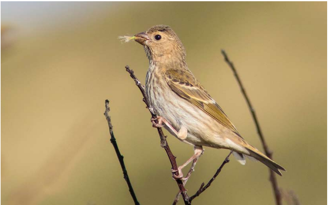
590 Roodmus / Common Rosefinch Erythrina erythrina , eerste-winter, Vlieland, Friesland, 19 oktober 2018 (Julian Bosch)