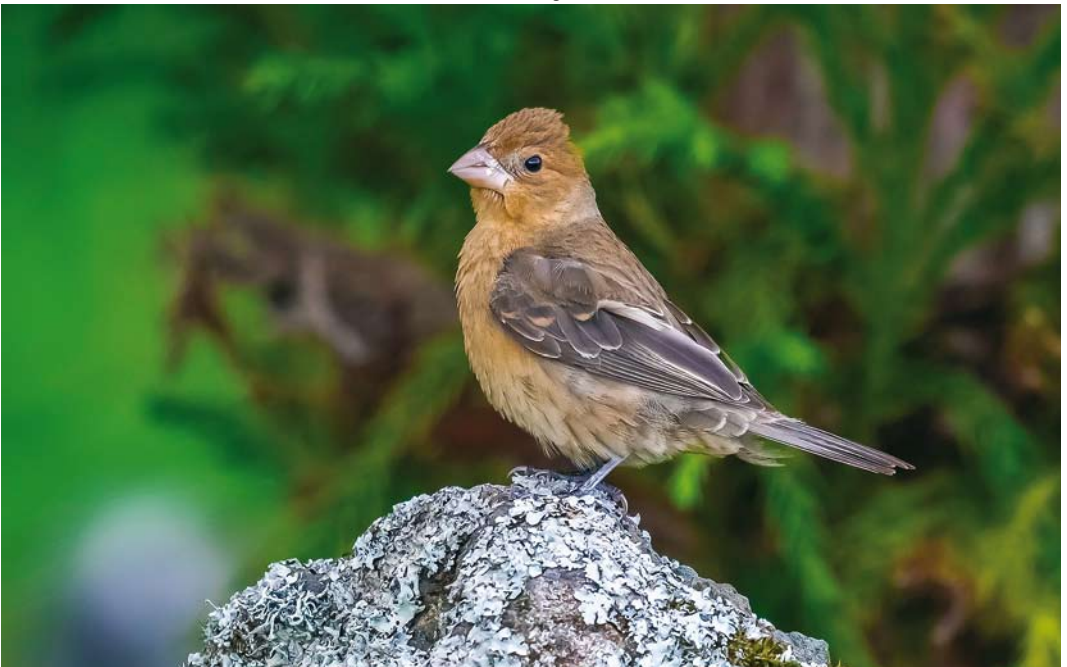
571 Blue Grosbeak / Blauwe Bisschop Passerina caerulea , first-winter, Corvo, Azores, 17 October 2018 (Vincent Legrand)