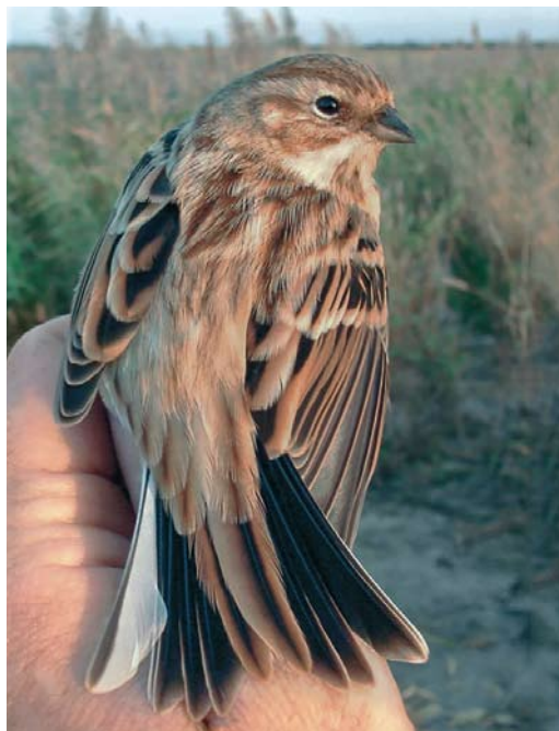
532 Pallas's Reed Bunting / Pallas' Rietgors Emberiza pallasi , Happy Island, Bohai Sea, Tangshan, Hebei, China, 8 October 2005 ( Sebastien Reeber ). Note rump and uppertail pattern, often a good field character but not helpful at all in juvenile plumage and before post-juvenile moult. Additionally, Common Reed Bunting E schoeniclus can sometimes be paler than usual and show much paler rump than normal.

Three subspecies of Pallas's Reed Bunting are recognized ( E p polaris , E p pallasi and E p lydiae ). E p polaris breeds from north-eastern European Russia across Siberia to the Okhotsk Sea, Chukchi peninsula and northern Kamchatka. The two other subspecies breed from the Tien Shan mountains to southern Siberia and probably also in north-eastern China. The species winters in China, southern Ussuriland, Russia, and Korea (Copete 2018). It has been recorded as vagrant in Alaska, USA, Hong Kong, China, and Taiwan (Howell et al 2014, Copete 2018). Main autumn passage in southern Siberia and north-eastern China takes place from mid-September to late October. Wintering areas are occupied mainly between October and March, with some individuals still present until May. Main spring migration is during the second half of April, and in central Siberia mostly between May and early June (Copete 2018).