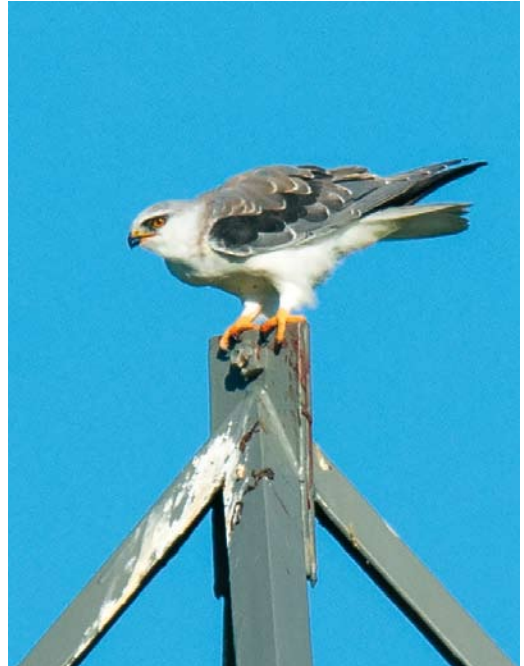
493 Black-winged Kite / Grijze Wouw Elanus caeruleus , first-winter, Kollumerwaard, Lauwersmeer, Friesland, 21 December 2017 ( Diederick Meinen ) 494 Black-winged Kite / Grijze Wouw Elanus caeruleus , first-winter, Overschild, Groningen, 13 August 2017 ( Marnix Jonker ) 495 Eastern Imperial Eagle / Keizerarend Aquila heliaca , fourth calendar-year, Hasselt, Overijssel, 4 October 2017 ( Michel Veldt ) 496 Eastern Imperial Eagle / Keizerarend Aquila heliaca , fourth calendar-year, Brobbelbies, Schaijk, Noord-Brabant, 27 September 2017 ( Toy Janssen )