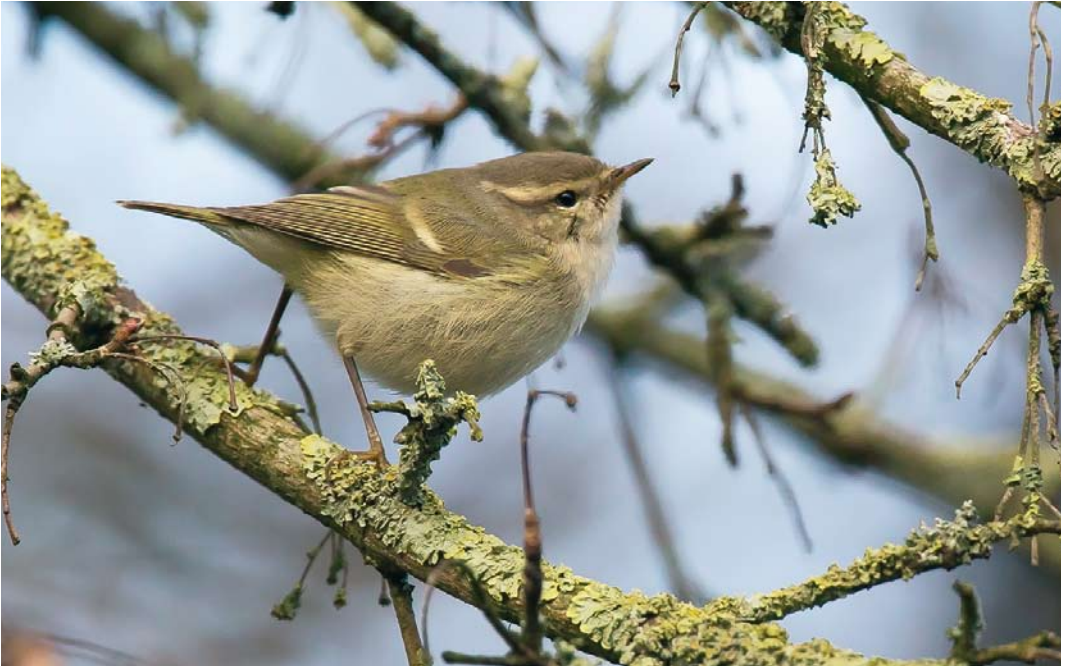
513 Humes Bladkoning/ Hume's Leaf Warbler Phylloscopus humei , Beijum, Groningen, Groningen, 27 december 2012 (Gerrit Kiekebos)

blijven vaak weken of zelfs maanden aanwezig en wellicht wordt de soort daarom vaak met de winter geassocieerd. Dat vertelt maar een deel van het fenologische verhaal, want in werkelijkheid worden de meeste tijdens de najaarstrek waargenomen (figuur 2). Dan trekken ze pas laat door, tussen half oktober en half november. De vroegste werd op 11 oktober ontdekt, ruim vijf weken na de vroegst gedocumenteerde inornatus (5 september; waarneming.nl). De mediane doortrekperiode ligt in de eerste decade van november; voor inornatus is dat (op basis van ingevoerde gevallen op waarneming.nl) in de eerste decade van oktober.