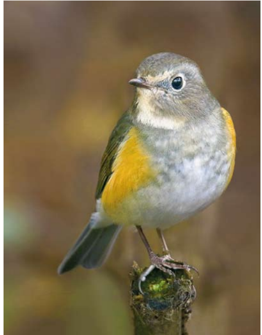
502 Red-flanked Bluetail / Blauwstaart Tarsiger cyanurus , first-winter, Beijum, Groningen, Groningen, 26 November 2017 (Thijs Glastra)