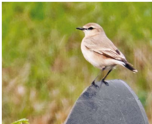
504 Isabelline Wheatear / Izabeltapuit Oenanthe isabellina , first-winter, Dorpszicht, Texel, Noord-Holland, 26 October 2017

Birding 40: 67, plate 84, 155, plate 209, 2018). 2011 13 November, Oosterend, Terschelling , Friesland, male, photographed (H van Diek; Ebels et al 2018; Dutch Birding 34: 68, plate 90, 2012, 40: 155, plate 202, 2018).