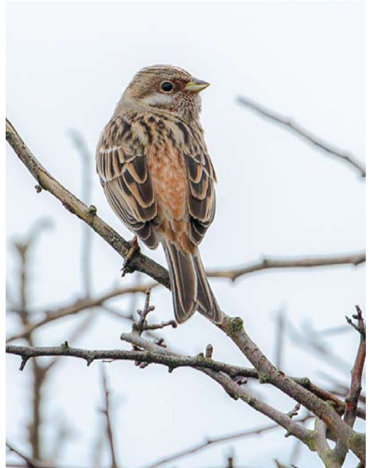
505 Blue Rock Thrush / Blauwe Rotslijster Monticola solitarius , first-summer male, Noordoosthoek, Vlieland, Friesland, 25 April 2017 506 Pine Bunting / Witkopgors Emberiza leucocephalos , first-winter male, Loodsmansduin, Texel, Noord-Holland, 8 January 2017 507 Eyebrowed Thrush / Vale Lijster Turdus obscurus , first-winter male, Oost-Vlieland, Vlieland, Friesland, 21 October 2017