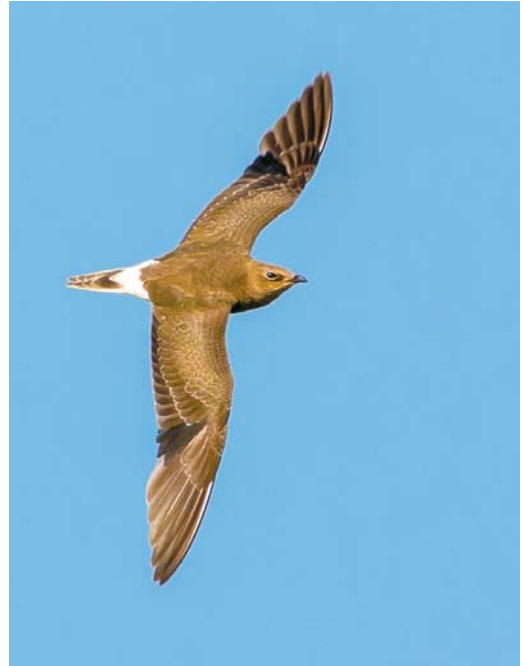
574 Grijze Wouw / Black-winged Kite Elanus caeruleus , adult, Grootte Peel, Limburg, 17 september 2018 575 Stepevorkstaartplevier / Black-winged Pratincole Glareola nordmanni , eerste-winter, Batenburg, Gelderland, 21 oktober 2018 576 Blonde Ruiter / Buff-breasted Sandpiper Calidris subruficollis , juveniel, Sophiapolder, Oostburg, Zeeland, 25 september 2018