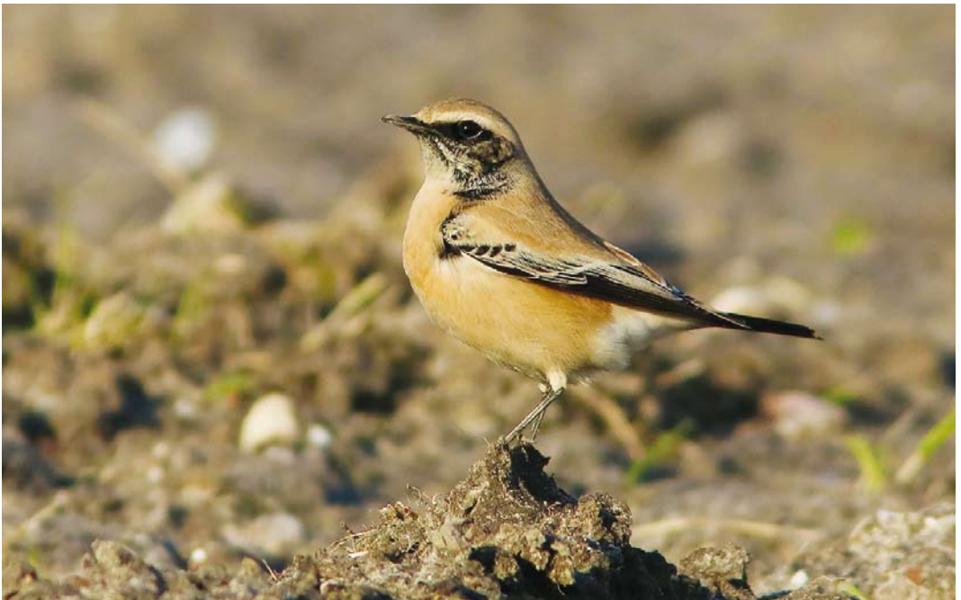
509 Desert Wheatear / Woestijntapuit Oenanthe deserti , first-winter male, Schiphol, Noord-Holland, 22 November 2017