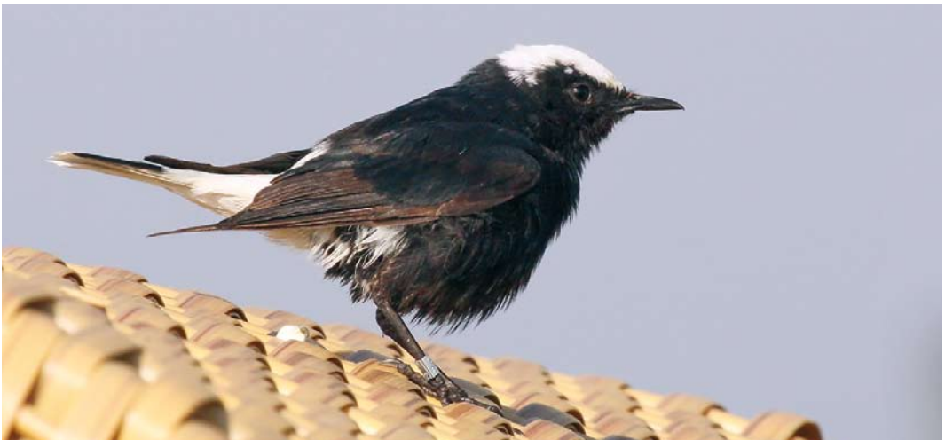
535 White-crowned Wheatear / Witkruintapuit Oenanthe leucopyga , second-calendar year, Saltbæk Vig, Sjælland, Denmark, 1 July 2010 536-537 White-crowned Wheatear / Witkruintapuit Oenanthe leucopyga , second-calendar year, Wremen, Niedersachsen, Germany, 23 September 2010. Same bird as in plate 535.

ring) was photographed on Ameland, Friesland, on 2 November (Haas et al 2015). A recent bird, observed in gardens in Lincolnshire, England, on 1-2 December 2017 was also a confirmed escape (for other reports in Britain and Ireland, see Slack (2009)).