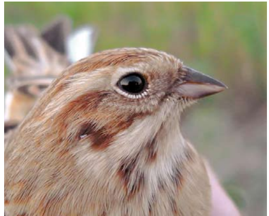
529 Pallas's Reed Bunting / Pallas' Rietgors Emberiza pallasi , first-winter, Happy Island, Bohai Sea, Tangshan, Hebei, China, 8 October 2005 ( Sebastien Reeber ) 530 Pallas's Reed Bunting / Pallas' Rietgors Emberiza pallasi , male, winter plumage, Happy Island, Bohai Sea, Tangshan, Hebei, China, 8 October 2005 ( Sebastien Reeber ). In this winter plumage male, lesser coverts are strikingly and uniquely lead-grey. 531 Pallas's Reed Bunting / Pallas' Rietgors Emberiza pallasi , first-winter, Happy Island, Bohai Sea, Tangshan, Hebei, China, 8 October 2005 ( Sebastien Reeber ). Close view of head to show bill structure and colour and head pattern.

horn-grey lower mandible. In some Common Reed – in both juveniles and first-winters, chiefly of the eastern taxa (but also in some European birds), the lower mandible may show a yellowish or yellowish-pink tinge, and could appear rather pale under field conditions (plate 534). However, the lower mandible is never distinctly pinkish as in Pallas's Reed.