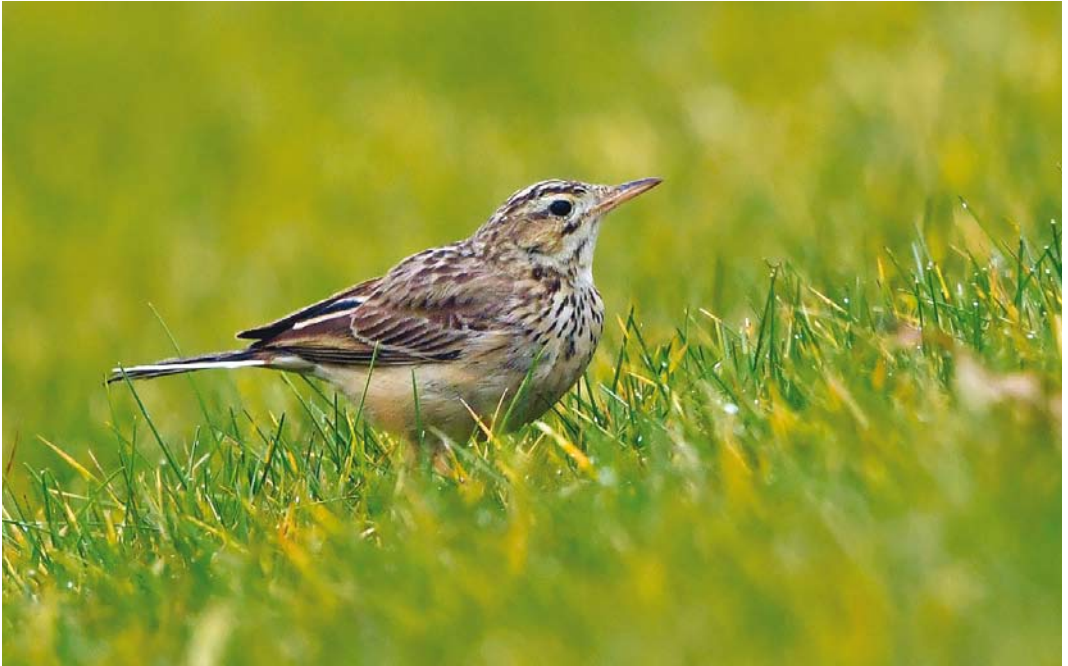
510 Blyth's Pipit / Mongoolse Pieper Anthus godlewskii , first-winter, Brabantse Biesbosch, Noord-Brabant, 4 February 2017 (Edial Dekker)