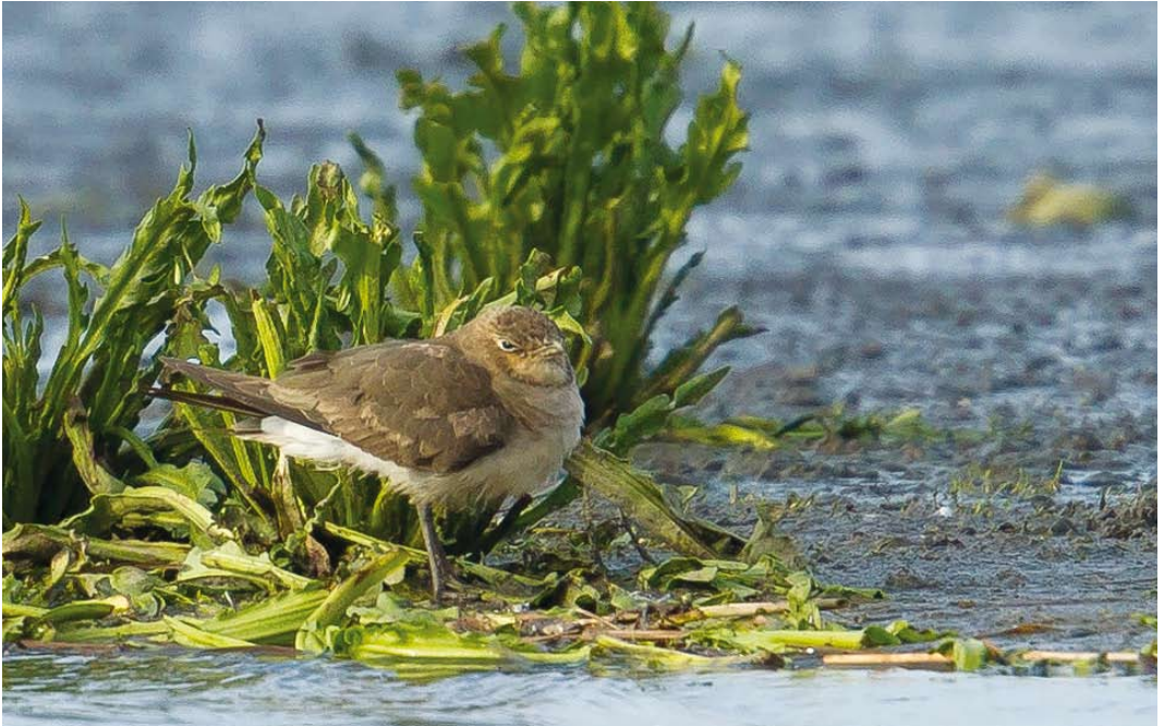
490 Black-winged Pratincole / Stepevorkstaartplevier Glareola nordmanni , first-winter, Stad aan 't Haringvliet, Zuid-Holland, 28 November 2017 (Kris De Rouck)