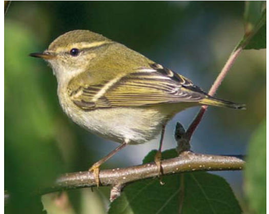
596 Bladkoning / Yellow-browed Warbler Phylloscopus inornatus , Vlieland, Friesland, 19 oktober 2018 (Julian Bosch)

opvallende een pleisteraar van 11 tot 15 oktober nabij Leeuwarden. Er waren ringvangsten op 6, 13 en 16 oktober bij Kamperhoek, Flevoland, op 15 oktober op Vlieland en op 18 oktober bij Castricum. Nabij de Westerpas op Schiermonnikoog liet een Bosgors E rustica zich van 20 tot 22 oktober bij tijd en wijle goed bekijken.