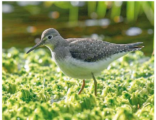
539 Cinereous Vulture / Monniksgier Aegypius monachus , second calendar-year, Kirkkonummi, Uusimaa, Finland, 24 October 2018 540 Chimney Swift / Schoorsteengierzwaluw Chaetura pelagica , Corvo, Azores, 22 October 2018 541 White-rumped Swift / Kaffergierzwaluw Apus caffer , first-winter, Hornsea Mere, Yorkshire, England, 14 October 2018 542 Green Heron / Groene Reiger Butorides virescens , adult, Quinta do Lago, Algarve, Portugal, 19 October 2018 543 Solitary Sandpiper / Amerikaanse Bosruiter Tringa solitaria , juvenile, Værlandet, Sogn og Fjordane, Norway, 7 October 2018