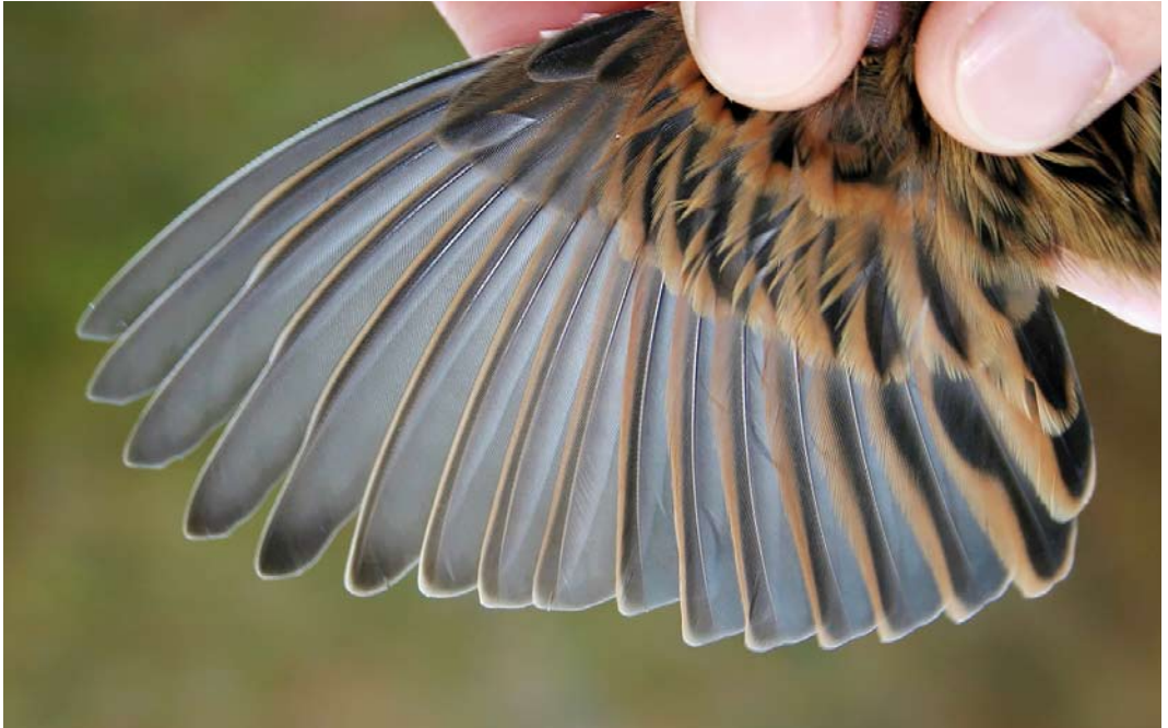
533 Common Reed Bunting / Rietgors Emberiza schoeniclus schoeniclus , adult female, Torre Flavia, Roma, Lazio, Italy, 18 October 2007 (Enzo Savo/INSPIRA). Note richer coloured wing-coverts in this species (at any age), with median and lesser coverts rich rusty-chestnut, unlike drabber, duller colour in Pallas's Reed Bunting E pallasii .

534 Common Reed Bunting / Rietgors Emberiza schoeniclus schoeniclus , first-winter, Torre Flavia, Roma, Lazio, Italy, 28 October 2007 (Enzo Savo/INSPIRA). Small-billed bird. Note that some smallest billed European birds may have bill shape almost identical to Pallas's Reed Bunting E pallasii , with upper mandible just barely more convex. Colour of lower mandible can be extremely hard to assess and could, under field conditions, appear almost as pale as in Pallas's Reed; usually it is tinged greyish but can occasionally look pinkish-horn. These birds may require extreme care and close scrutiny, with sound recordings of call being essential.