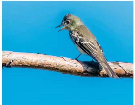
560 Western Kingbird / Arkansaskoningstiran Tyrannus verticalis , Flores, Azores, 14 October 2018 ( Thijs Valkenburg ) 561 White-eyed Vireo / Witoogvireo Vireo griseus , Corvo, Azores, 20 October 2018 ( Radosław Gwóźdź ) 562 Wilson's Warbler / Wilsons Zanger Cardellina pusilla , first-winter female, Corvo, Azores, 13 October 2018 ( Radosław Gwóźdź ) 563 Magnolia Warbler / Magnoliazanger Setophaga magnolia , Corvo, Azores, 27 October 2018 ( David Monticelli ) 564 Eastern Wood Pewee / Oostelijke Bospiewie Contopus virens , first-winter, Corvo, Azores, 20 October 2018 ( Vincent Legrand )