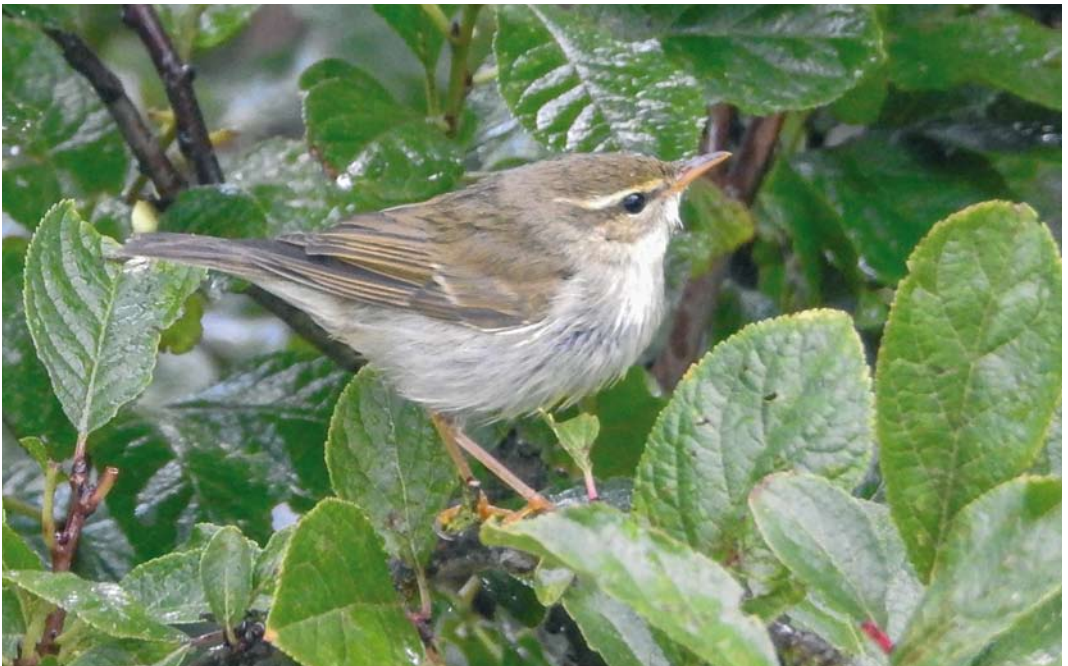
498 Arctic Warbler / Noordse Boszanger Phylloscopus borealis , Oost, Texel, Noord-Holland, 15 September 2017