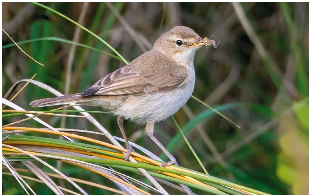
591 Kleine Spotvogel / Booted Warbler Iduna caligata , eerste-winter, Vlieland, Friesland, 16 september 2018