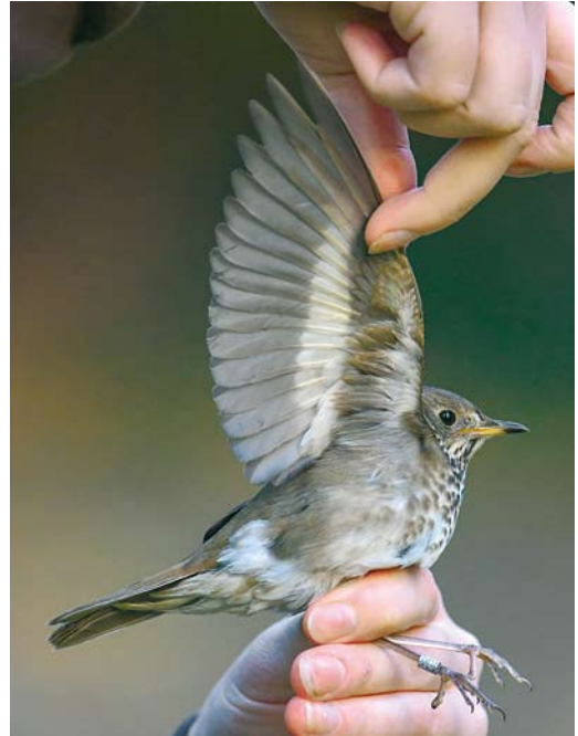
565 Asian Desert Warbler / Woestijngrasmus Sylvia nana , Helgoland, Schleswig-Holstein, Germany, 19 October 2018 566 Grey-cheeked Thrush / Grijswangdwerglijster Catharus minimus , first-winter (picked up at Monster, Zuid-Holland, Netherlands), Den Haag, Zuid-Holland, 5 November 2018

for Ireland stayed on Cape Clear on 17-18 October. If accepted, a first-winter female Naumann's Thrush Turdus naumanni photographed at Patamalm, Mönsterås, Småland, on 11-13 November will be the first for Sweden. A Dusky Thrush T. eunomus was briefly seen at Easington, East Yorkshire, England, on 4 November. Male Black-throated Thrushes T. atrogularis were found at Käärnelahti, Maaninka, Finland, on 21 October and at Burnham Overy, Norfolk, on 27 October. In England, an American Robin T. migratorius turned up on Lundy on 26 October. The sixth for Iceland was photographed at Seltjörn, Njarðvík, on 29 October.