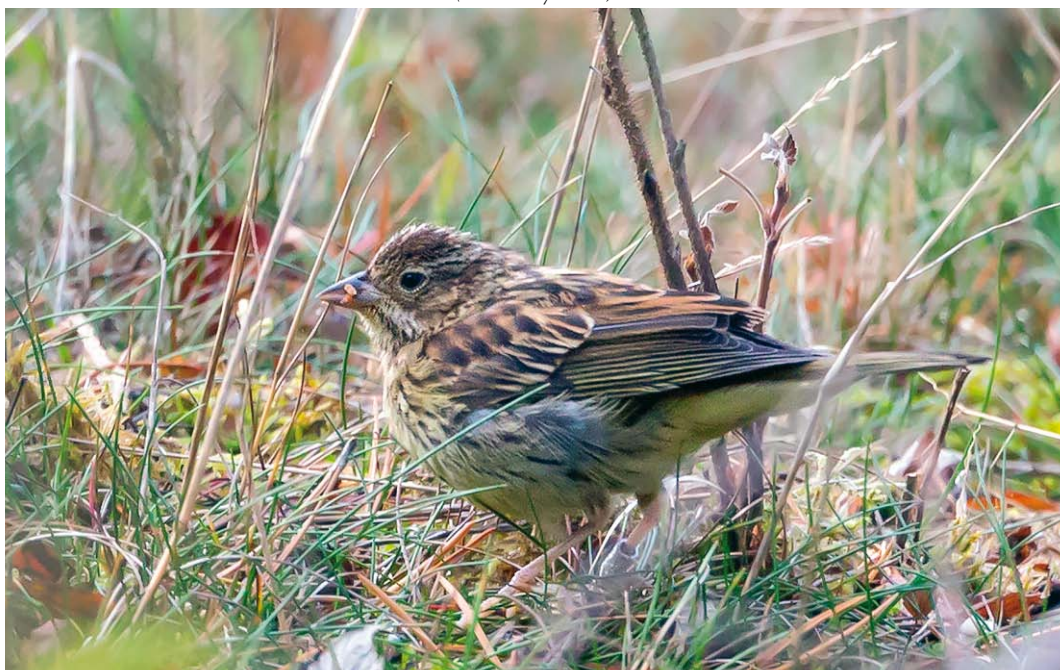
557 Chestnut Bunting / Rosse Gors Emberiza rutila , first-winter, Säppi, Eurajoki, Finland, 25 October 2018 (Petteri Hytönen)