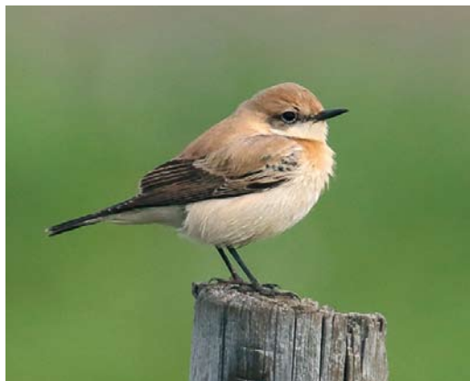
503 Western Black-eared Wheatear / Westelijke Blonde Tapuit Oenanthe hispanica , first-winter male, Waal en Burg, Texel, Noord-Holland, 19 October 2017