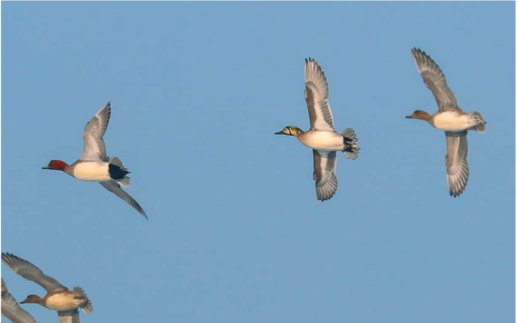
483 Baikal Teal / Siberische Taling Anas formosa , male, with Eurasian Wigeons / Smienten A penelope , Noordwijk, Zuid-Holland, 14 February 2017

26 April 2016), Gaatkensplas and surroundings, Barendrecht , Zuid-Holland, adult male; # 21-23 October (was 22-23 October), De Nek, Schellinkhout, Drechterland , Noord-Holland, male.