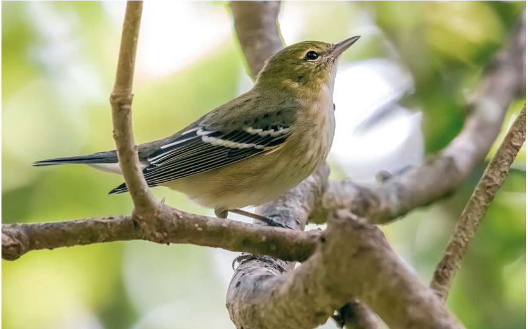
572 Bay-breasted Warbler / Kastanjezanger Setophaga castanea , first-winter female, Corvo, Azores, 17 October 2018 (Vincent Legrand)

O deserti for Latvia was photographed at Liepaja harbor on 31 October. A juvenile on Linosa on 3 November was the first ever in autumn for Italy. A Red-tailed Wheatear O chrysopygia trapped at Amsa mount, Negev, Israel, on 9 November may be the same individual as the one here in March-April (cf Dutch Birding 30: 191, 2018).