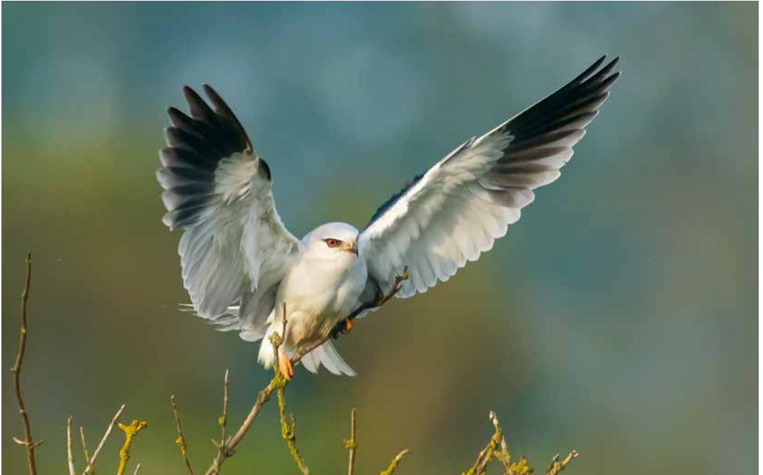
375 Grijsze Wouw / Black-winged Kite Elanus caeruleus , Terhole, Zeeland, 11 mei 2019