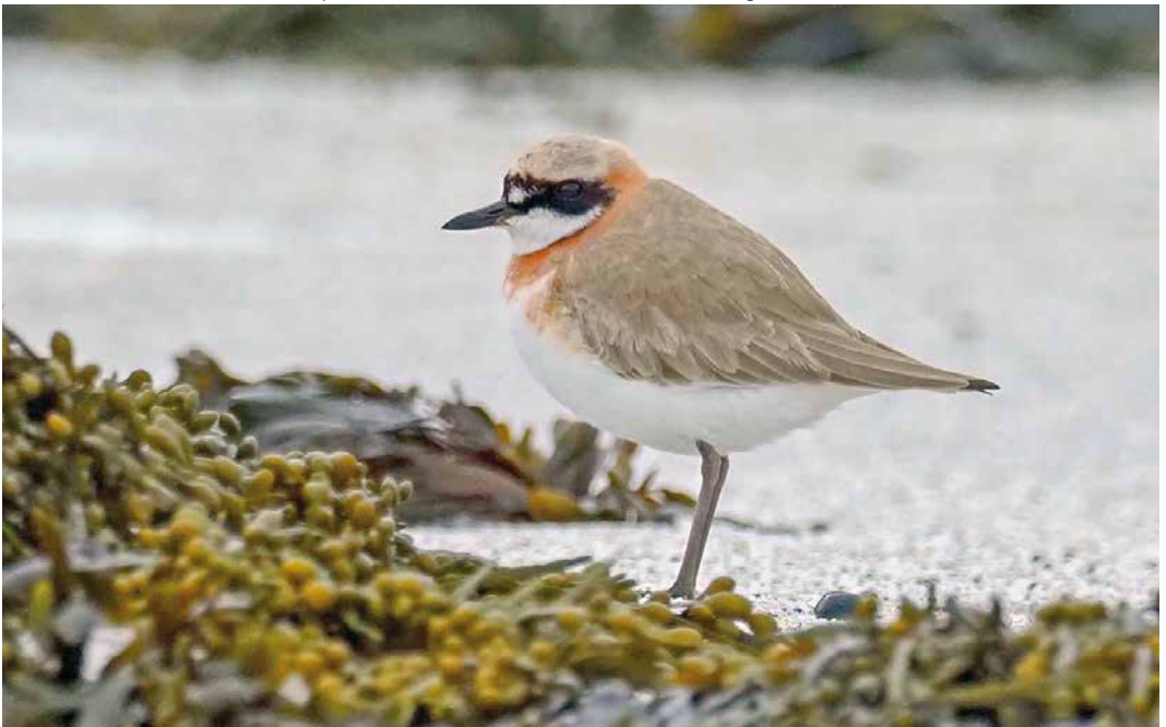
357 Greater Sand Plover / Woestijnplover Anarhynchus leschenaultii , adult, Slettnes, Finnmark, Norway, 16 May 2019 (Markku Saarinen) cf Dutch Birding 41: 194, 2019