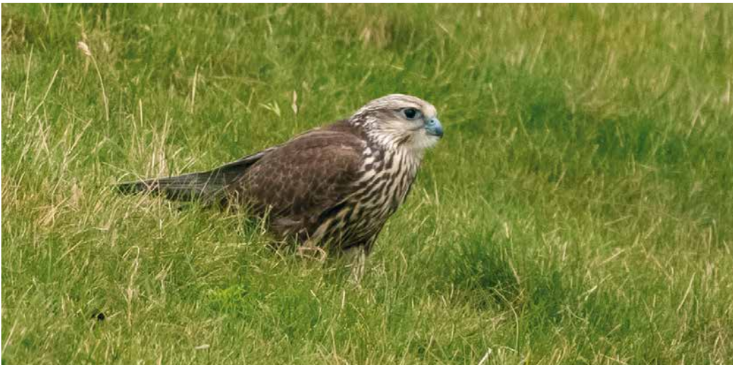
401 Sakervalk / Saker Falcon Falco cherrug , juveniel, Wieringen, Noord-Holland, 20 juli 2019

Op 27 juni zag Libbe Zijlstra vanuit zijn rijdende auto langs de provinciale weg tussen Workum en Parrega, Friesland, een afwijkende vogel tussen de Kieviten V. vanellus staan. Het bleek een Grijskopkievit V. cinereus , een broedvogel van Noordoost-China en Japan die 's winters regelmatig ver wegtrekt naar Zuidoost-Azië en in 2006-17 zelfs zes keer als dwaalgast Australië bereikte. Deze vogel trok anders dan de vorige drie nieuwe soorten wel direct heel veel vogelaars. Dat kwam omdat het mogelijk dezelfde was als de eerste voor Europa die twee maanden eerder in het zuiden van Noorwegen en Zweden verbleef en waarvan de foto's nog vers in het geheugen lagen. Hij liet zich ook op 28 juni nog bekijken maar vloog om 20:45 weg en was daarna niet meer te vinden. Of het echt om het-