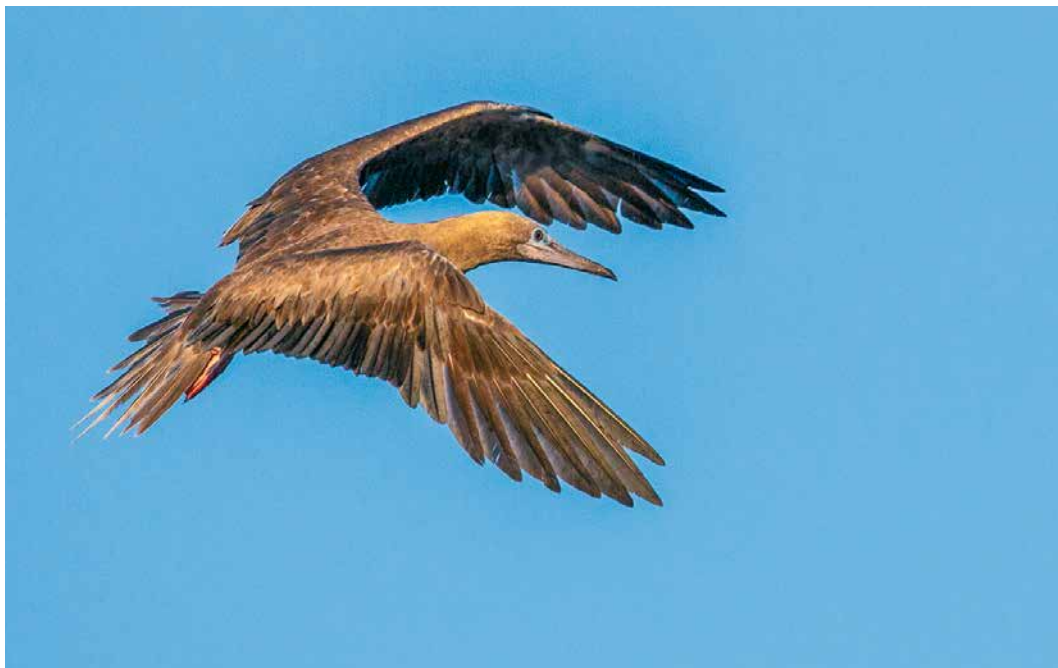
344 Red-footed Booby / Roodpootgent Sula sula , subadult, Caleta de Vélez harbour, Málaga, Spain, 18 June 2019 (Alex Colorado)