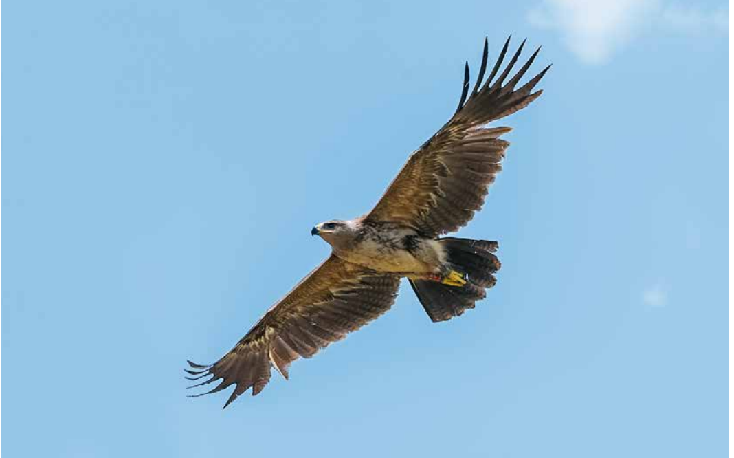
364 Hybrid Lesser Spotted x Greater Spotted Eagle / hybride Schreeuwarend x Bastaardarend Clanga pomarina x clanga, second calendar-year, Witkowo, Western Pomerania, Poland, 5 June 2019. Ringed as pul- lus at Kampinowska forest, Mazowsze, Poland, on 3 July 2018. 365 Cinereous Vulture / Monniksgier Aegypius monachus, second calendar-year, Hellendoorn, Overijssel, Netherlands, 25 May 2019 cf Dutch Birding 41: 198, 2019