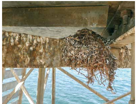
315 Rocky islet with breeding site of African Pied Wagtail Motacilla aguimp , lake Nasser, Egypt, 26 April 2016 ( Jens Hering ) 316 Rocky islet with breeding site of African Pied Wagtail Motacilla aguimp and House Sparrow Passer domesticus colony, lake Nasser, Egypt, 2 May 2016 ( Jens Hering ) 317 Flat rocky islet with breeding site of African Pied Wagtail Motacilla aguimp at edge of colony of Gull-billed Tern Gelochelidon nilotica , lake Nasser, Egypt, 29 April 2017 ( Jens Hering ) 318 Maritime aid with nest of African Pied Wagtail Motacilla aguimp from previous season and occupied breeding site of Yellow-billed Kite Milvus aegyptius , lake Nasser, Egypt, 6 January 2018 ( Jens Hering ) 319 Rock caves with one occupied and one empty nest of African Pied Wagtail Motacilla aguimp , lake Nasser, Egypt, 1 May 2016 ( Jens Hering ) 320 Nest of African Pied Wagtail Motacilla aguimp from previous breeding season on steel girder belonging to maritime aid, lake Nasser, Egypt, 6 January 2018 ( Jens Hering )