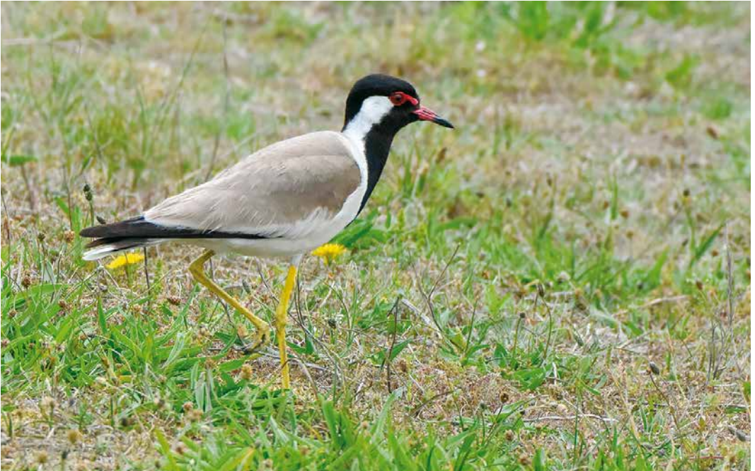
358 Red-wattled Lapwing / Indische Kievit Vanellus indicus , De Tuintjes, De Cocksdorp, Texel, Noord-Holland, Netherlands, 19 June 2019 ( René Pop )