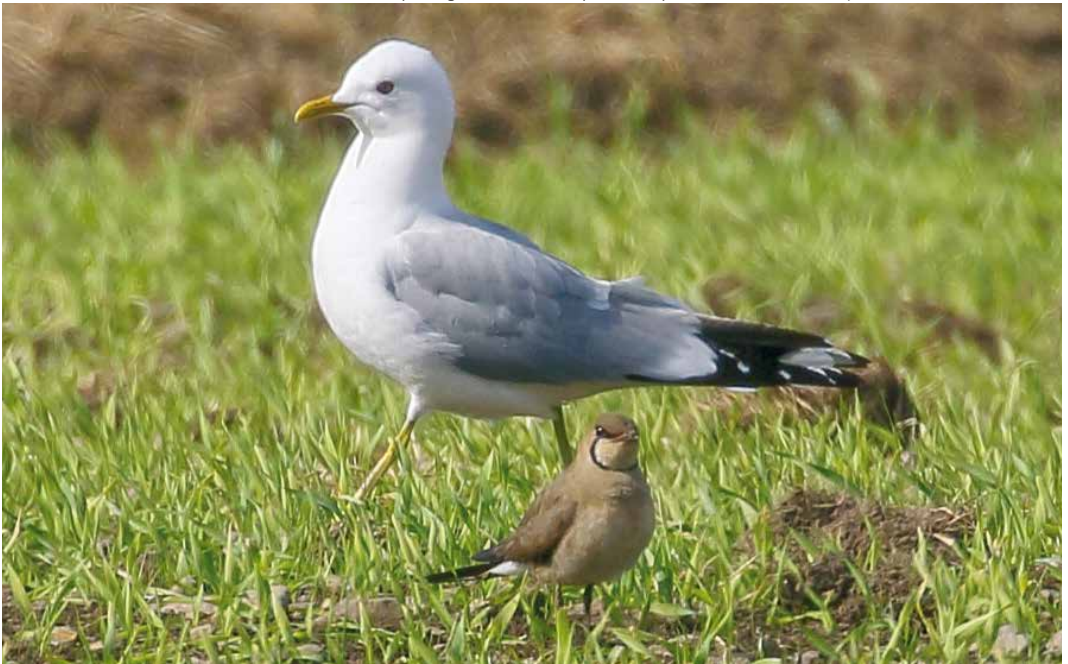
347 Oriental Pratincole / Oosterse Vorkstaartplevier Glareola maldivarum , with Common Gull / Stormmeeuw Larus canus , Hillesland, Karmøy, Rogaland, Norway, 27 May 2019 (Frank Steinkjellå)