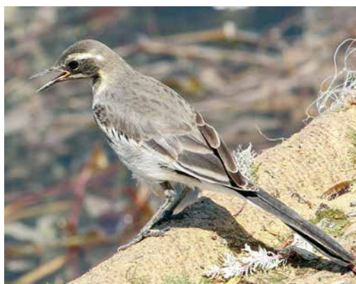
321 Nest of African Pied Wagtail Motacilla aguimp vidua containing two eggs, lake Nasser, Egypt, 1 May 2016 ( Jens Hering ) 322 African Pied Wagtail / Afrikaanse Bonte Kwikstaart Motacilla aguimp vidua , nestling of c 10 days old, lake Nasser, Egypt, 2 May 2016 ( Jens Hering ) 323 African Pied Wagtail / Afrikaanse Bonte Kwikstaart Motacilla aguimp vidua , juvenile, lake Nasser, Egypt, 6 May 2016 ( Mohamed I Habib ) 324 African Pied Wagtail / Afrikaanse Bonte Kwikstaart Motacilla aguimp vidua , juvenile, lake Nasser, Egypt, 1 May 2016 ( Mohamed I Habib )

catch any adult African Pied Wagtail with either mist-nets or traps.