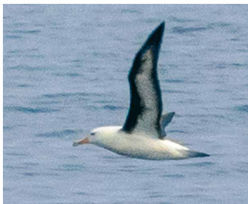
352 Crested Honey Buzzard / Aziatische Wespendiff Pernis ptilorhynchus , female, Masalli, Azerbaijan, 23 May 2019 (Richard Ek) 353 Grey-headed Lapwing / Grijskopkievit Vanellus cinereus , Strandvik, Värmland, Sweden, 14 May 2019 (Jan Gustafsson) 354 Trindade Petrel / Arminjons Stormvogel Pterodroma arminjoniana , pale morph, c 3 km south of Pico, Azores, 26 May 2019 (Roxane Rambert) 355 Black-browed Albatross / Wenkbrauwalbatros Thalassarche melanophris , immature, Garðskagi lighthouse, Iceland, 12 June 2019 (Fredrik Sahlin)

high walls, supposedly attracting other individuals into the death trap by calling; 15% of the corpses had rings which revealed that most must have been subadults (Scott Birds 39: 132-135, 2019). A pale-morph Trindade Petrel Pterodroma arminjoniana was photographed c 3 km south of Pico, Azores, on 26 May. On Montaña Clara islet near Lanzarote, Canary Islands, a Cape Verde Shearwater Calonectris edwardsii was again trapped on 9 July (the first on this islet was trapped on 6 June 2010 and then the species was found here, eg, on 22 July 2016; Dutch Birding 32: 266, 2010, 38: 398, 2016); this time, however, the bird not only had a brood patch but also went into an inaccessible burrow when released. On Lundy, England, the breeding population of Manx Shearwater Puffinus puffinus increased from 297 pairs in 2001 to 5504 in 2017-18, in response to the eradication of rats from the island in the winters of 2002/03 and 2003/04 (Br Birds 112: 217-230, 2019).