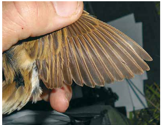
337 Common Grasshopper Warbler / Sprinkhaanzanger Locustella naevia naevia , male, Turku, Finland, 14 June 2016 (Jari Korhonen) 338-339 Common Grasshopper Warbler / Sprinkhaanzanger Locustella naevia naevia , male, Kaarina, Finland, 2 July 2016 (Jari Korhonen) 340 Common Grasshopper Warbler / Sprinkhaanzanger Locustella naevia naevia , male, Salo, Finland, 30 July 2016 (Jari Korhonen) 341 Common Grasshopper Warbler / Sprinkhaanzanger Locustella naevia naevia , yellow morph male, Turku, Finland, 26 May 2016 (Jari Korhonen) 342 Common Grasshopper Warbler / Sprinkhaanzanger Locustella naevia naevia , Raisio, Finland, 4 June 2016 (Jari Korhonen). Note slight emargination on p4.