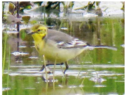
387 Kleine Klapekster / Lesser Grey Shrike Lanius minor , mannetje, Grijpskerk, Groningen, 18 juni 2019 (Kees Bode) 388 Balearische Roodkopklauwier / Balearic Woodchat Shrike Lanius senator badius , tweede-kalenderjaar, Praamweg, Oostvaardersplassen, Flevoland, 14 juni 2019 (Co van der Wardt) 389 Bonte Tapuit / Pied Wheatear Oenanthe pleschanka , mannetje, Noordoosthoek, Vlieland, Friesland, 16 juni 2019 (Durk Lautenbag) 390 Iberische Tjiftjaf / Iberian Chiffchaff Phylloscopus ibericus , Houten, Utrecht, 10 mei 2019 (Julian Bosch) 391 Withalsvliegenvanger / Collared Flycatcher Ficedula albicollis , vrouwtje, Julianadorp, Noord-Holland, 20 mei 2019 (Gerrit Welgraven) 392 Citroenkwikstaart / Citrine Wagtail Motacilla citreola , vrouwtje, Lentevreugd, Wassenaar, Zuid-Holland, 20 mei 2019 (Arjan Portengen)