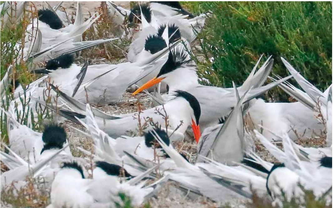
363 Elegant Terns / Sierlijke Sterns Sterna elegans , adults, with Sandwich Terns / Grote Sterns S. sandvicensis , Marjal dels Moros, Valencia, Spain, 25 May 2019 (Massimiliano Dettori)