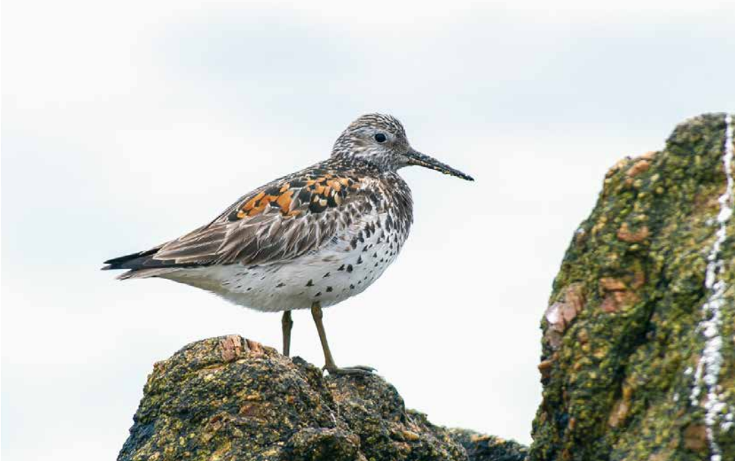
362 Great Knot / Grote Kanoet Calidris tenuirostris , adult, Skaw, Unst, Shetland, Scotland, 31 May 2019 (Rebecca Nason)