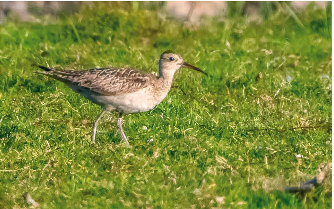
359 Little Curlew / Kleine Regenwulp Numenius minutus , Tofta Kile, Bohuslän, Sweden, 11 July 2019 ( Björn Dellming )