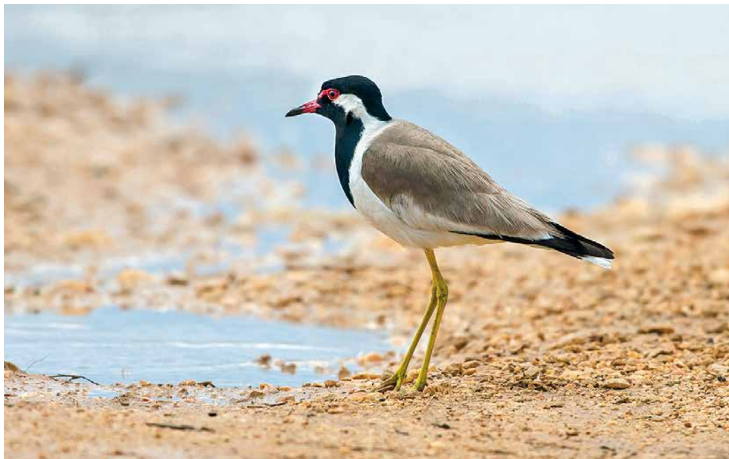
360 Red-wattled Lapwing / Indische Kievit Vanellus indicus , Kolansko Blato, Pag, Croatia, 14 May 2019 (Dejan Grohar)