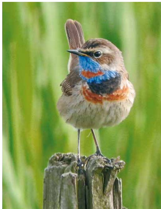
393 Orpheusspotvogel / Melodious Warbler Hippolais polyglotta , Oostkapelle, Zeeland, 15 juni 2019 ( Kris De Rouck ) 394 Roodsterblauwborst / Red-spotted Bluethroat Luscinia svecica svecica , mannetje, Eempolders, Eemnes, Utrecht, 25 mei 2019 ( Jaap Dijkhuizen ) 395 Kleine Vliegenvanger / Red-breasted Flycatcher Ficedula parva , adult mannetje, Hoge Veluwe, Gelderland, 23 juni 2019 ( Alex Bos )