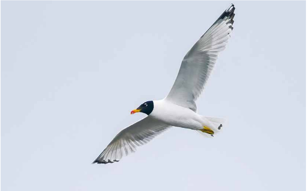
356 Pallas's Gull / Reuzenzwartkopmeeuw Larus ichthyaetus , Lillskärsudden, Västerbotten, Sweden, 25 May 2019 (Per-Olof Erixon)