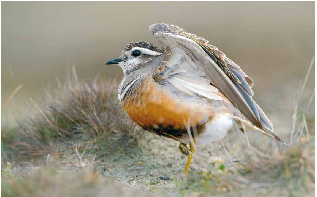
382 Morinelplevier / Eurasian Dotterel Charadrius morinellus , Amsterdamse Waterleidingduinen, Zuid-Holland, 16 mei 2019 (Hans Overduin)