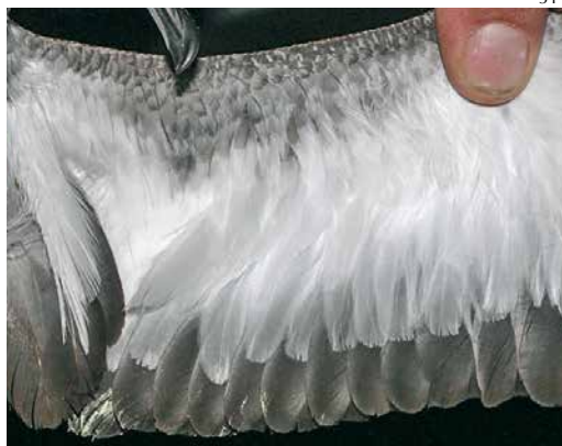
308 Barolo Shearwater / Kleine Pijlstormvogel Puffinus baroli , Selvagem Grande, Selvagens, 19 March 2016 ( Thijs Valkenburg ) 309 Barolo Shearwater / Kleine Pijlstormvogel Puffinus baroli , Selvagem Grande, Selvagens, 31 March 2016 ( Rinse van der Vliet ). Left-hand example (plate 308) is most common variant with medium-sized 'triangle' that is lightly chequered and mid-grey. Right-hand example (plate 309) has fairly large 'triangle' that is reasonably uniform and blackish-grey. 310 Barolo Shearwater / Kleine Pijlstormvogel Puffinus baroli , Selvagem Grande, Selvagens, 31 March 2016 ( Rinse van der Vliet ) 311 Barolo Shearwater / Kleine Pijlstormvogel Puffinus baroli , Selvagem Grande, Selvagens, 28 March 2016 ( Thijs Valkenburg ). All greater secondary coverts in left-hand example (plate 310) have dark subterminal spots, while in right-hand example (plate 311) none have dark spots.

quently makes exaggerated head lifts. In light winds, baroli typically makes rapid stiff wing-beats, from two in less than 1 sec to 10-12 in just over 4 sec, interspersed with short glides lasting from 1 to 3-4 sec (Martin & Rowlands 2001) and often lands on the sea (Curtis et al 1985; pers obs). In moderate to strong winds, baroli makes low ascents, refrains from long sailing glides (Lee 1988), and banks rather than arcs (Martin & Rowlands 2001).