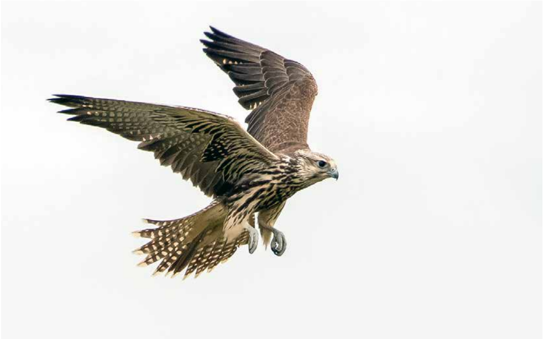
343 Saker Falcon / Sakervalk Falco cherrug , juvenile, Wieringen, Noord-Holland, Netherlands, 20 July 2019 (Maurits Martens)