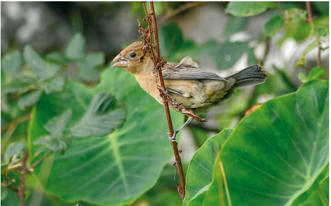
327 Blue Grosbeak / Blauwe Bisschop Passerina caerulea , first-winter, Corvo, Azores, 17 October 2018 (Marcin Sołowiej). Feeding on plant seeds, showing large bill.