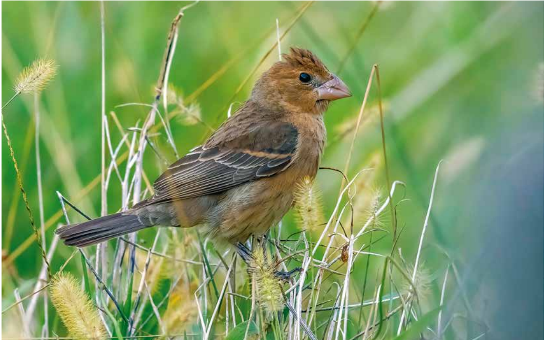
328 Blue Grosbeak / Blauwe Bisschop Passerina caerulea , first-winter, Corvo, Azores, 17 October 2018 (Vincent Legrand). Perched on Canary Grass Phalaris canariensis of which it was fond of eating. Largely juvenile plumage but note two adult type inner greater coverts and two adult type pale-tipped uppertail-coverts. 329 Blue Grosbeak / Blauwe Bisschop Passerina caerulea , first-winter, Corvo, Azores, 17 October 2018 (Vincent Legrand). Showing strong coloration around face.