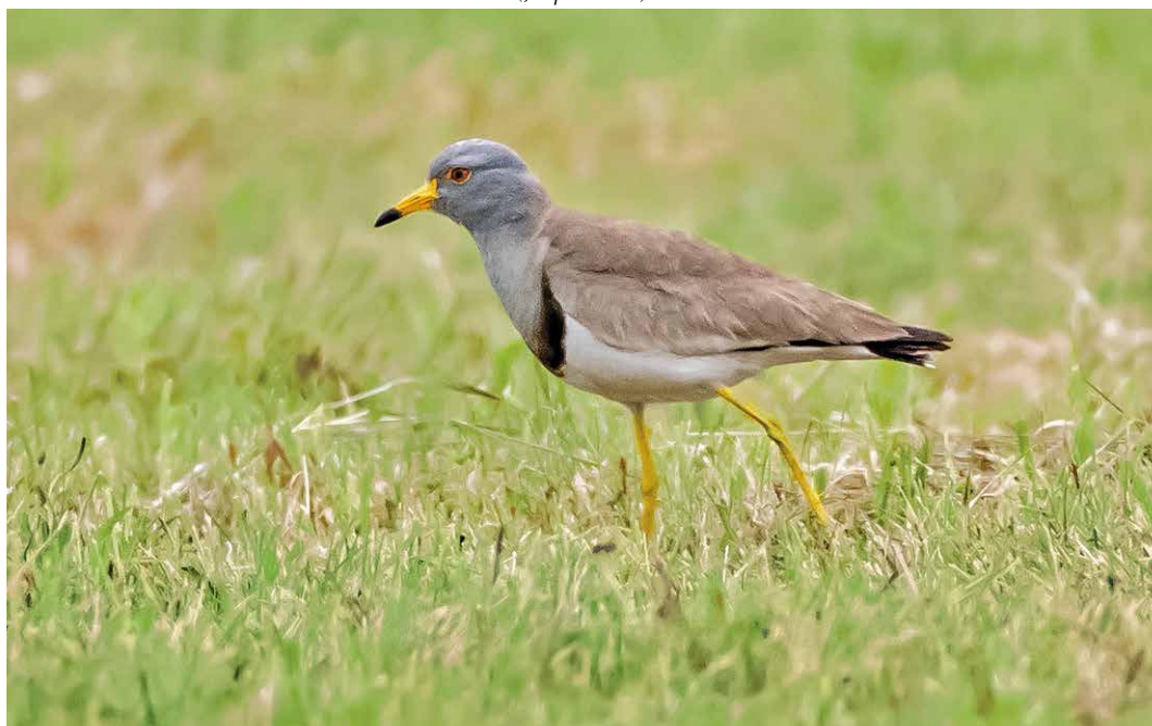
361 Grey-headed Lapwing / Grijskopkievit Vanellus cinereus , Workum, Friesland, Netherlands, 27 June 2019