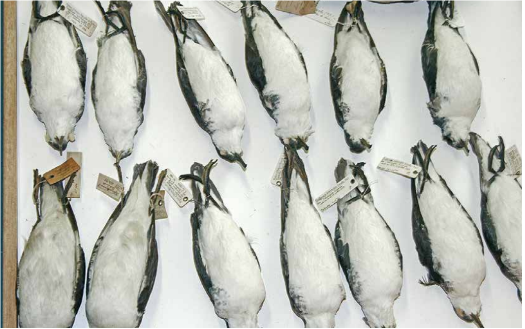
306 Barolo Shearwaters / Kleine Pijlstormvogels Puffinus baroli , Muséum National d'Histoire Naturelle, Paris, France, 12 September 2018 ( Rinse van der Vliet ) 307 Boyd's Shearwaters / Kaapverdise Kleine Pijlstormvogels Puffinus boydi , Muséum National d'Histoire Naturelle, Paris, France, 12 September 2018 ( Rinse van der Vliet ). Despite variation in undertail-covert coloration and pattern discussed in this article, there is fairly high degree of consistency as shown here in trays of museum specimens.