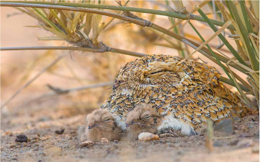
334-335 Golden Nightjars / Goudgele Nachtzwaluwen Caprimulgus eximius , female with two chicks, Oued Chiaf, c 55 km from Aousserd, Western Sahara, Morocco, 19 March 2019