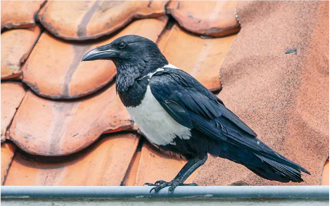
396 Schildraaf / Pied Crow Corvus albus , adult, Leeuwarden, Friesland, 15 juli 2019 (Co van der Wardt)