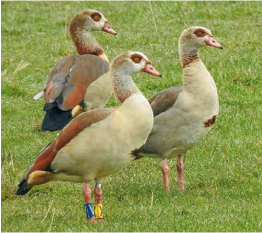
330 Egyptian Geese / Nijlganzen Alopochen aegyptiaca , Saltholme nature reserve, Billingham, Durham, England, 8 April 2018 ( Nicholas Forrest ). In front YXBV, second-calendar year male, hatched mid-May 2017 at Vondelpark, Amsterdam, Noord-Holland, Netherlands, colour-ringed as pullus on 21 July 2017.

female (plate 331). Breeding was confirmed on 1 April 2019 when AM took photographs of YXBV guarding a female breeding on a nest in a bowl in a fork of a large willow Salix (plate 332). The tree was located on a tiny island, and an undated photograph taken by the keeper of the park's café shows that the nest contained seven eggs. AM reported that breeding continued for another two weeks, but that the nest was abandoned on 20 April.