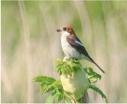
374 Balearic Woodchat Shrike / Balaerische Roodkopkluuwiër Lanius senator badius , second calendar-year, Praamweg, Oostvaardersplassen, Flevoland, Netherlands, 14 June 2019

Stromfirth on 14-15 July. On Fair Isle, a daily record of 16 was counted on 11 July, a higher number than the previous record of 15 in 2008. In Orkney, a group of eight reached Westray on 13 July. Just before the invasion in Scotland, high numbers had turned up along the Norwegian coast as well with, eg, 19 at Svolvær, Nordland, on 8 July; nine on Sklinna, Nord-Trøndelag, on 9 July; and two on Utsira, Rogaland, on 9 July. In Germany, a male was found dead at Friedrichskoog Spitze, Schleswig-Holstein, on 17 July.