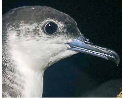
313 Boyd's Shearwater / Kaapverdische Kleine Pijlstormvogel Puffinus boydi , Ilhéus do Rombo, Cape Verde Islands, 9 November 2018 (Jacob González-Solís). Note well-defined two-toned bill.

ence and good views (additional biometrics in appendix 2). Wing and tail measurements on average are slightly shorter for baroli . The wing of baroli is short and broad and the wing-tip can appear clipped and the wing action looks stiff. The wing of boydi is short-medium in length, fairly broad and the wing-tip often appears slightly blunt. The wing action looks more flexible than baroli . In terms of Puffinus shearwaters, on average the tail of baroli is short, while the tail of boydi is on average somewhat longer. Bill measurements of the two species largely overlap.