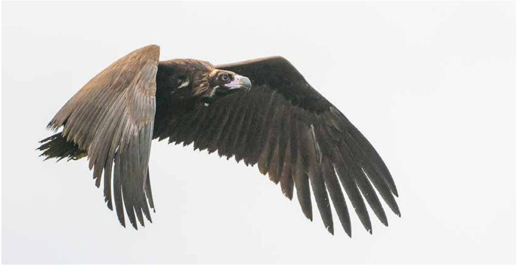
377 Monniksgier / Cinereous Vulture Aegypius monachus , tweede-kalenderjaar, Hellendoorn, Overijssel, 25 mei 2019

op trektelposten en de soort werd in 56 uurhokken gezien. Het hoogste aantal was een groep van acht op 18 mei in de Lauwersmeer, Groningen. In het Zuidlaardermeergebied, Groningen, kwamen opnieuw Witwangsterns Chlidonias hybrida tot broeden; in totaal zijn hier c 35 broedparen geteld. Ook elders in het land doken exemplaren op, waarbij de waarneming van negen kortstondig foeragerende vogels in het Zwanenwater bij Callantsoog, Noord-Holland, het meest in het oog springt. Op 13 mei trokken er twee langs telpost Breskens. Op trektelposten werden zes Witvleugelsterns C leucopterus gezien. Hoewel er veel waarnemingen waren in het Zuidlaardermeergebied, zijn er geen broedgevallen bekend. Het hoogste aantal hier was vijf op 2 4 mei. Maximaal vier vlogen er op 16 en 17 mei in de Brabantse Biesbosch en op 18 mei boven Mariëndal, Den Helder, Noord-Holland. Een Dougalls Stern Sterna dougallii werd op 20 mei gefotografeerd in De Putten bij Camperduin.