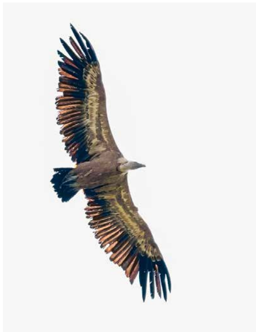
398 Vale Gier / Griffon Vulture Gyps fulvus , Sint-Anthonis, Noord-Brabant, 5 juni 2019 ( Harvey van Diek ) 399 Vale Gier / Griffon Vulture Gyps fulvus , Hoge Veluwe, Gelderland, 10 juni 2019 ( Hans Tetteroo ) 400 Roodkopklauwier / Woodchat Shrike Lanius senator , mannetje, Oostkapelle, Zeeland, 14 juni 2019 ( Hans Tetteroo )