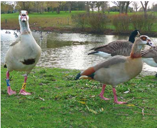
331 Egyptian Geese / Nijlganzen Alopochen aegyptiaca, with Canada Geese / Grote Canadese Ganzen Branta canadensis, Swanley Park, Swanley, Kent, England, 29 November 2018. Left YXBV, male, paired with unringed female, hatched mid-May 2017 at Vondelpark, Amsterdam, Noord-Holland, Netherlands, colour-ringed as pullus on 21 July 2017. 332 Egyptian Goose / Nijlgans Alopochen aegyptiaca, female breeding on nest, Swanley Park, Swanley, Kent, England, 1 April 2019. Partnered with male YXBV (cf plate 331).

Young were not observed and there was no clear cause of the failure of this breeding attempt (the pair was still present on 14 May).