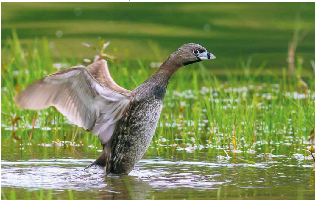
345 Pied-billed Grebe / Dikbekfuut Podilymbus podiceps , adult, Furnas, São Miguel, Azores, 18 June 2019 (Gerbrand Michielsen)