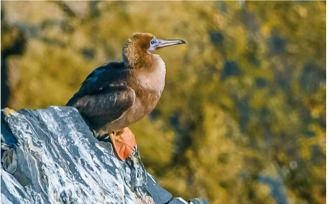
346 Red-footed Booby / Roodpootgent Sula sula , juvenile, Cape Sardão, Odemira, Portugal, 3 June 2019 (Humberto Matos)