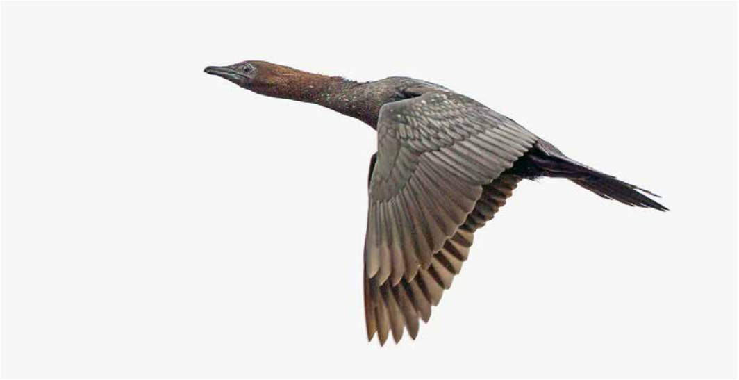
378 Dwergaalscholver / Pygmy Cormorant Microcarbo pygmaeus , Keent, Noord-Brabant, 5 juni 2019