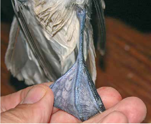
312 Barolo Shearwater / Kleine Pijlstormvogel Puffinus baroli , Selvagem Grande, Selvagens, 6 June 2010 (Frank Zino). Note colours and pattern.