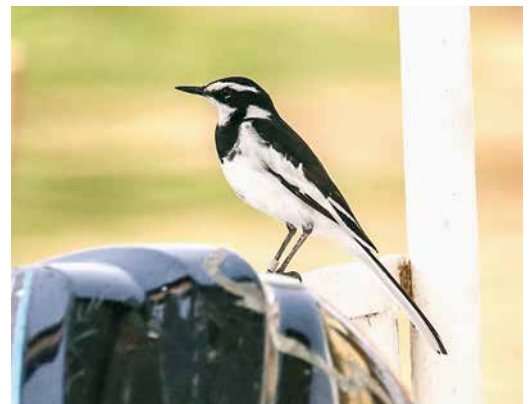
325 African Pied Wagtail / Afrikaanse Bonte Kwikstaart Motacilla aguimp vidua , adult, with 'Helgoland' ring, Port of Aswan, lake Nasser, Egypt, 14 March 2018 (Massimilano Dettori)

According to Keith et al (1992) and del Hoyo et al (2004), the incubation period of African Pied Wagtail is 13-14 days. The young leave the nest after another 15-16 days. This implies that our broods hatched between 9 and 28 April. As a consequence, the beginning of egg laying in these broods took place between 24 March and 10 April. The main period of egg laying at lake Nasser may thus be defined as ranging from March to May. This fits the reports by Shelley (1872), who observed breeding birds near Aswan in April, and Baha el Din (1994), who found a brood near Abu Simbel in early May 1994. Unfortunately, there are no comparative data on the breeding in the