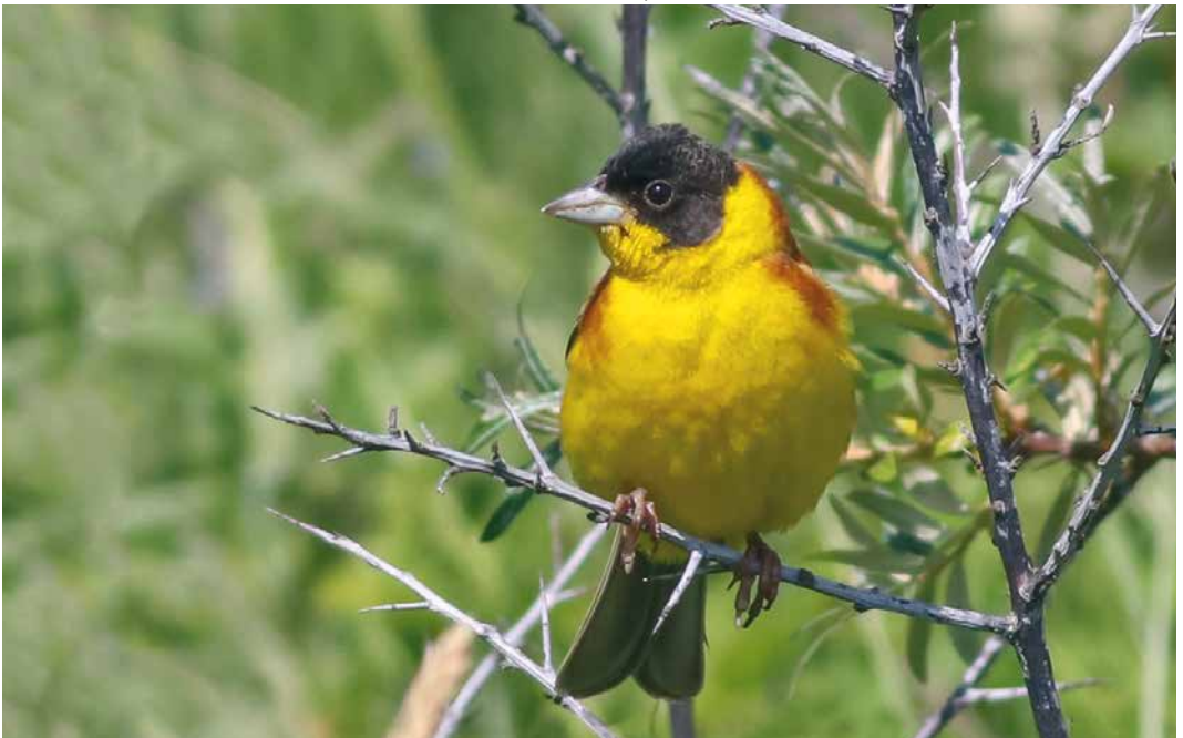
397 Zwartkopgors / Black-headed Bunting Emberiza melanocephala , mannetje, Nes, Ameland, Friesland, 9 juni 2019 (Andries Zijlstra)