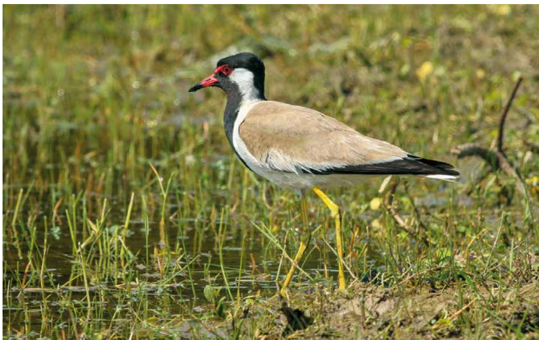
380 Indische Kievit / Red-wattled Lapwing Vanellus indicus , Ameland, Friesland, 23 juni 2019 ( Robert Pater )