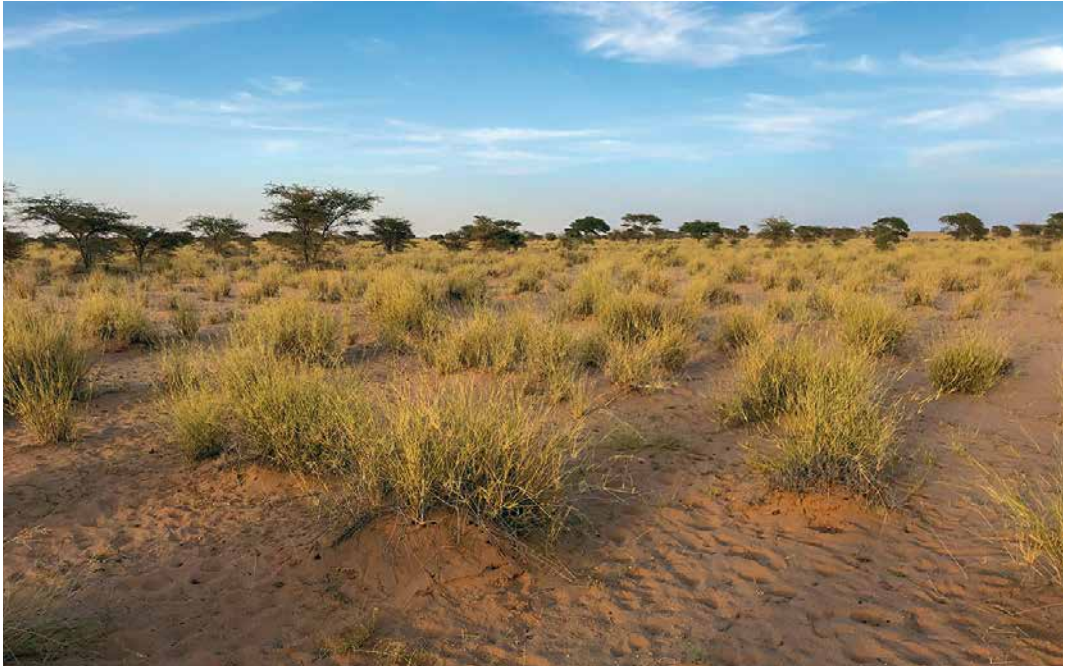
336 Breeding habitat of Golden Nightjar Caprimulgus eximius, Oued Chiaf, c 55 km from Aousserd, Western Sahara, Morocco, 19 March 2019