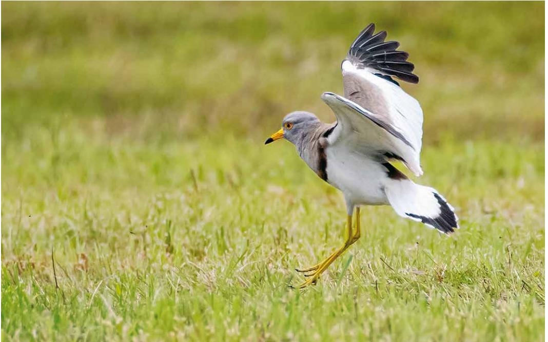
381 Grijskopkievit / Grey-headed Lapwing Vanellus cinereus , Workum, Friesland, 27 juni 2019