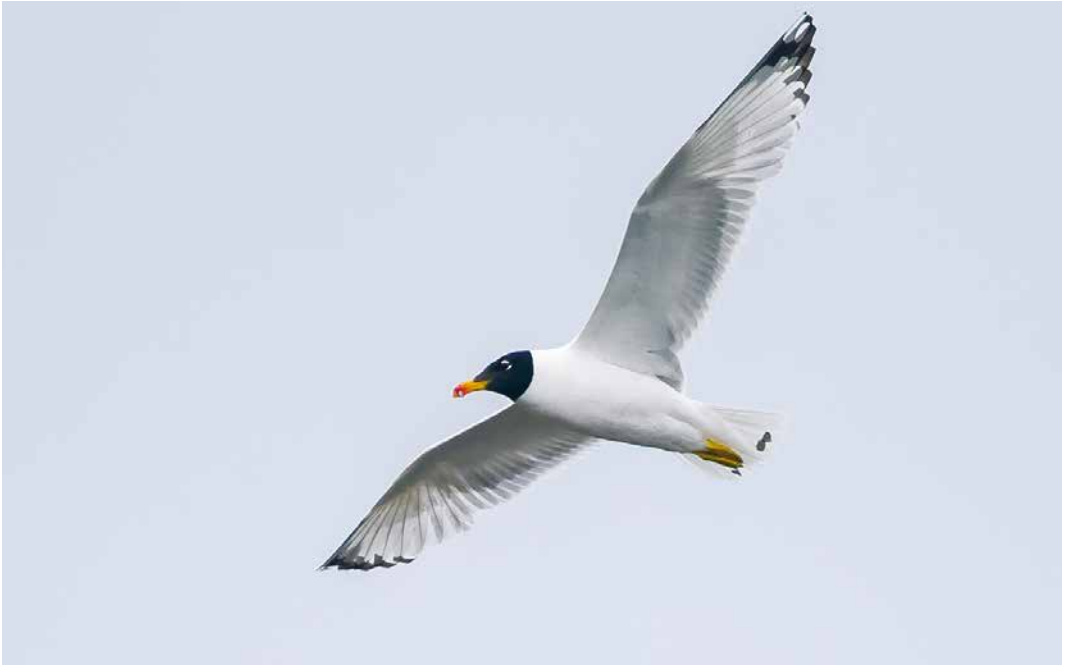
356 Pallas's Gull / Reuzenzwartkopmeeuw Larus ichthyaetus , Lillskärsudden, Västerbotten, Sweden, 25 May 2019 (Per-Olof Erixon)