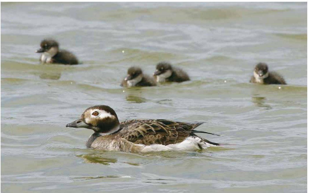
376 Ijseenden / Long-tailed Ducks Clangula hyemalis , vrouwtje met jongen, Marker Wadden, Flevoland, 27 juni 2019