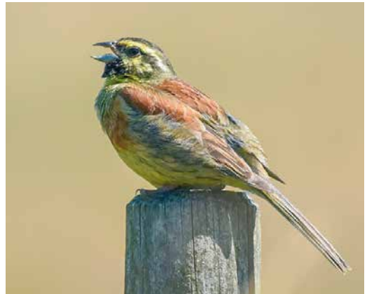
370 Myrtle Warbler / Mirtzanger Setophaga coronata , first-summer male, Ramsey, Pembrokeshire, Wales, 31 May 2019 ( Peter Ramsey ) 371 Black-backed Citrine Wagtail / Zwartrugcitroenkwikstaart Motacilla citreola calcarata , male, Kizil Agach, Azerbaijan, 26 May 2019 ( Olof Strand ) 372 Red-headed Bunting / Bruinkopgors Emberiza bruniceps , male, Halikonlahti, Salo, Finland, 24 June 2019 ( Mika Bruun ) 373 Cirl Bunting / Cirlgors Emberiza cirlus , male, Hirtshals, Nordjylland, Denmark, 11 July 2019 ( Poul Bastholm Nørgaard )

until at least 3 July. Hahn et al (2019) used geolocators to compare the migration patterns of European Bee-eaters Merops apiaster from two established western (Portugal) and eastern (Bulgaria) breeding populations in Europe, with those from a newly founded northern population (Germany). Western birds used the western flyway to winter in West Africa and the eastern birds headed south to southern Africa, demonstrating a complete separation in time and space between both populations. The recently founded northern population used a western corridor on migration but crossed the Mediterranean further east than the western population and overwintered mainly in a (new) winter area in southern Congo and northern Angola ( https://tinyurl.com/y55fw3q3 ). A Blue-cheeked Bee-eater M persicus was seen for 10 minutes on wires at Achnahaird, Highland, Scotland, on 23 June. In England, a European Roller Coracias garrulus rested for two hours aboard a yacht in the Bristol Channel off Devon on