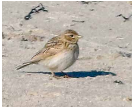
366 Masked Skrike / Maskerklauwier Lanius nubicus , adult female, Lou Bertalan, Tulcea, Romania, 14 May 2019 (Axel Auhagen) 367 Hume's Leaf Warbler / Humes Bladkoning Phylloscopus humei , Ural mountains, west of Severouralsk, Russia, 14 June 2019 (Patric Lorgé) 368 Mourning Dove / Treurduif Zenaida macroura , Ventlinge, Öland, Sweden, 21 May 2019 (Bengt Svensson) cf Dutch Birding 41: 186, 2019 369 Lesser Short-toed Lark / Kleine Kortteenleeuwerik Alaudala rufescens , Hel, Pomerania, Poland, 30 May 2019 (Wojciech Janecki Jr)

Eastern Imperial Eagle A heliaca at Randowbruch, Brandenburg, from 29 May to 24 June was (only) the first twitchable for Germany since 25 years. In north-eastern Groningen, the Netherlands, Pallid Harriers Circus macrourus successfully raised six young in June at the same site as where the species bred for the first time in 2017 (in 2018, an unsuccessful breeding attempt took place at that site between the same female Pallid and a male Montagu's Harrier C pygargus ). This spring, a female young that fledged here in 2017, wearing a black ring with C3 inscription, was nesting with a male Pallid in northern Spain, constituting the country's first documented breeding of this species. In north-eastern Germany, 137 White-tailed Eagles were found dead as wind turbine victims in 2003-14; Heuck et al showed a relation between the density of wind turbines and the number of eagle collisions (Biol Conserv 236: 44-51, 2019). At Poltva, Ukraine, a mixed pair of a female Black Kite Milvus