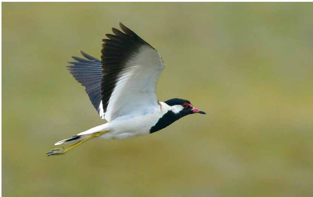
379 Indische Kievit / Red-wattled Lapwing Vanellus indicus , De Tuintjes, De Cocksdorp, Texel, Noord-Holland, 19 juni 2019 ( Arnoud B van den Berg )