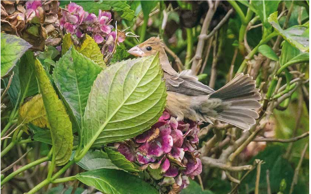
326 Blue Grosbeak / Blauwe Bisschop Passerina caerulea , first-winter, Corvo, Azores, 17 October 2018 (Peter Stronach). Initial view as it briefly perched in Hydrangea hedge.