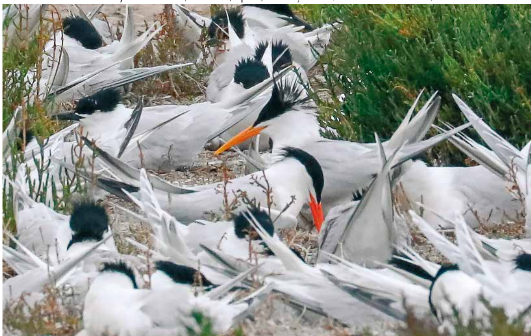
363 Elegant Terns / Sierlijke Sterns Sterna elegans , adults, with Sandwich Terns / Grote Sterns S. sandvicensis , Marjal dels Moros, Valencia, Spain, 25 May 2019