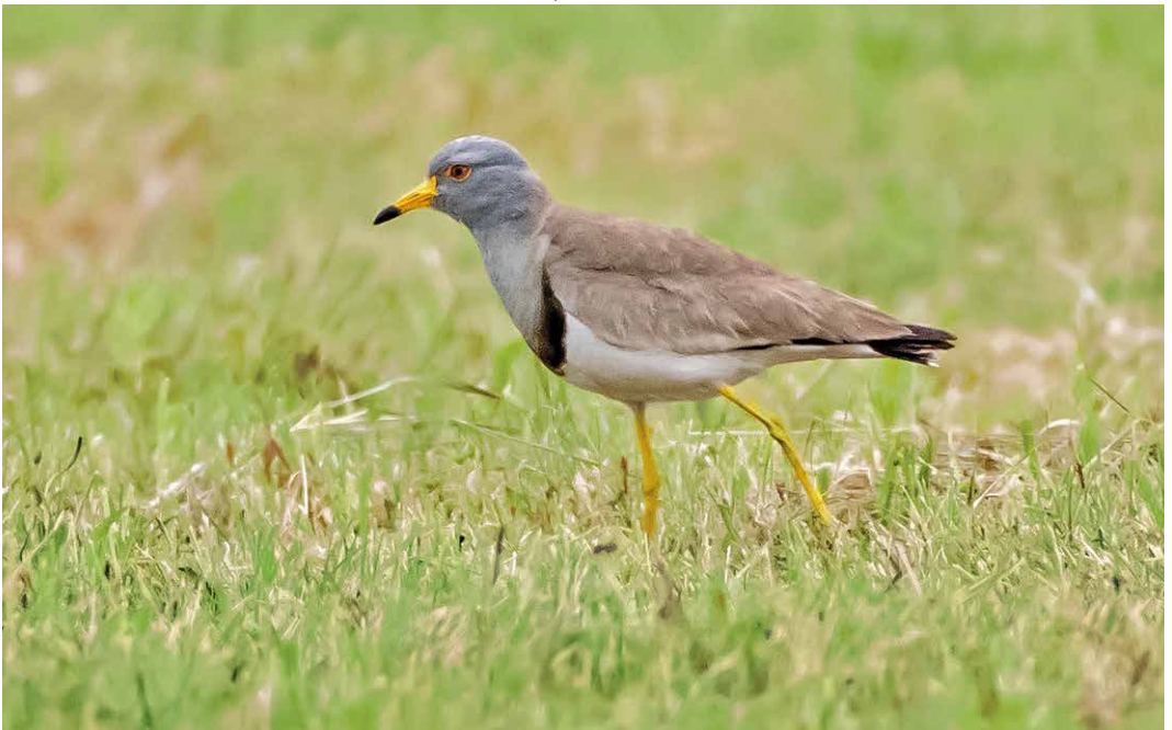
361 Grey-headed Lapwing / Grijskopkievit Vanellus cinereus , Workum, Friesland, Netherlands, 27 June 2019