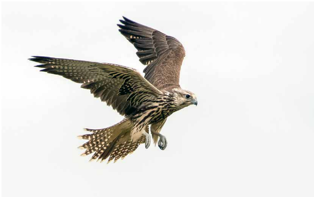
343 Saker Falcon / Sakervalk Falco cherrug , juvenile, Wieringen, Noord-Holland, Netherlands, 20 July 2019