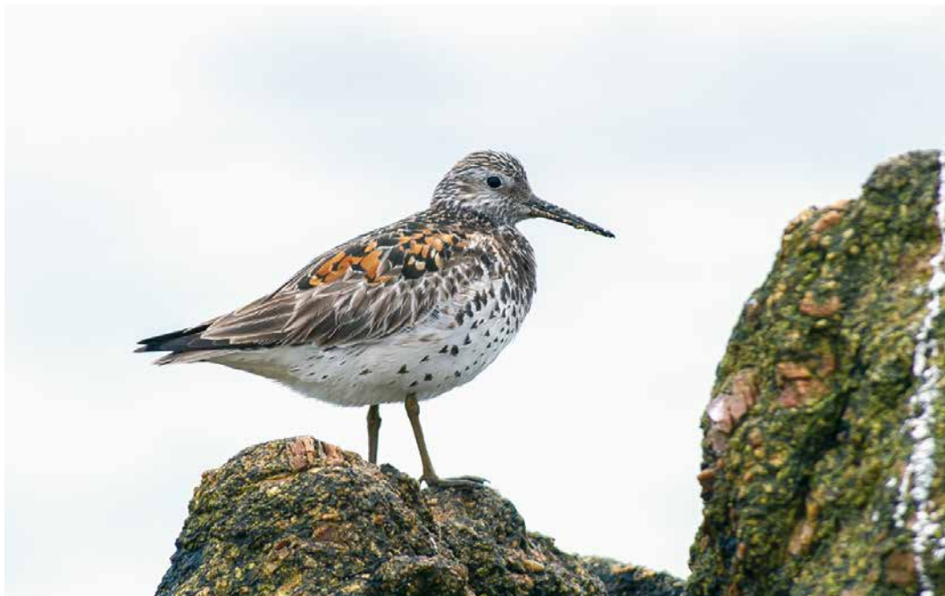
362 Great Knot / Grote Kanoet Calidris tenuirostris , adult, Skaw, Unst, Shetland, Scotland, 31 May 2019