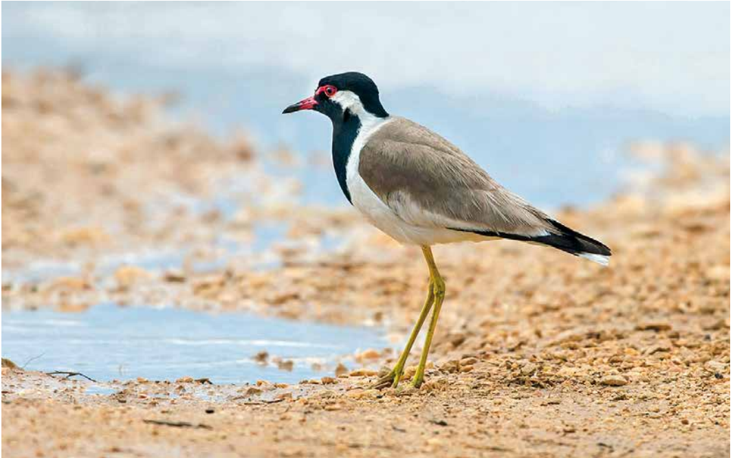
360 Red-wattled Lapwing / Indische Kievit Vanellus indicus , Kolansko Blato, Pag, Croatia, 14 May 2019 (Dejan Grohar)