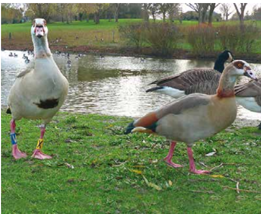
331 Egyptian Geese / Nijlganzen Alopochen aegyptiaca, with Canada Geese / Grote Canadese Ganzen Branta canadensis, Swanley Park, Swanley, Kent, England, 29 November 2018. Left YXBV, male, paired with unringed female, hatched mid-May 2017 at Vondelpark, Amsterdam, Noord-Holland, Netherlands, colour-ringed as pullus on 21 July 2017. 332 Egyptian Goose / Nijlgans Alopochen aegyptiaca, female breeding on nest, Swanley Park, Swanley, Kent, England, 1 April 2019. Partnered with male YXBV (cf plate 331).

Young were not observed and there was no clear cause of the failure of this breeding attempt (the pair was still present on 14 May).