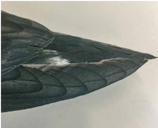
277 Barolo Shearwater / Kleine Pijlstormvogel Puffinus baroli , off Madeira, 6 August 2012 278 Barolo Shearwater / Kleine Pijlstormvogel Puffinus baroli , off Graciosa, Azores, 17 August 2014. Bird in plate 278 shows grey 'bloom' covering dorsal surface of larger upperwing-coverts and remiges, as well as scapulars, nape to uppertail-coverts, and rectrices. Bird in plate 277 shows effect of shiny nature of this bloom with contrasting pale panels in inner wings and outer left wing. 279 Barolo Shearwater / Kleine Pijlstormvogel Puffinus baroli , 'female bird of the year' (collected 4 June 1913 by D A Bannerman, Montaña Clara, Canary Islands), Natural History Museum, Tring, England, 5 April 2019. Grey 'bloom' is apparent over entirety of these fresh feathers, except for matt fringes and shafts.

of 12 non-juveniles at sea in August showed prominent or fairly conspicuous white pencil lines across both median and greater secondary coverts (plate 282). Just two September birds were scored and, somewhat surprisingly, both showed heavy wear to tips of the median and greater secondary coverts, perhaps being older immatures or failed breeders that moulted earlier than successful breeding adults.