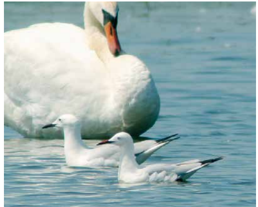
348 Audouin's Gull / Audouins Meeuw Larus audouinii , third calendar-year, Toruń, Kujawsko-Pomorskie, Poland, 15 June 2019 349 South Polar Skua / Zuidpooljager Stercorarius maccormicki , at sea c 200 km south of Mizen Head, Cork, Ireland, 22 June 2019 350 Cape Gull / Kelpmeeuw Larus dominicanus vetula , adult, Lea estuary, Lekeitio, Bizkaia, Spain, 6 June 2019 351 Slender-billed Gulls / Dunbekmeeuwen Chroicocephalus genei , adults, with Mute Swan / Knobbelzwaan Cygnus olor , Bugaj, Małopolska, Poland, 11 June 2019

France, at least eight more were heard. In Iran, a White-breasted Waterhen Amaurornis phoenicurus was photographed at Minab, Hormozgan, on 16 April. Male Little Bustards Tetrax tetrax were seen at Hiivaniemi, Lappeenranta, Finland, on 4 June and at Slimbridge, Gloucestershire, England, on 23-26 June. Aerial surveys using high-resolution digital video resulted in a record 22 280 Red-throated Loons Gavia stellata at Outer Thames estuary, England, in February 2018 ( Br Birds 112: 349-357, 2019). In Norway, a total of 84 Yellow-billed Loons G. adamsii flew past Slettnes, Finnmark, on 13 May.