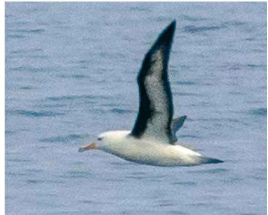
352 Crested Honey Buzzard / Aziatische Wespendiff Pernis ptilorhynchus , female, Masalli, Azerbaijan, 23 May 2019 353 Grey-headed Lapwing / Grijskopkievit Vanellus cinereus , Strandvik, Värmland, Sweden, 14 May 2019 354 Trindade Petrel / Arminjons Stormvogel Pterodroma arminjoniana , pale morph, c 3 km south of Pico, Azores, 26 May 2019 355 Black-browed Albatross / Wenkbrauwalbatros Thalassarche melanophris , immature, Garðskagi lighthouse, Iceland, 12 June 2019

high walls, supposedly attracting other individuals into the death trap by calling; 15% of the corpses had rings which revealed that most must have been subadults (Scott Birds 39: 132-135, 2019). A pale-morph Trindade Petrel Pterodroma arminjoniana was photographed c 3 km south of Pico, Azores, on 26 May. On Montaña Clara islet near Lanzarote, Canary Islands, a Cape Verde Shearwater Calonectris edwardsii was again trapped on 9 July (the first on this islet was trapped on 6 June 2010 and then the species was found here, eg, on 22 July 2016; Dutch Birding 32: 266, 2010, 38: 398, 2016); this time, however, the bird not only had a brood patch but also went into an inaccessible burrow when released. On Lundy, England, the breeding population of Manx Shearwater Puffinus puffinus increased from 297 pairs in 2001 to 5504 in 2017-18, in response to the eradication of rats from the island in the winters of 2002/03 and 2003/04 (Br Birds 112: 217-230, 2019).