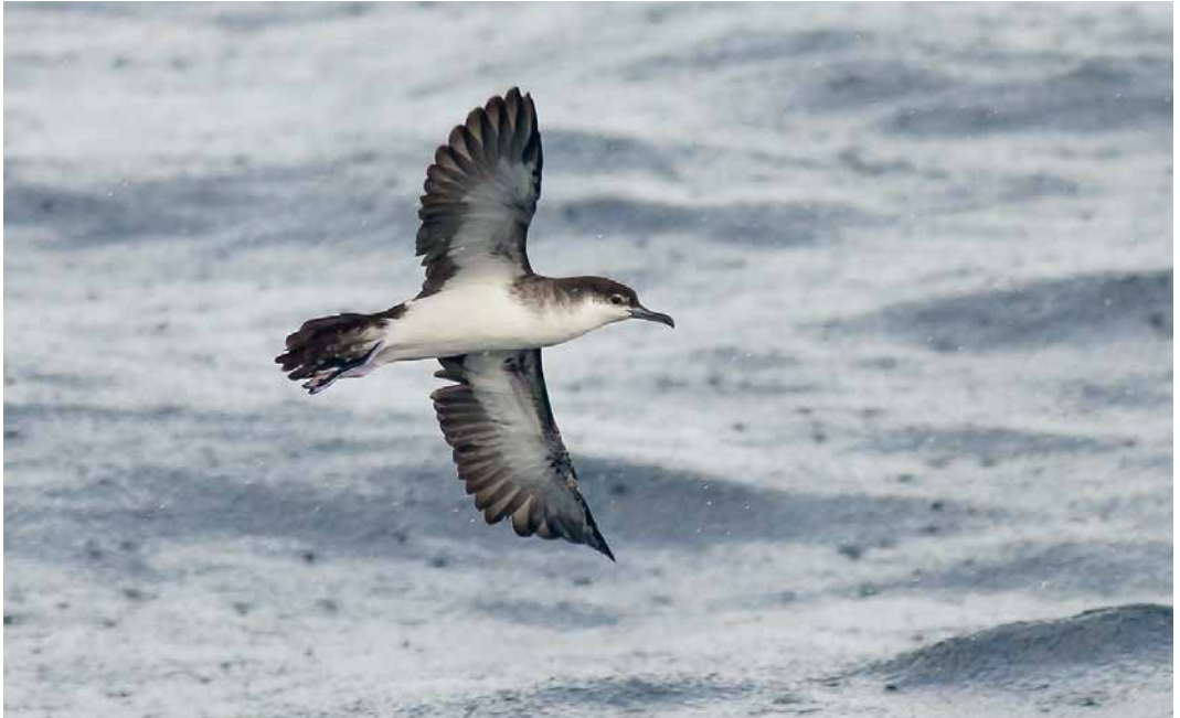
211 Audubon's Shearwater / Audubons Pijlstormvogel Puffinus lherminieri , Hatteras, North Carolina, USA, 25 August 2018 212 Audubon's Shearwater / Audubons Pijlstormvogel Puffinus lherminieri , Hatteras, North Carolina, USA, 28 May 2018. Head pattern of both birds similar to Skagerrak Audubon's (plate 208). 'Saddlebags' are variable in Audubon's and are absent in Skagerrak shearwater and Audubon's in plate 212. Feet and legs are lowered in plate 211, revealing more extensive dark in undertail-coverts compared with Skagerrak shearwater but this difference is not unusual. Note relatively long tail.