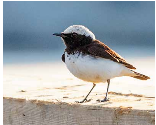
268 Eastern Imperial Eagle / Keizerarend Aquila heliaca , subadult, Heule, Kortrijk, West-Vlaanderen, Belgium, 12 April 2020 ( Bart Augustijns ) 269 Bay-backed Shrike / Bruinrugklauwier Lanius vittatus , male, Buri, Bahrain, 18 April 2020 ( Howard King ) 270 Greater Short-toed Lark / Kortteenleeuwerik Calandrella brachydactyla , Riva, Paviļosta, Latvia, 24 April 2020 ( Kaspars Funts ) 271 Pied Wheatear / Bonte Tapuit Oenanthe pleschanka , second calendar-year male, Weiden am See, Burgenland, Austria, 26 April 2020 ( Leander Khil )

well north of their previous wintering range, at new wintering areas along the coasts of the Arabian Gulf. Currently, the global population is estimated at c 24 000 individuals; illegal hunting along the western flyway was identified as the most plausible cause of the species' decline ( https://tinyurl.com/yaorn252 ). In Uzbekistan, as many as 4685 were counted at Talimarzhan reservoir on 26 September 2019 ( Sandgrouse 42: 162-184, 2020). The first Oriental Plover Anarhynchus veredus for Laos was seen at Vientiane on 13 April. A Mongolian Sand Plover A mongolus at Reesholm, Schleswig-Holstein, on 8-9 May was the first for Germany. If accepted, a Eurasian Whimbrel Numenius phaeopus photographed at Cayenne on 28 April may be the first for French Guiana. A Eurasian Curlew N arquata found on the western shore of Punta Rasa, San Clemente del Tuyú, Buenos Aires, on 27-28 January 2010 was the first for Argentina and South America ( Cotinga 41: 41-43, 2019). The third Stilt Sand-