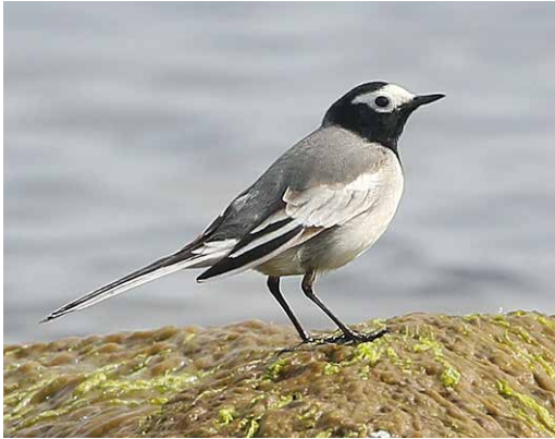
284 Masked Wagtail / Maskerkwikstaart Motacilla personata , second calendar-year male, Hälleviks kås, Stenshuvud, Skåne, Sweden, 12 April 2020

stayed at Drongen, Oost-Vlaanderen, from 24 March to 6 April. An Olive-backed Pipit A hodgsoni found as a window victim on Vágar on 1 May was the sixth for the Faeroes.