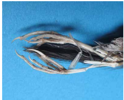
226-228 Lanceolated Warbler / Kleine Sprinkhaanzanger Locustella lanceolata (found on Hornøya, Svalbard, on 8 August 2018), Bennekom, Gelderland, Netherlands, 8 January 2019 (Kees H T Schreven)