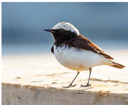
268 Eastern Imperial Eagle / Keizerarend Aquila heliaca , subadult, Heule, Kortrijk, West-Vlaanderen, Belgium, 12 April 2020 269 Bay-backed Shrike / Bruinrugklauwier Lanius vittatus , male, Buri, Bahrain, 18 April 2020 270 Greater Short-toed Lark / Kortteenleeuwerik Calandrella brachydactyla , Riva, Paviosta, Latvia, 24 April 2020 271 Pied Wheatear / Bonte Tapuit Oenanthe pleschanka , second calendar-year male, Weiden am See, Burgenland, Austria, 26 April 2020

well north of their previous wintering range, at new wintering areas along the coasts of the Arabian Gulf. Currently, the global population is estimated at c 24 000 individuals; illegal hunting along the western flyway was identified as the most plausible cause of the species' decline ( https://tinyurl.com/yaorn252 ). In Uzbekistan, as many as 4685 were counted at Talimarzhan reservoir on 26 September 2019 ( Sandgrouse 42: 162-184, 2020). The first Oriental Plover Anarhynchus veredus for Laos was seen at Vientiane on 13 April. A Mongolian Sand Plover A mongolus at Reesholm, Schleswig-Holstein, on 8-9 May was the first for Germany. If accepted, a Eurasian Whimbrel Numenius phaeopus photographed at Cayenne on 28 April may be the first for French Guiana. A Eurasian Curlew N arquata found on the western shore of Punta Rasa, San Clemente del Tuyú, Buenos Aires, on 27-28 January 2010 was the first for Argentina and South America ( Cotinga 41: 41-43, 2019). The third Stilt Sand-