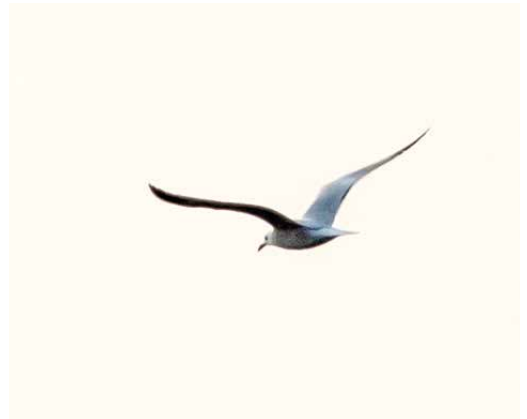
241-244 Audouins Meeuw / Audouin's Gull Larus audouinii , derde-kalenderjaar, Kanaalpark, 's-Hertogenbosch, Noord-Brabant, 18 april 2019

36 broedparen. De populatie in Catalunya daalde de afgelopen jaren sterk in omvang, van 10 000-16 000 paar in 2000-11 tot minder dan 4000 in 2015-18 maar in dezelfde periode ontstonden wel nieuwe kolonies op andere locaties (Gutiérrez & Guinart 2008, BirdLife International 2019, Burger et al 2020).