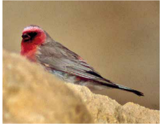
254 Pale Rosefinch / Bleke Roodmus Carpodacus stoliczkae salimalii , male, Pusht-e Jey, Ajar, Bamiyan, Afghanistan, 6 June 2008