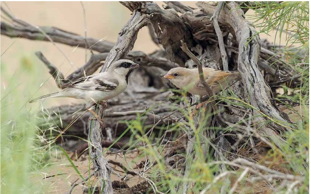
250 Zarudny's Sparrows / Aziatische Woestijnmussen Passer zarudnyi , male feeding juvenile, south of Turkmenabat, Turkmenistan, 3 June 2019