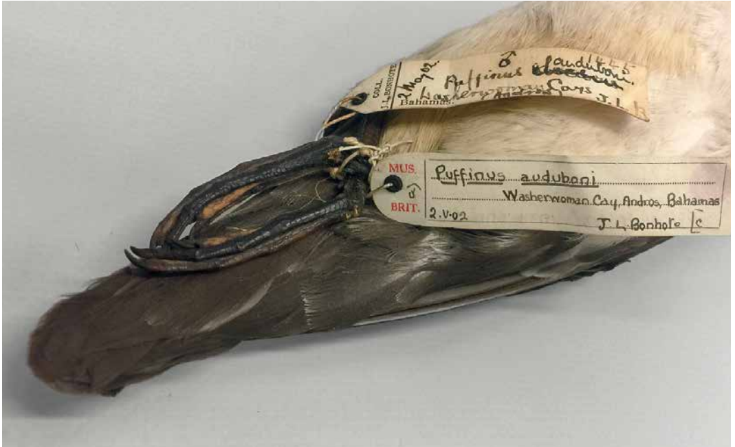
213 Audubon's Shearwater / Audubons Pijlstormvogel Puffinus lherminieri , male (collected by J L Bonhote at Washerwoman Cay, Andros, Bahamas, on 12 May 1902), Natural History Museum, Tring, England, 17 May 2019 ( Robert L Flood ) 214 Audubon's Shearwater / Audubons Pijlstormvogel Puffinus lherminieri , female (from collection of G S Miller Jr; collected at Green Key, Bahamas, on 4 April 1889), Natural History Museum, Tring, England, 17 May 2019 ( Robert L Flood ). Plates show extremes of dark in undertail-coverts: in plate 213 fully dark, in plate 214 only longest undertail-coverts are dark as Skagerrak Audubon's.