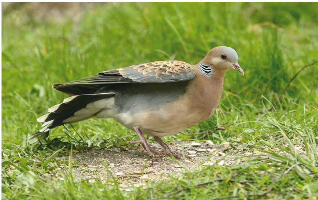
286 Meenatortel / Rufous Turtle Dove Streptopelia orientalis meena , Alkmaar, Noord-Holland, 20 februari 2020 (Ruud E Brouwer)