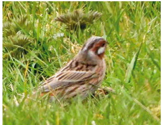
298 Franklins Meeuw / Franklin's Gull Larus pipixcan , derde-kalenderjaar, Benthuizen, Zuid-Holland, 16 maart 2020 299 Kokardezaagbek / Hooded Merganser Lophodytes cucullatus , adult mannetje, Ameide, Utrecht, 30 maart 2020 300 Zwartkeellijster / Black-throated Thrush Turdus atrogularis , tweede-kalenderjaar vrouwtje, Utrecht-Hoograven, Utrecht, 2 april 2020 301 Witkopgors / Pine Bunting Emberiza leucocephalos , mannetje, Zeddum, Gelderland, 30 maart 2020

naar west vliegend bij Vlissingen. De eerste Slangenarend Circus gallicus van het jaar werd op 9 en 10 april gezien boven het Deelensche Veld op de Hoge Veluwe, Gelderland. Op 12 april was er een waarneming bij De Haar, Drenthe; op 24 april trok een exemplaar over telpost De Hamert, Limburg; op 25 april was er één in het Dwingelderveld, Drenthe; en op 29 april in het Fochteloërveen, Friesland. Al op 17 april vlogen twee Vale Gieren Cypselurus fulvus over Almere, Flevoland. Naast enkele meldingen van mogelijke Dwergarenden Aquila pennata zonder documentatie werd een exemplaar gefotografeerd boven Haarlem, Noord-Holland, op 21 april. Misschien wel hét ornithologische hoogtepunt van deze periode waren de twee tweede-kalenderjaar Havikarenden A. fasciata die ons land doorkruisten. Ze waren als nestjong in 2019 op twee nesten in Zuidoost-Frankrijk geringd en gezenderd. De eerste bleek compleet onopgemerkt door het land te zijn gevlogen en hing eind maart enkele dagen rond in Friesland. Daarna is hij, via zowel België als