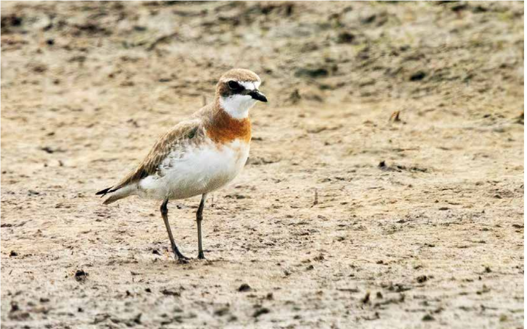
260 Mongolian Sand Plover / Mongoolse Plevier Anarhynchus mongolus , female, Reesholm, Schleswig-Holstein, Germany, 9 May 2020