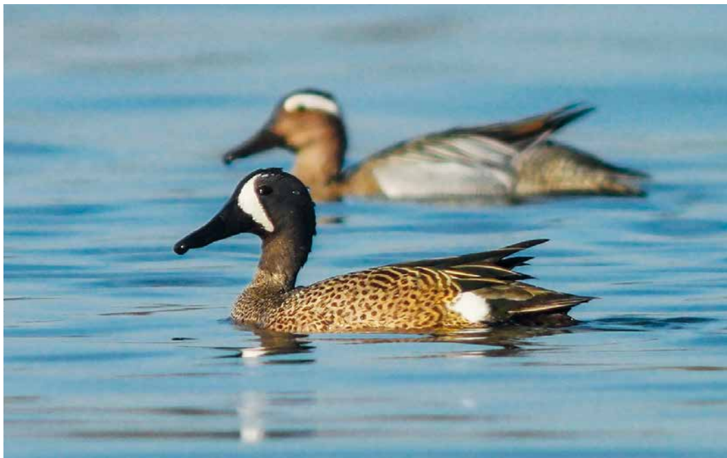
257 Blue-winged Teal / Blauwvleugeltaling Spatula discors , male, with Garganey / Zomertaling S querquedula , male, Kotvice, Studénka, Czechia, 18 April 2020 (Jan Studecký)