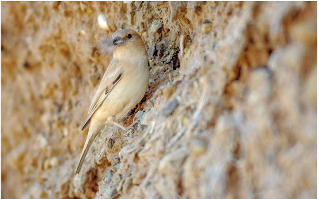
252 Desert Sparrow / Woestijnmus Passer simplex , female, Merzouga, Morocco, 26 March 2008