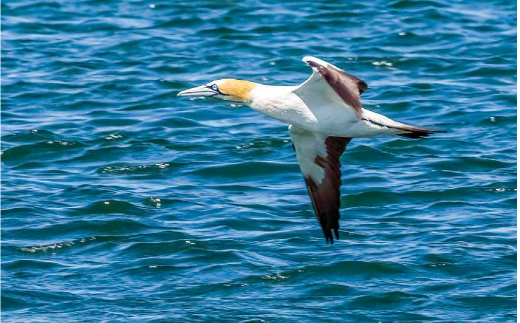
233-234 Cape Gannet / Kaapse Jan-van-gent Morus capensis , between Flores and Corvo, Azores, 14 April 2016 (Carlos Mendes)