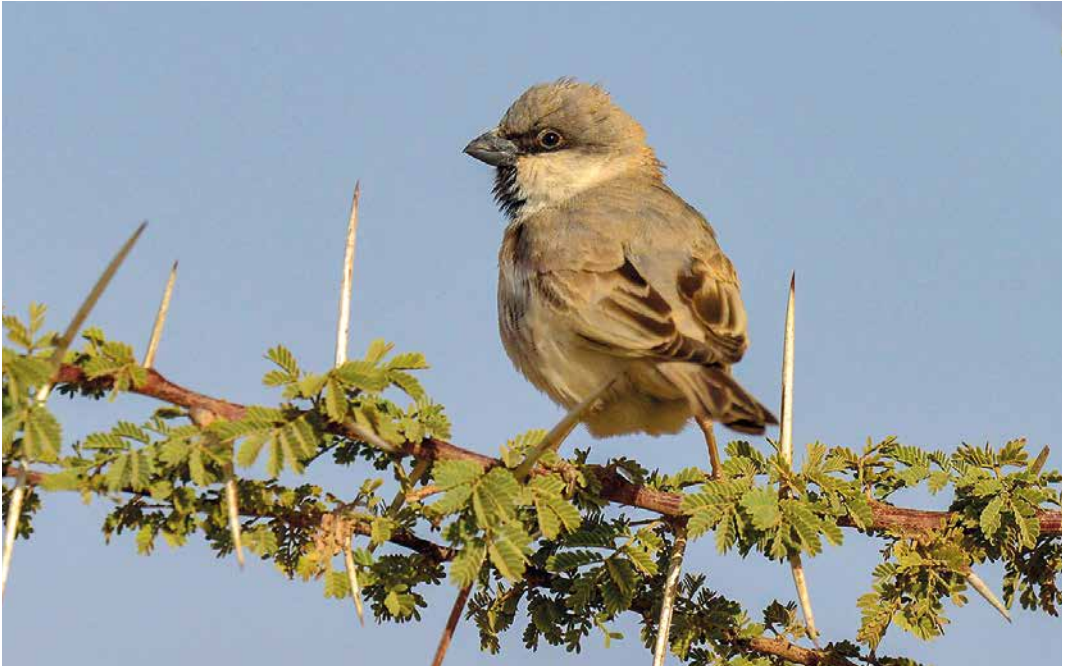
251 Desert Sparrow / Woestijnmus Passer simplex , male, Aousserd, Western Sahara, Morocco, 15 December 2017