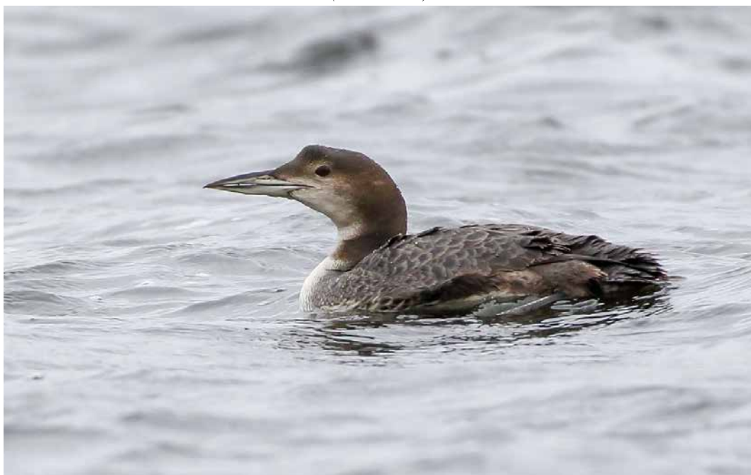
287 Ijsduiker / Common Loon Gavia immer , eerste-winter, Amsterdam, Noord-Holland, 18 maart 2020 (William Price)