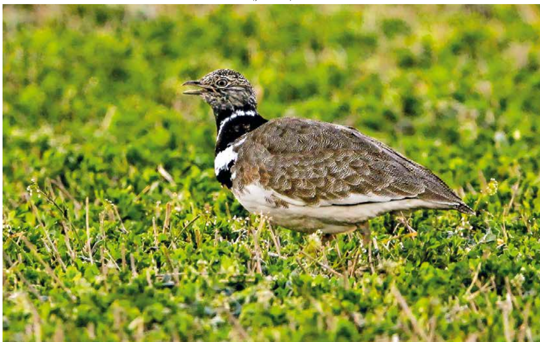
258 Little Bustard / Kleine Trap Tetrax tetrax , adult male, Lešná, Vsetin, Czechia, 22 March 2020 (Jiří Kött)