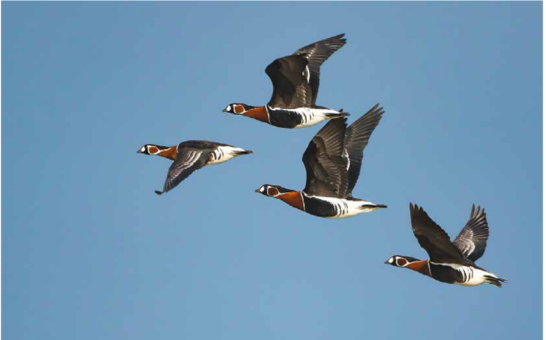
288 Roodhalsganzen / Red-breasted Geese Branta ruficollis , Paesens, Friesland, 13 maart 2020