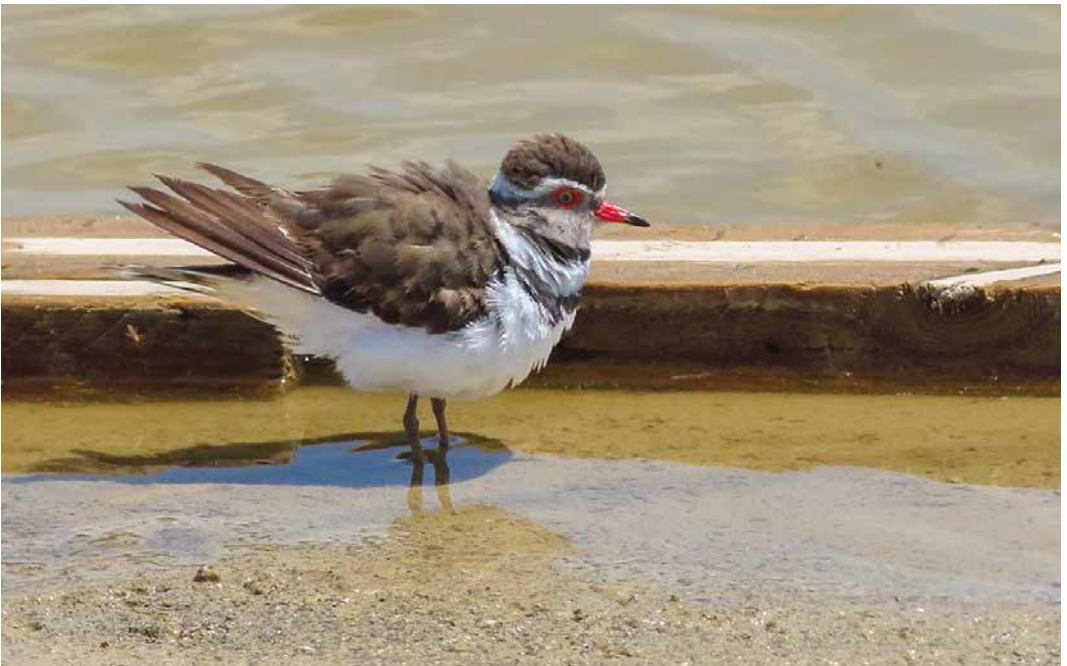
261 Three-banded Plover / Driebandplevier Charadrius tricollaris , adult, Ma'ayan Tzvi, Israel, 12 April 2020 ( Shachar Alterman )