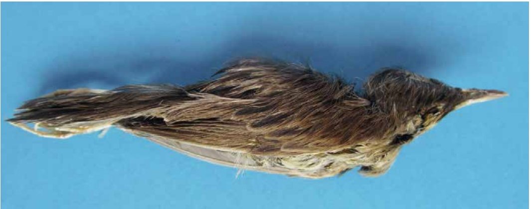
223 View on south-eastern coastline of Hornøya, Svalbard, 8 August 2018 (Kees H T Schreven) 224-225 Lanceolated Warbler / Kleine Sprinkhaanzanger Locustella lanceolata (found on Hornøya, Svalbard, on 8 August 2018), Bennekom, Gelderland, Netherlands, 8 January 2019 (Kees H T Schreven)