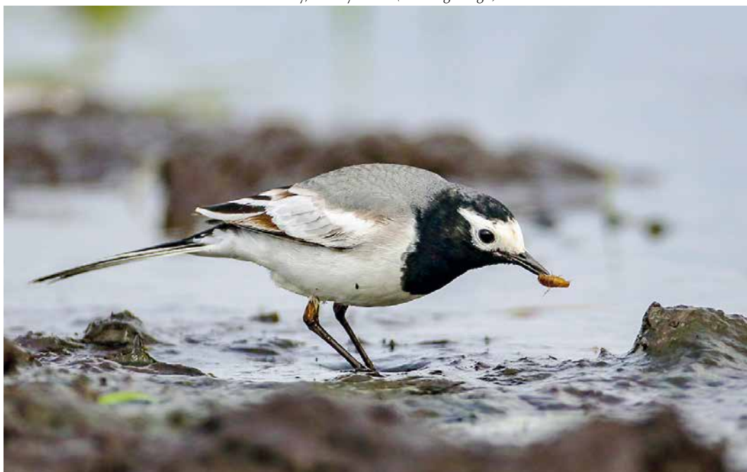
281 Masked Wagtail / Maskerkwikstaart Motacilla personata , second calendar-year male, Utsira, Rogaland, Norway, 2 May 2020 ( Torborg Berge )