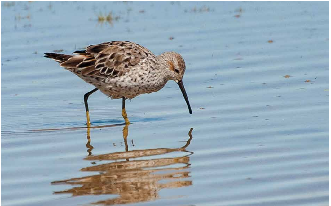
263 Stilt Sandpiper / Steltstrandloper Calidris himantopus , first-summer, Buda island, Ebro delta, Tarragona, Spain, 13 April 2020 (David Bigas)