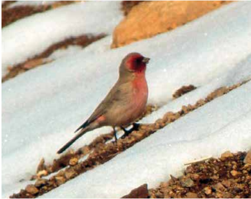
253 Pale Rosefinch / Bleke Roodmus Carpodacus stoliczkae salimalii , male, Sowghdar valley near Bamiyan, Bamiyan, Afghanistan, 11 December 2006. Photographs of this taxon have been rarely published.