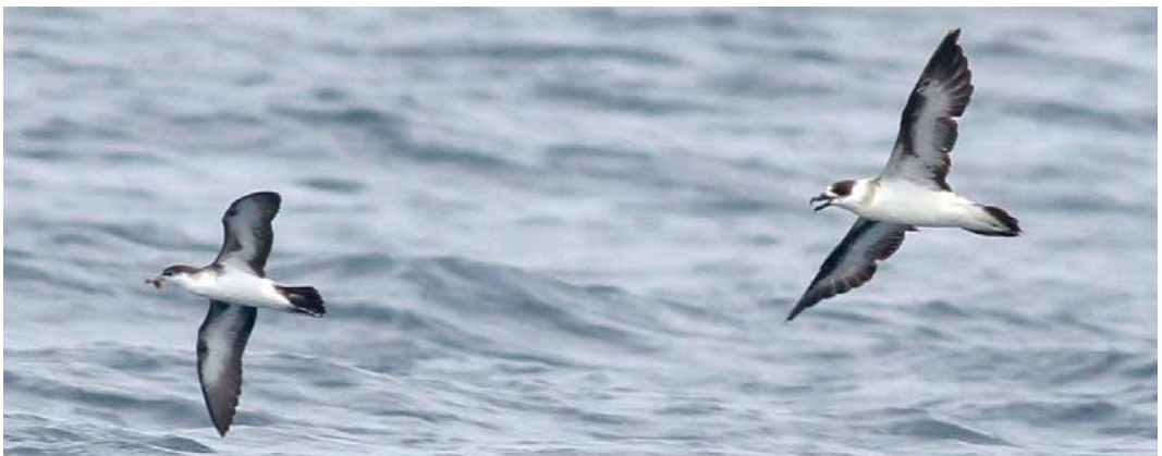
229 Black-capped Petrel / Zwartkapstormvogel Pterodroma hasitata , flying at c 50 m above water surface in pursuit of Red-billed Tropicbird / Roodsnavelkeerringvogel Phaethon aethereus , off Raso, Cape Verde Islands, 6 February 2020 ( Peter Stronach ) 230 Black-capped Petrel / Zwartkapstormvogel Pterodroma hasitata , flying close to cliffs in pursuit of Red-billed Tropicbird / Roodsnavelkeerringvogel Phaethon aethereus , off Raso, Cape Verde Islands, 6 February 2020 ( Peter Stronach ) 231 Black-capped Petrel / Zwartkapstormvogel Pterodroma hasitata , closing in on Red-billed Tropicbird / Roodsnavelkeerringvogel Phaethon aethereus , off Raso, Cape Verde Islands, 6 February 2020 ( Peter Stronach ). Petrel's bill was open but no vocalisation heard. 232 Black-capped Petrel / Zwartkapstormvogel Pterodroma hasitata at chum slick, chasing Audubon's Shearwater / Audubons Pijlstormvogel Puffinus lherminieri with food, off Cape Hatteras, North Carolina, USA, 7 August 2015 ( Peter Flood )