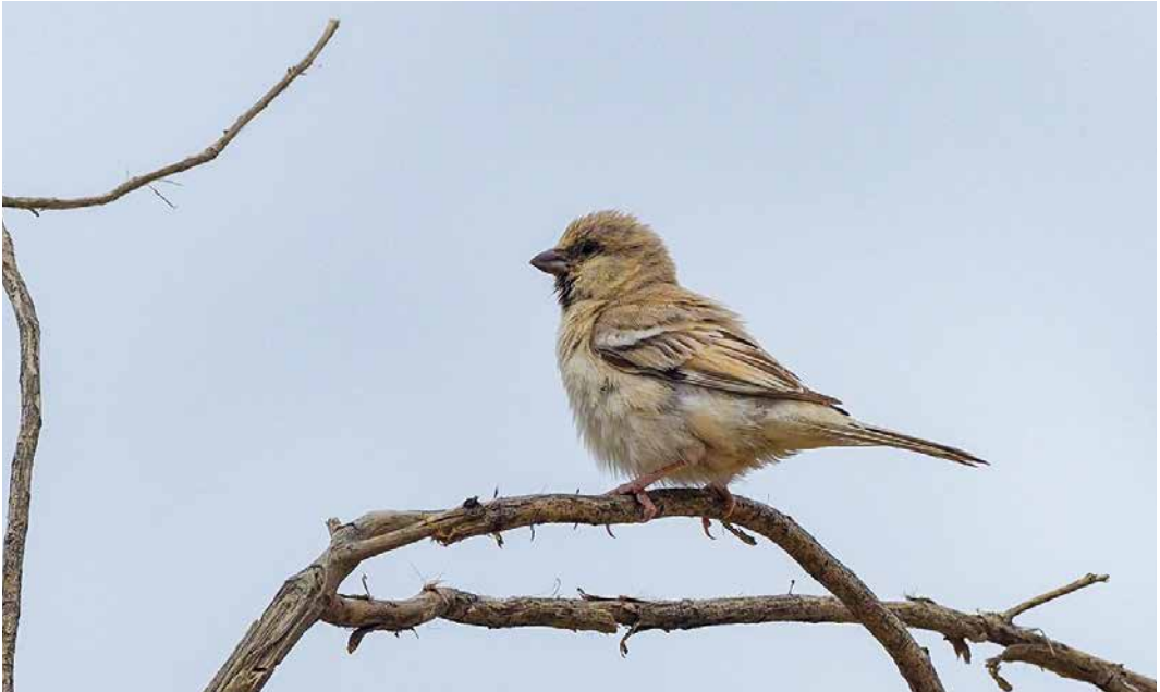
248 Zarudny's Sparrow / Aziatische Woestijnmus Passer zarudnyi , female, south of Turkmenabat, Turkmenistan, 3 June 2019

hai et al 2001). African Desert breeds in the western parts of the Sahara from Western Sahara over Mauritania, Morocco, Algeria and Tunisia to western Libya; it is resident or partly migratory (Shirihai et al 2001). The taxonomic treatment as two species follows the proposition of Shirihai et al (2001) based on differences in morphology (mainly plumage) and song between the two taxa. Given their diagnosability, they certainly qualify as 'phylogenetic species'. However, the decision of Shirihai et al (2001) was based on a then so-called 'modern' interpretation of the biological species concept (cf Helbig et al 2002) and assumed that differences among these strictly allopatric taxa might be sufficient to prevent interbreeding in potential secondary contact. Today, this is usually termed an integrative approach towards species delimitation (cf Sangster 2018).