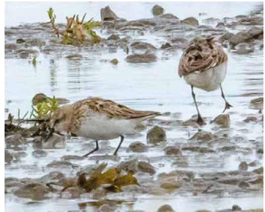
216-218 Alaskastrandloper / Western Sandpiper Calidris mauri , adult, Westhoek, Friesland, 15 augustus 2019 (Wim van Zwieten) 219 Alaskastrandloper / Western Sandpiper Calidris mauri , adult (rechts), met Kleine Strandloper / Little Stint C minuta , Westhoek, Friesland, 15 augustus 2019 (Wim van Zwieten). Webjes tussen tenen aan beide poten.

dichter bij schaarse begroeiing dan meeste andere strandlopers. Meestal rustig lopend en pikkend, soms wat sneller en actiever rennend. Regelmatig kleine stukken vliegend. Bij hoog water overtijend met 10 000en andere strandlopers op binnendijkse akkers (maar daar niet waargenomen).