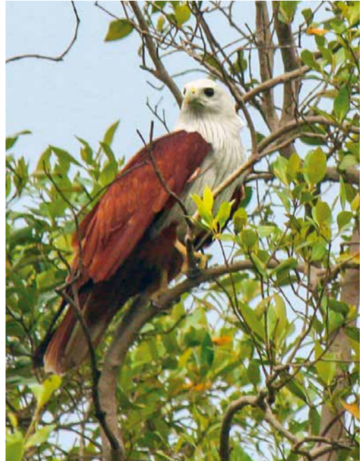
272 Booted Eagle / Dwergarend Aquila pennata , second calendar-year, Vlieland, Friesland, Netherlands, 22 May 2020 ( Marten Miske ) 273 Brahminy Kite / Brahmaanse Wouw Haliastur indus , adult, Bahukalat, Sistan and Baluchestan, Iran, mid-October 2013 ( Amirhossein Aghaei ) 274 Lesser Kestrel / Kleine Torenvalk Falco naumanni , adult male, St Mary's, Scilly, England, 22 March 2020 ( Joe Pender )