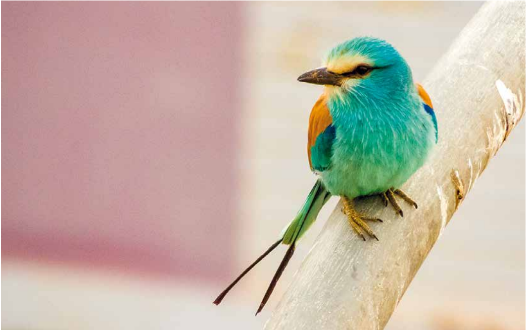
278 Abyssinian Roller / Sahelscharrelaar Coracias abyssinicus , adult, Las Palmas, Gran Canaria, Canary Islands, 2 May 2020 (Marcos Benito)