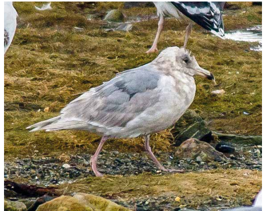
264 African Crane / Afrikaanse Kwartelkoning Crex egregia , Sebkhata Skaymate, Dakhla, Western Sahara, Morocco, 13 February 2019 ( Abdeljebbar Qninba ) 265 Audouin's Gull / Audouins Meeuw Larus audouinii , third calendar-year, Les Grangettes, Vaud, Switzerland, 14 May 2020 ( Sebastian Poirier ) 266 Slender-billed Gull / Dunbekmeeuw Chroicocephalus genei , adult, with Black-headed Gull / Kokmeeuw C. ridibundus , Préverenges, Vaud, Switzerland, 2 May 2020 ( Lionel Maumary ) 267 Glaucous-winged Gull / Beringmeeuw Larus glaucescens , fourth calendar-year, Kvaløysvågen, Tromsø, Troms, Norway, 11 May 2020 ( Fredrik Broms )

10, probably increasing (Sandgrouse 42: 2-28, 2020). An adult Yellow-crowned Night Heron Nyctanassa violacea on Faial on 9-14 April was the sixth for the Azores and the seventh for the WP. The first for mainland Europe was present at Faro, Portugal, from 19 May onwards. The first Western Reef Heron Egretta gularis gularis for Guyana was photographed along the Mahaica river on 18 February. On 9 May, a Brown Booby Sula leucogaster was photographed when perched for several hours on a Belgian trawler sailing from 5 km off the eastern end of Isle of Wight, England, into French waters. The fifth for the Canary Islands was videoed on a yacht off La Palma on 18 May; it had been ringed on Anguilla, Lesser Antilles. The long-staying Pygmy Cormorant Microcarbo pygmaeus at Bruxelles, Belgium, from January 2018 remained through mid-April.