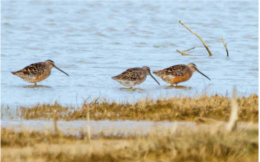
262 Long-billed Dowitchers / Grote Grijsze Snippen Limnodromus scolopaceus , Buda island, Ebro delta, Tarragona, Spain, 6 April 2020