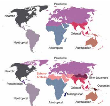
FIGURE 1 Delimitation of different zoogeographic realms or regions based on Wallace (1876; above) and Holt et al (2013; below). Modified from Schweizer & Liu (2018).

The Houbara Bustard complex is usually split in an 'eastern' and 'western' species given that the two do not only differ in male plumage but also in courtship behaviour, including vocalisation (Alekseev 1985, Gaucher et al 1996, Knox et al 2002, Collinson 2004, Sangster et al 2004b, del Hoyo & Collar 2014, Gill et al 2020): Houbara Bustard Chlamydotis undulata is found in North Africa from western Egypt to Morocco and northern