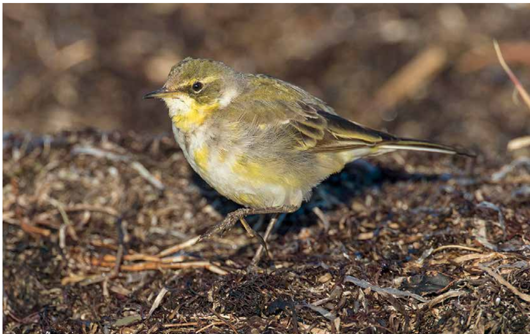
280 Possible Green-headed Wagtail / mogelijke Groenkopkwikstaart Motacilla taivana , Trelleborg, Skåne, Sweden, 31 March 2020