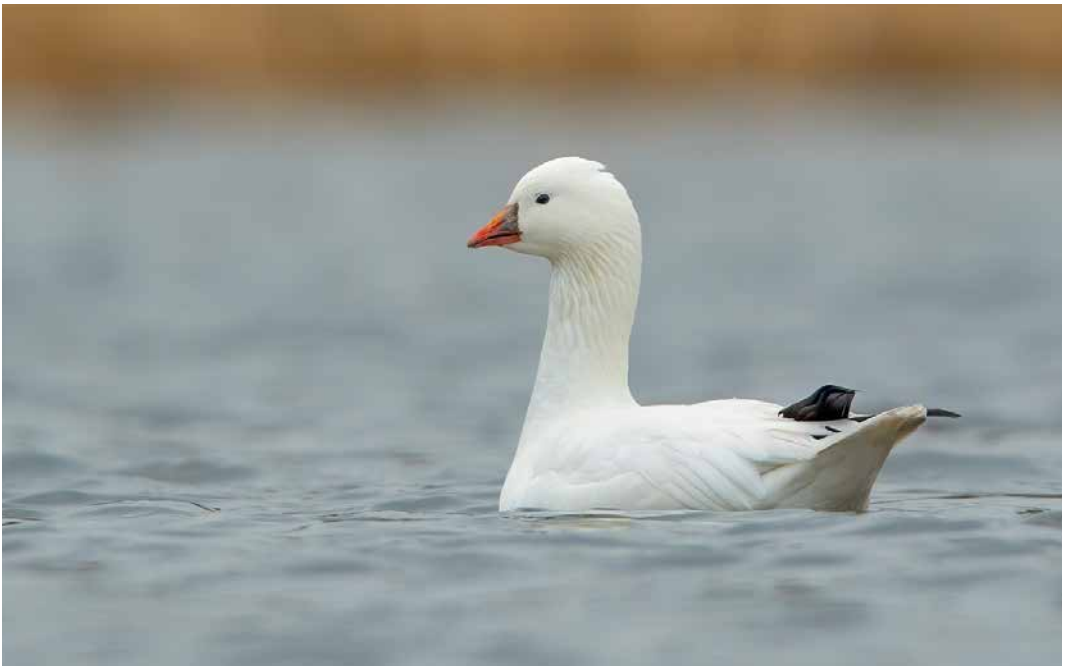
289 Ross' Gans / Ross's Goose Anser rossii , adult, Schiedam, Zuid-Holland, 6 maart 2020 (Hans Overduin)