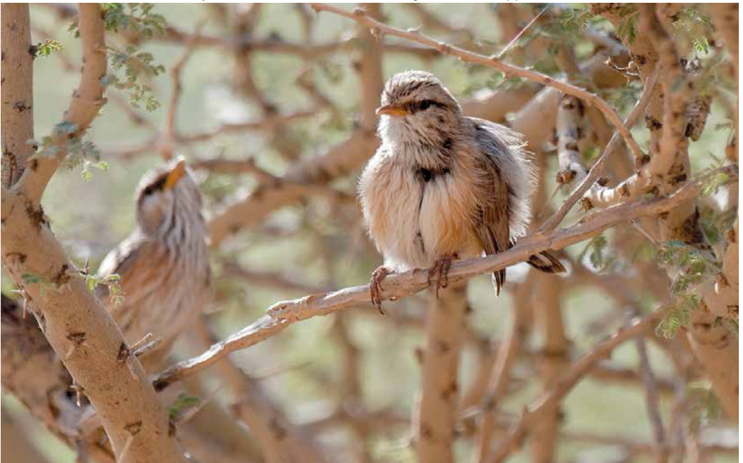
246 Striated Scrub Warblers / Gestreepte Woestijnzangers Scotocerca inquieta striata , Nakhal, Oman, 24 April 2014