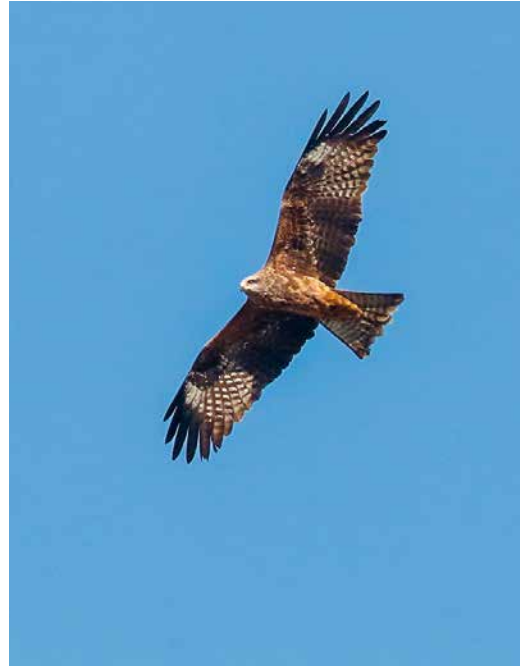
290 Alpengierzwaluw / Alpine Swift Tachymartia melba , Berkheide, Katwijk, Zuid-Holland, 6 april 2020 291 Zwarte Wouw / Black Kite Milvus migrans , Berkheide, Wassenaar, Zuid-Holland, 6 april 2020 292 Steppiekiekendief / Pallid Harrier Circus macrourus , adult vrouwtje, Eierland, Texel, Noord-Holland, 24 april 2020