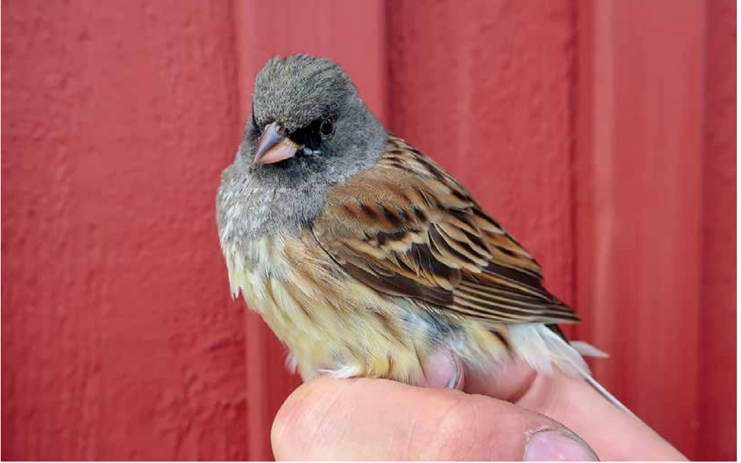
282 Black-faced Bunting / Maskergors Emberiza spodocephala , male, Jurmo, Korppoo, Finland, 10 May 2020 (Pekka Alho)