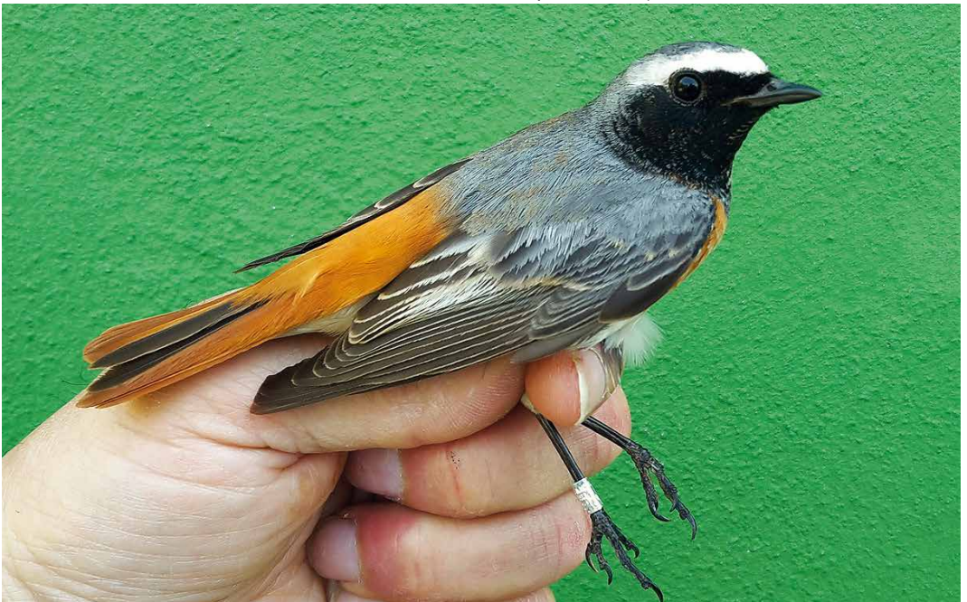
279 Presumed Ehrenberg's Redstart / vermoedelijke Oosterse Gekraagde Roodstaart Phoenicurus phoenicurus samamiscus , male, Ghadira, Malta, 18 April 2020