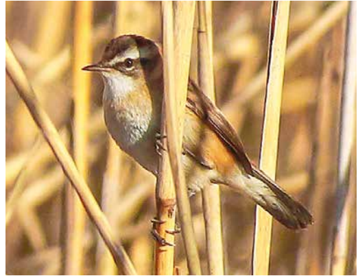
285 Moustached Warbler / Zwartkoprietzanger Acrocephalus melanopogon , Świerklaniec reservoir, Silesia, Poland, 16 April 2020 (Krzysztof Belik)

FINCHES TO AMERICAN WARBLERS The fifth Asian Crimson-winged Finch Rhodopechys sanguineus for Cyprus was seen at Karpasia on 16 March. Trumpeter Finches Bucanetes githagineus were reported, eg, at Majjistral, Malta, on 5-20 March; on Pantelleria, Sicily, Italy, on 5 May; at Espichel Cape, Setúbal, Portugal, on 9 May (fifth record); and at Shabla, Dobrich, Bulgaria, on 14 May (second). A Citril Finch Carduelis citrinella trapped near Verviers, Liège, on 17 April was (already) the 16th for Belgium. The fifth Song Sparrow Melospiza melodia for Fair Isle and Scotland was present on 9-11 April. On 15 May, a White-crowned Sparrow Zonotrichia leucophrys was found on Fetlar, Shetland, Scotland. If accepted, a male photographed (only once) by a non-birder inland at Hunsel, Limburg, on 17 May will be the first for the Netherlands (a male at Spaarndam, Noord-Holland, from December 1981 to February 1982 was recently rejected after review because the only photograph showed a damaged toe, now regarded as evidence of captive origin). A male Cirl Bunting Emberiza cirlus was singing at Zedelgem, West-Vlaanderen, Belgium, on 21 April. In June 2019, a large population of Yellow-breasted Bunting E aureola was discovered in the Tunka valley near Baikal lake, Russia, with an average density of 30 individuals per km 2 and a total population estimate