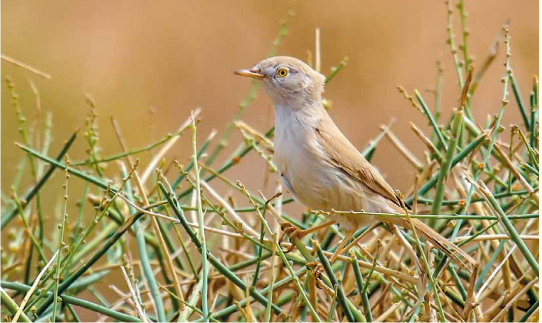
247 African Desert Warbler / Afrikaanse Woestijngrasmus Sylvia deserti , Merzouga, Morocco, 1 April 2019

eta) and one from Turkmenistan ( S i platyura ).