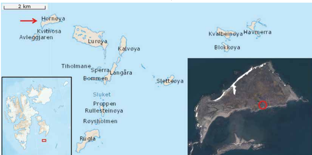
FIGURE 1 Map of Svalbard, Tusenøyane islands group, and Hornøya ( https://toposvalbard.npolar.no ). Location of found bird indicated by red circle.

SIZE & SHAPE Small passerine with relatively short wings and quite long, graduated tail. P2 (primaries numbered from outside) in folded wing only marginally shorter