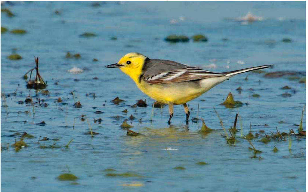
297 Citroenkwikstaart / Citrine Wagtail Motacilla citreola , tweede-kalenderjaar mannetje, Amsterdamse Waterleidingduinen, Zuid-Holland, 16 april 2020 ( Kees van Dommele )