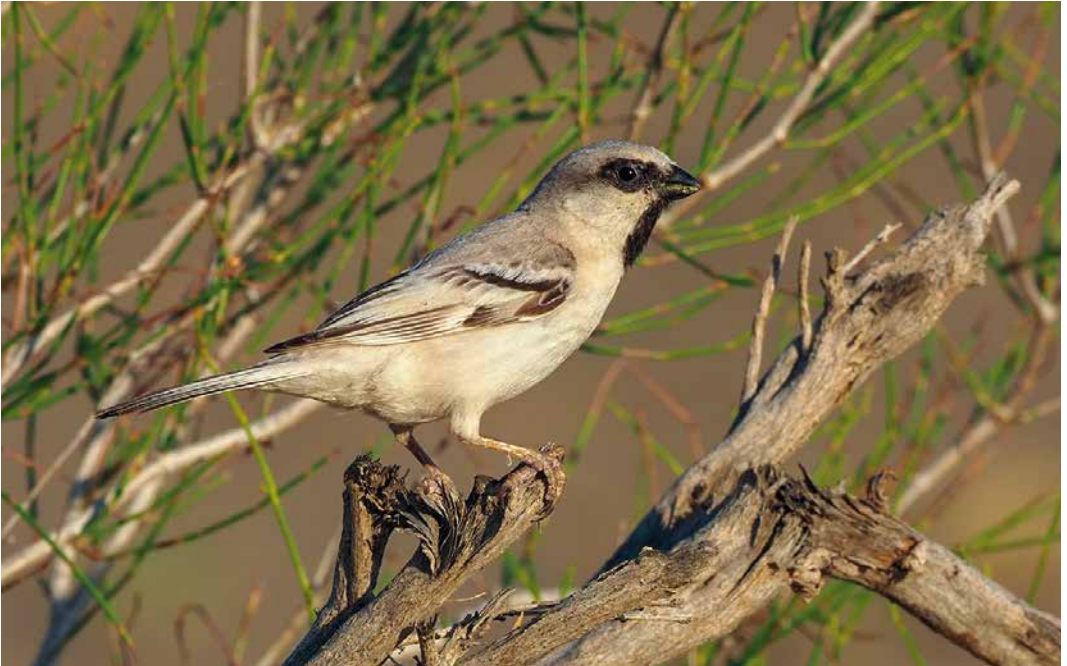
249 Zarudny's Sparrow / Aziatische Woestijnmus Passer zarudnyi , male, south of Turkmenabat, Turkmenistan, 3 June 2019