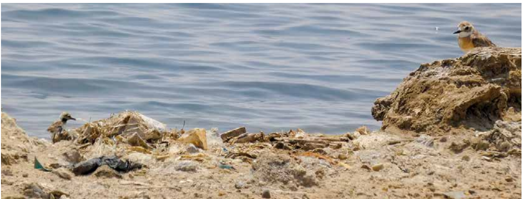
235 Greater Sand Plover / Woestijnplevier Anarhynchus leschenaultii , juvenile, Port Said, Port Said Governorate, Egypt, 27 July 2014 ( Mohamed I Habib ) 236 Greater Sand Plover / Woestijnplevier Anarhynchus leschenaultii , juvenile, Port Said, Port Said Governorate, Egypt, 7 September 2015 ( Mohamed I Habib ) 237 Greater Sand Plover / Woestijnplevier Anarhynchus leschenaultii , chick, Port Said, Port Said Governorate, Egypt, 30 June 2019 ( Mohamed I Habib ) 238 Greater Sand Plover / Woestijnplevier Anarhynchus leschenaultii , adult female, Port Said, Port Said Governorate, Egypt, 30 June 2019 ( Mohamed I Habib ) 239 Greater Sand Plovers / Woestijnplevier Anarhynchus leschenaultii , adult female with chick, Port Said, Port Said Governorate, Egypt, 30 June 2019 ( Mohamed I Habib )