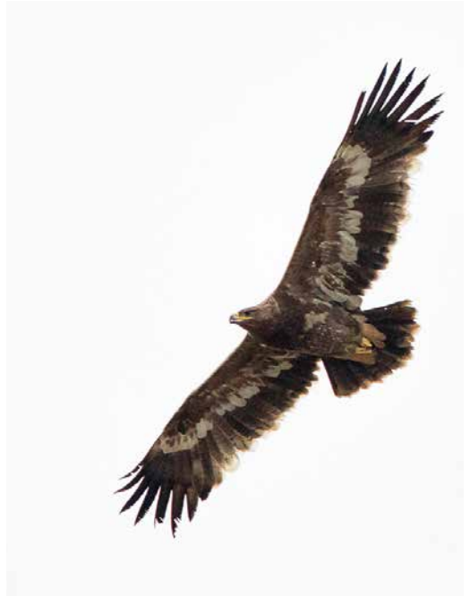
275 Steppe Eagle / Stepparend Aquila nipalensis , third calendar-year, Veluwemeer, Flevoland, Netherlands, 13 May 2020 276 Steppe Eagle / Stepparend Aquila nipalensis , second calendar-year, Wilhelminadorp, Zeeland, Netherlands, 22 May 2020 277 Steppe Eagle / Stepparend Aquila nipalensis , second calendar-year, Wilhelminadorp, Zeeland, Netherlands, 22 May 2020