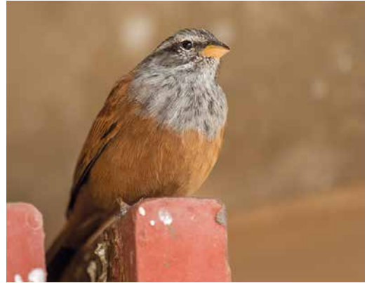
255 House Bunting / Huisgors Emberiza sahari , male, Paradise Valley, Agadir, Morocco, 7 November 2014

Genetic data has recently been used to reconstruct the evolutionary history of another species complex characteristic of the Saharo-Arabian desert belt: the House Bunting complex. This complex has traditionally been considered as a single polytypic species distributed in the Sahara from Mauritania over Morocco and then patchily to eastern and north-western Chad, with a disjunct population in coastal north-eastern Africa south to northern Kenya, as well as from the Middle East to north-western India (cf Kirwan & Shirihihi 2007; figure 2). Based on a review of its morphology and vocalisations, Kirwan & Shirihihi (2007) proposed a split into two taxa, Striolated Bunting Emberiza striolata (hereafter striolata ) in the east of the range, including the subspecies E s saturiator and the controversial taxon E s 'jebelmarrae' (see below; cf figure 2), and House Bunting E sahari (hereafter sahari ) in the west. This treatment has been widely adopted since (eg, Rising et al 2011, Sangster et al 2013, del Hoyo & Collar 2016, Gill et al 2020). Moreover, Olsson et al (2013) revealed levels of differentiation in mtDNA between the two groups (3.0-3.6% in cytochrome b) as