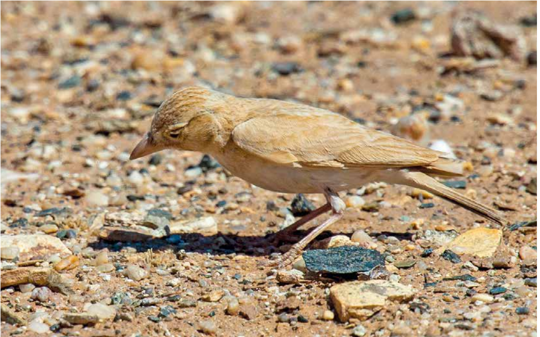
245 African Dunn's Lark / Afrikaanse Dunns Leeuwerik Eremalauda dunnii dunnii , Aousserd, Western Sahara, Morocco, 17 March 2018