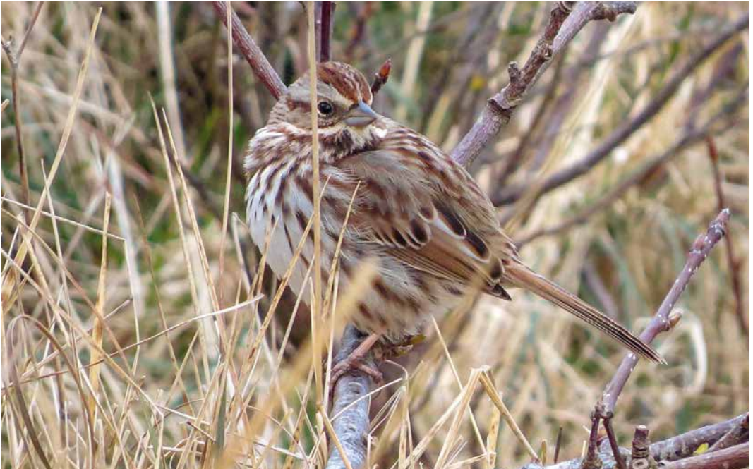
283 Song Sparrow / Zanggors Melospiza melodia , Fair Isle, Shetland, Scotland, 9 April 2020