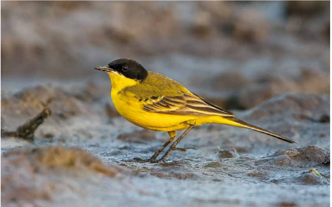
296 Balkankwikstaart / Black-headed Wagtail Motacilla feldegg , mannetje, Lentevreugd, Wassenaar, Zuid-Holland, 23 april 2020