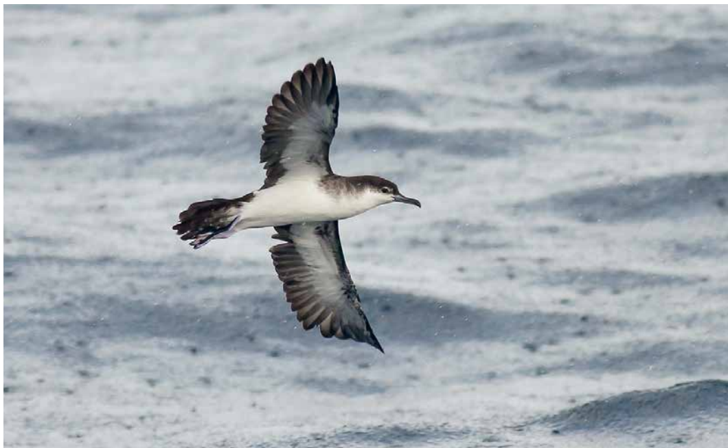
211 Audubon's Shearwater / Audubons Pijlstormvogel Puffinus lherminieri , Hatteras, North Carolina, USA, 25 August 2018 ( Kate Sutherland ) 212 Audubon's Shearwater / Audubons Pijlstormvogel Puffinus lherminieri , Hatteras, North Carolina, USA, 28 May 2018 ( Peter Flood ). Head pattern of both birds similar to Skagerrak Audubon's (plate 208). 'Saddlebags' are variable in Audubon's and are absent in Skagerrak shearwater and Audubon's in plate 212. Feet and legs are lowered in plate 211, revealing more extensive dark in undertail-coverts compared with Skagerrak shearwater but this difference is not unusual. Note relatively long tail.