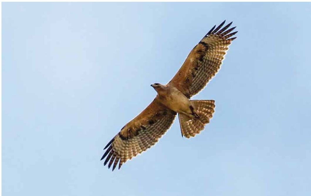
293 Havikarend / Bonelli's Eagle Aquila fasciata , tweede-kalenderjaar, De Koog, Texel, Noord-Holland, 24 april 2020 (Jeroen de Bruijn) 294 Roodpootvalk / Red-footed Falcon Falco vespertinus , adult mannetje, Wanteskuup, Noord-Beveland, Zeeland, 23 april 2020 (Lennart Verheuvell) 295 Grijsze Wouw / Black-winged Kite Elanus caeruleus , Colijnsplaat, Noord-Beveland, Zeeland, 5 april 2020 (Huibert van den Bos)